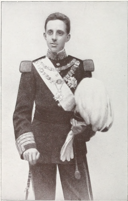
ALFONSO XIII., KING OF SPAIN