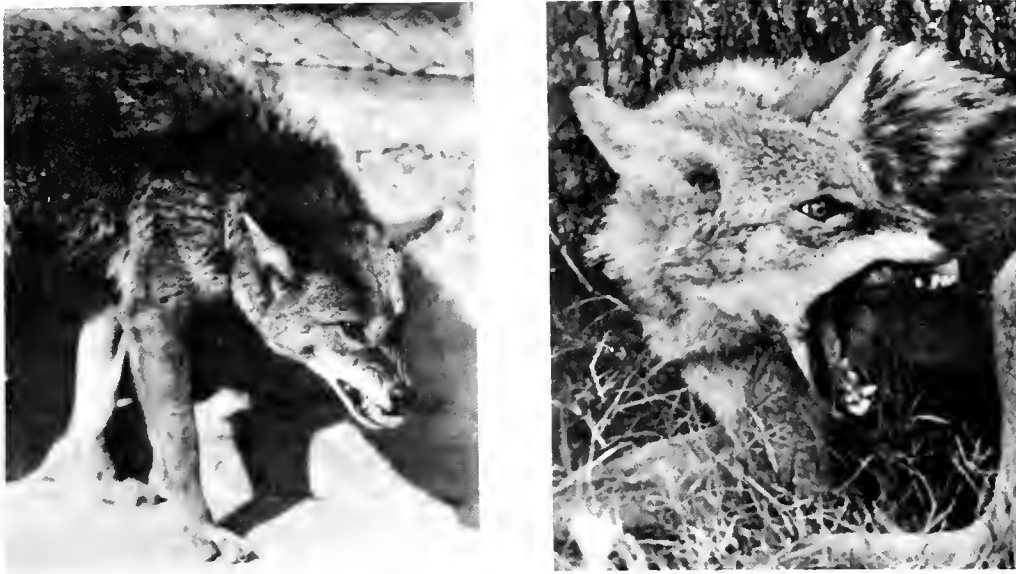
Figure 4. Red wolf (left) and coyote (right) threat behavior. A red wolf's tongue does not normally protrude as shown here.