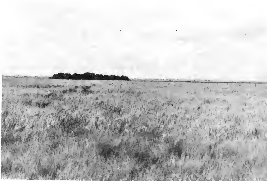
Figure 2. Photograph of coastal prairie red wolf habitat. An "island" of brush in the background.

There are also "islands" of loblolly pine ( Pinus taeda ), mixed with hardwoods. The predominant hardwood species are oaks ( Quercus ) magnolia ( Magnolia grandiflora ), and sweet gum ( Liquidambar styraciflua ). (See Figure 2.)