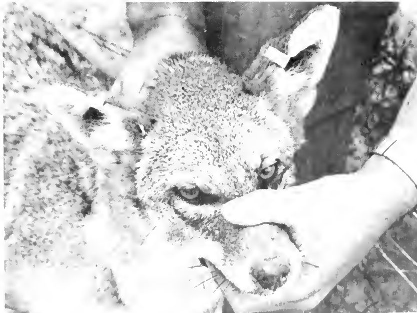
Figure 3. Photograph of a red wolf (top) and a coyote (bottom). Notice the facial markings, the length of the ears, and the width of the nose pad and muzzle.