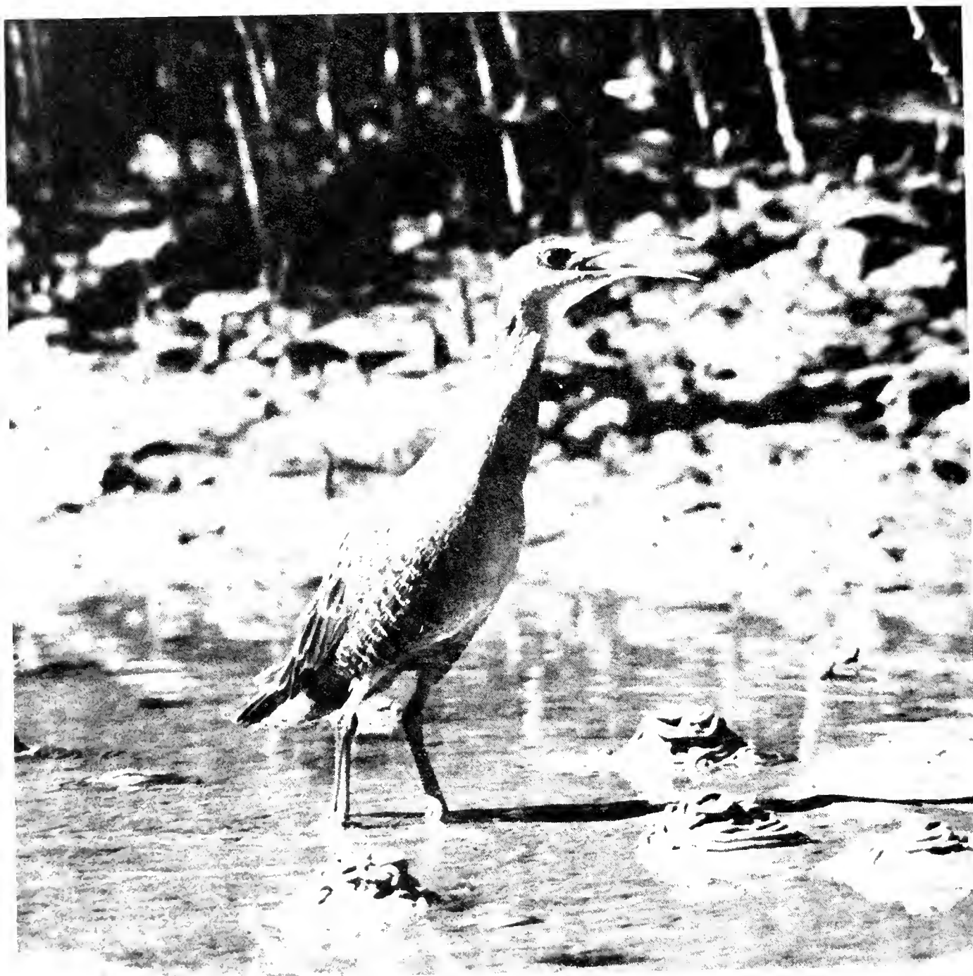
Yuma clapper rail at Topock Marsh, Arizona.