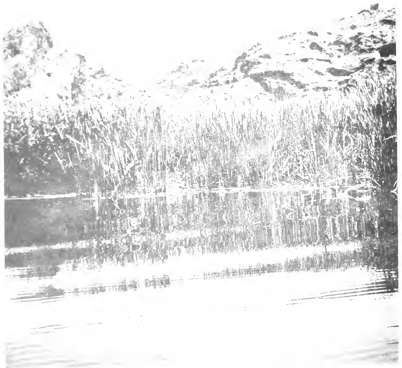
Cattail marsh in Topock Gorge area of Colorado River. Areas like this support one or two breeding pairs of Yuma clapper rails.