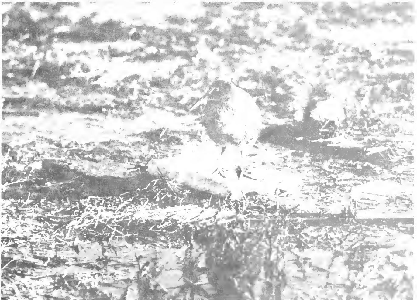
This light-footed clapper rail rests on a convenient chunk of styrofoam as high winter tides temporarily inundate the marsh at Tijuana Estuary.