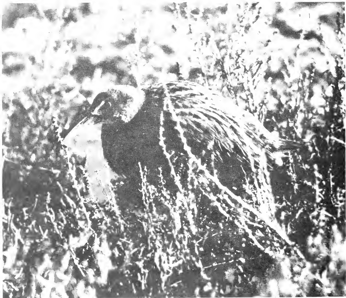
A light-footed clapper rail among the pickleweed at Upper Newport Bay, California.