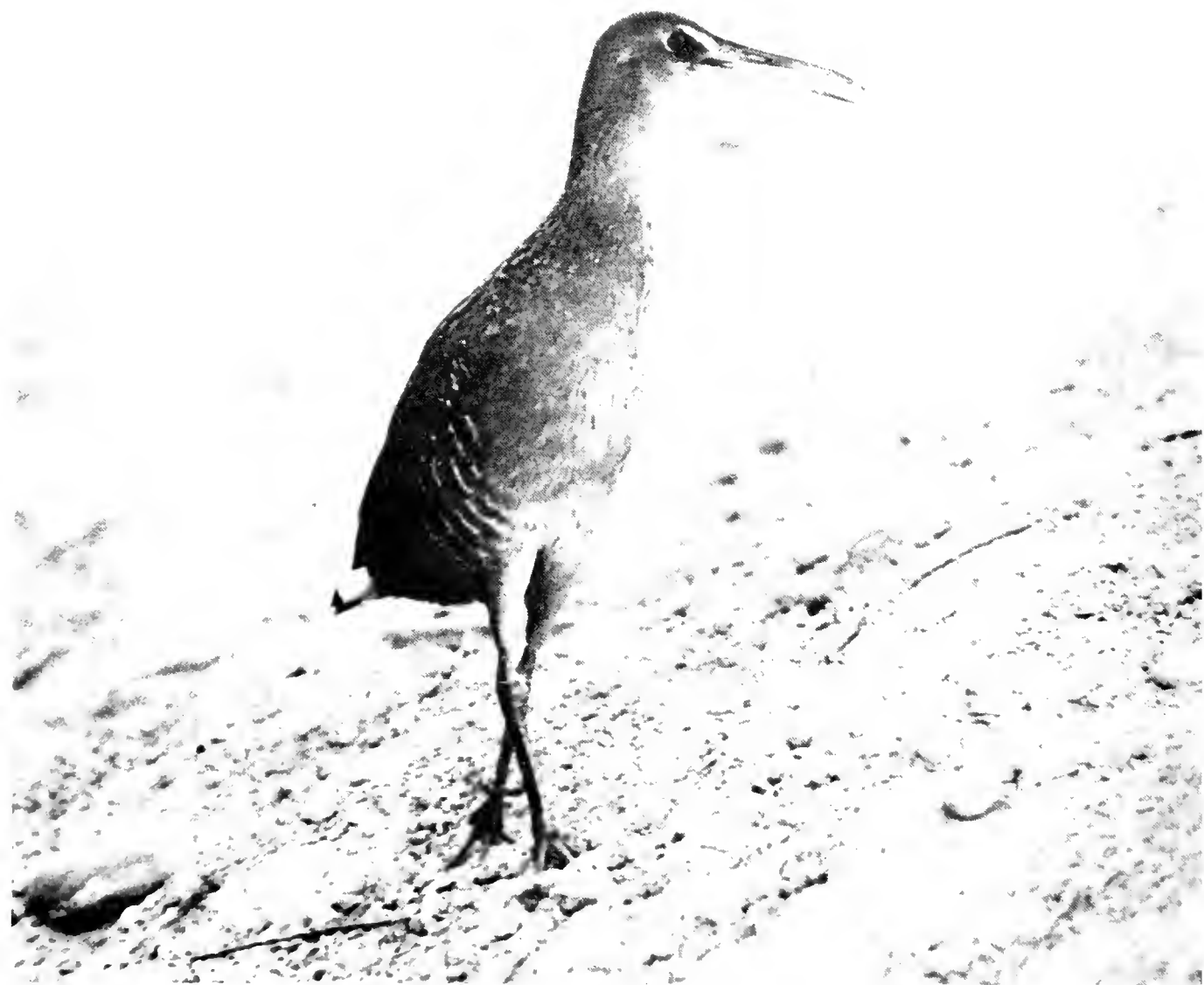
Sonoran clapper rail in mangrove swamp, Punta Sargento, Sonora, Mexico.