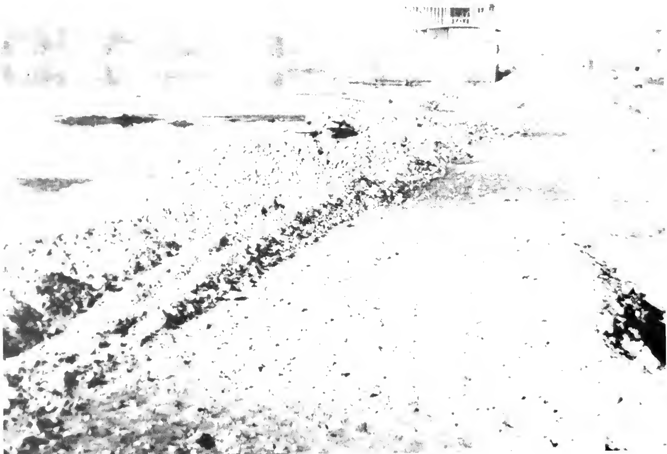
Land fills to hold apartment complexes are among the many current threats to light-footed rail habitat. This one is at Tijuana Estuary, California.