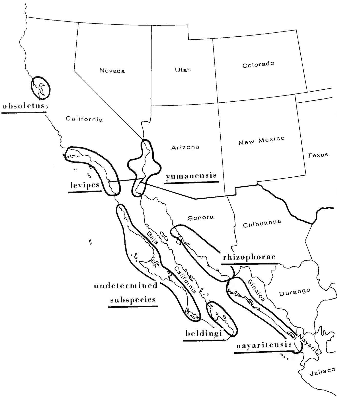
FIGURE 1. DISTRIBUTION OF WESTERN CLAPPER RAILS