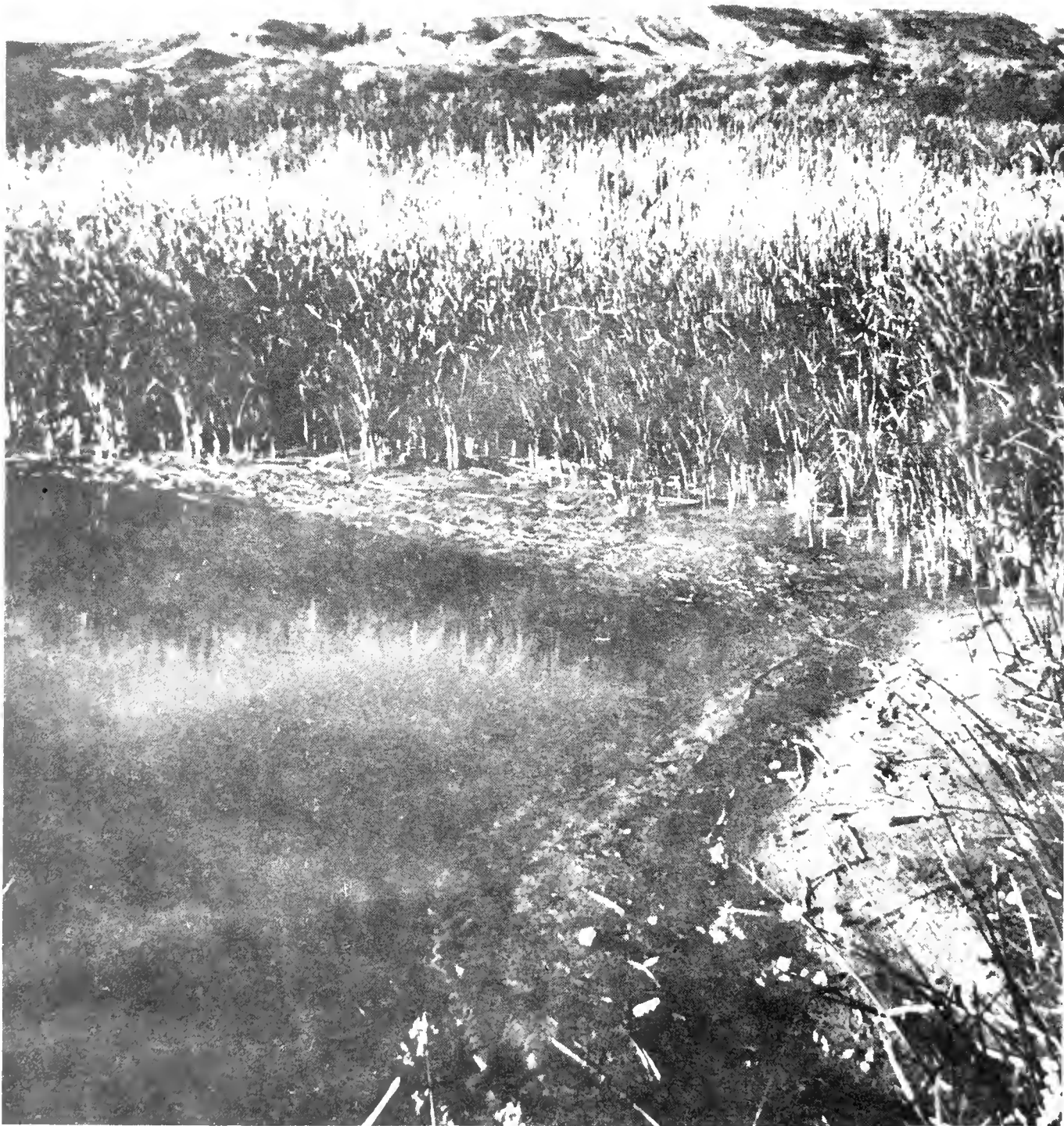
Typical mudflat feeding area for Yuma clapper rails. Vegetation is a mixture of cattails and three-square bulrush.