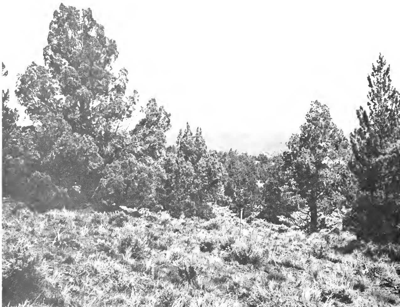
Fig. 2. Western juniper forests have widely spaced trees with limbs, often down to ground level. Between the trees big sagebrush, rabbitbrush, bluebunch wheatgrass, and other species grow. Many birds breed in this forest and the juniper berries are an important source of food for large populations of wintering birds. Western juniper is valuable wildlife habitat in central Oregon.

blows from a westerly or southwesterly direction and is frequently gusty.