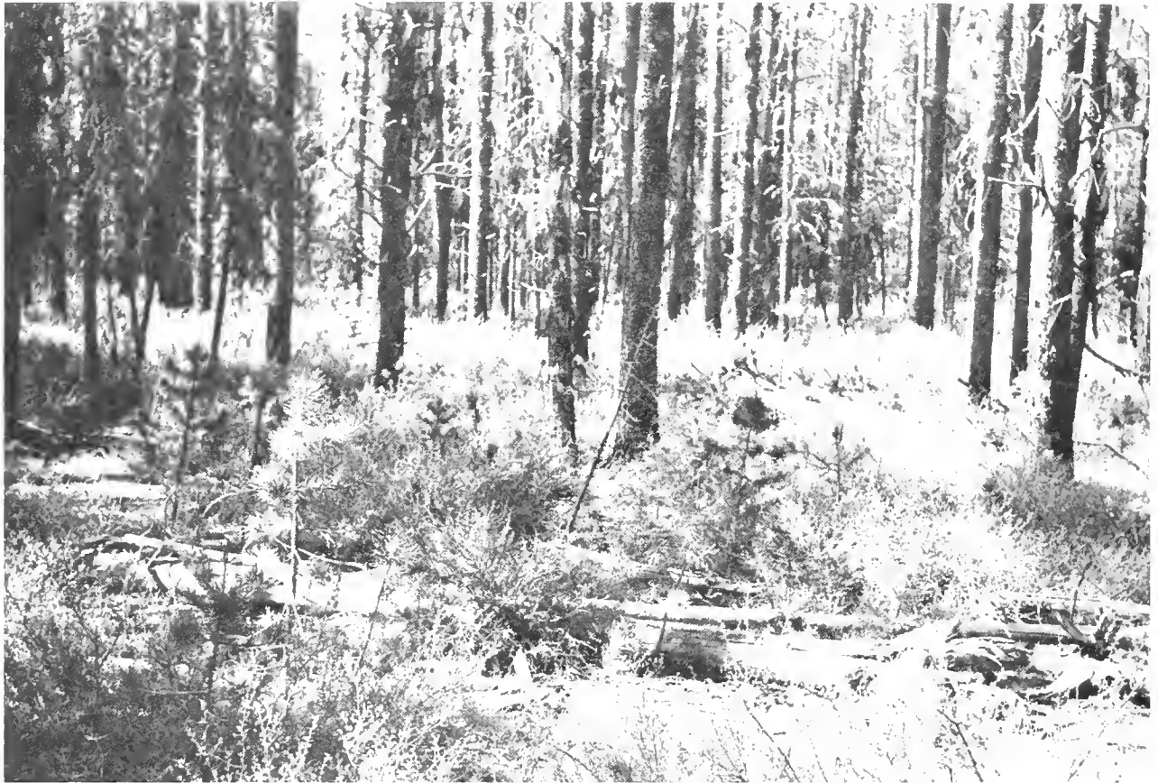
Fig. 4. Mature lodgepole pine forests in central Oregon form nearly pure stands and have a large number of live and dead stems per hectare. The ground is often crisscrossed with fallen trees. Bitterbrush forms a dense shrub cover wherever light penetrates to the forest floor. The black-backed three-toed woodpeckers find this an especially good place to search for bark beetles and woodborers.

(radius 3.5 m) plot centered in each of the 0.04-ha plots. Canopy coverage of the trees was obtained from a vertical photograph taken from the ground at the center of each 0.04-ha plot except in juniper which was photographed from the ground obliquely over the plot center. The height of the tallest trees on each 0.04-ha plot was measured with a clinometer.