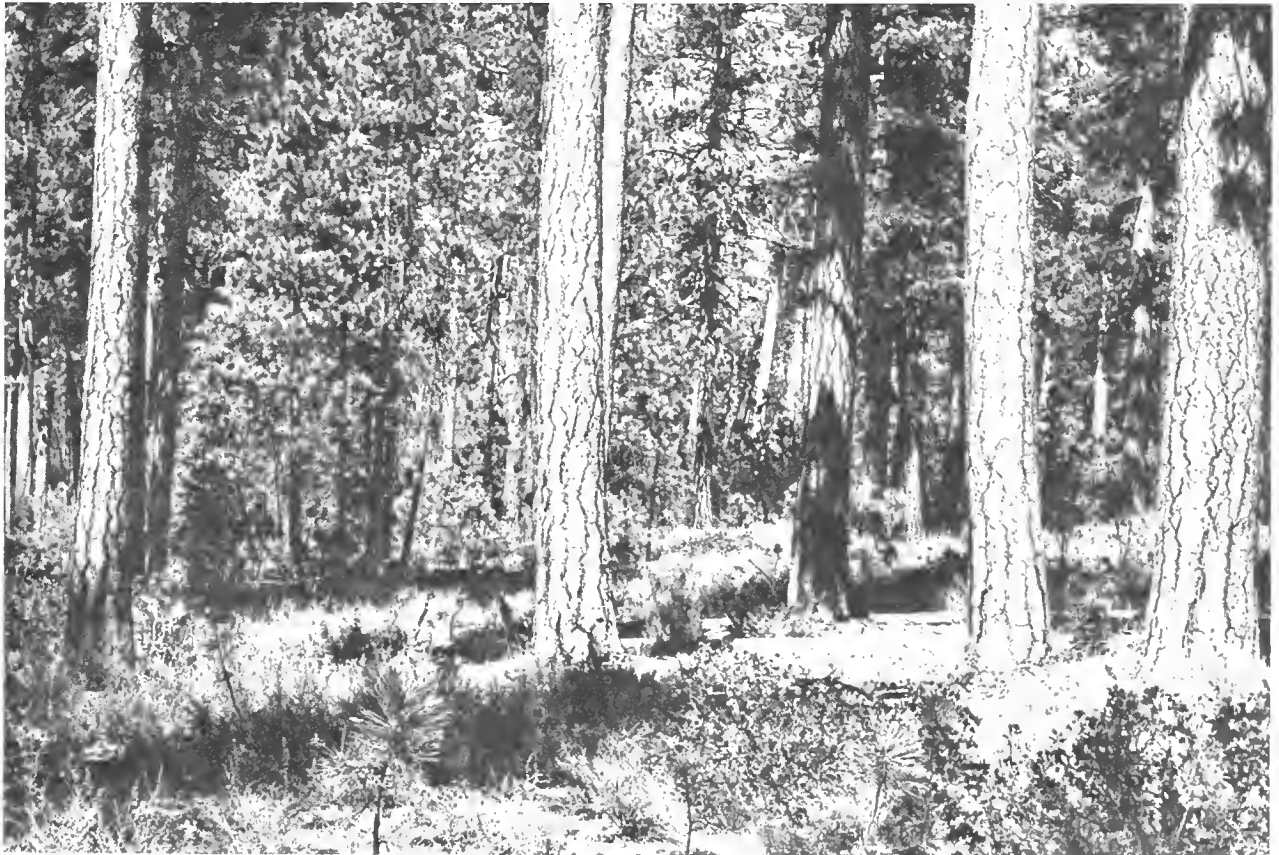
Fig. 3. Old-growth ponderosa pine stands may vary from open park-like conditions to those with dense reproduction or shrub cover. It is especially good habitat for tree oriented birds. During good seed years large flocks of crossbills and grosbeaks come to these forests to feed and small mammals also respond to this bountiful food supply.

tree stems over 5.1 cm diameter were tallied by species, diameter class, and whether alive or dead. Diameters of all species, except juniper, were measured 1.4 m above ground; junipers were measured at ground level. Since juniper often grows in clumps, each apparently independently rooted branch was considered a stem. Two measuring tapes 22.6 m long and crossed in the center at right angles were placed across the center of each plot, forming a total of 45.2 m of line. Shrub cover and coverage of trees less than 0.9 m in height were measured by the total length of canopy coverage (Daubenmire 1959) of each species intercepted by the 22.6-m plot tapes. A total of 16 mechanically selected herbaceous vegetative microplots was sampled at 3.0-m intervals along the tapes across each of the 0.04-ha plots with a rectangular steel frame 20 \times 50 cm as described by Daubenmire (1959). The frame was placed at right angles along one side of the tape and canopy coverage of each species was estimated by broad classes. A smaller subsample of seedlings and saplings (trees less than 5.1 cm dbh) was taken on one 40.5-m 2