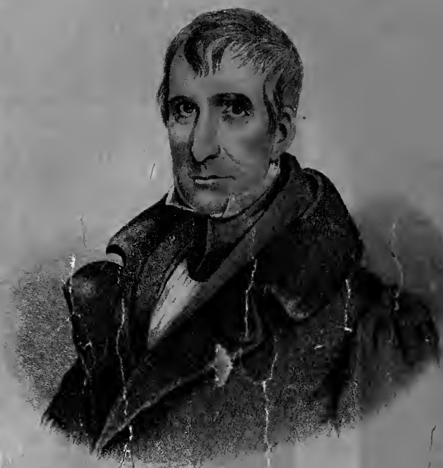
GEN. W. H. HARRISON