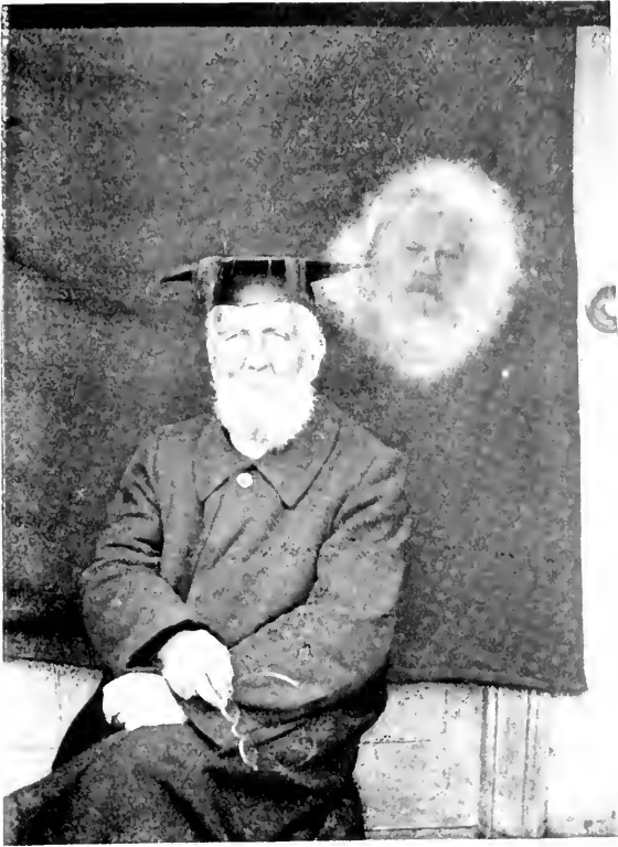
A skotograph (impression obtained on sensitive film without exposure in the camera) of Archdeacon Colley. The head, seen after death, is bending forward, the eyes appear to be opening, and, in Miss F. R. Scatcherd's opinion, no trickery of any nature could so transform any existing photograph of the dead man to the resemblance of the dead body, with the differences indicated.