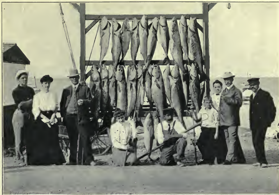
FIG. 7.—A day's sport at Santa Catalina Island with white sea bass.