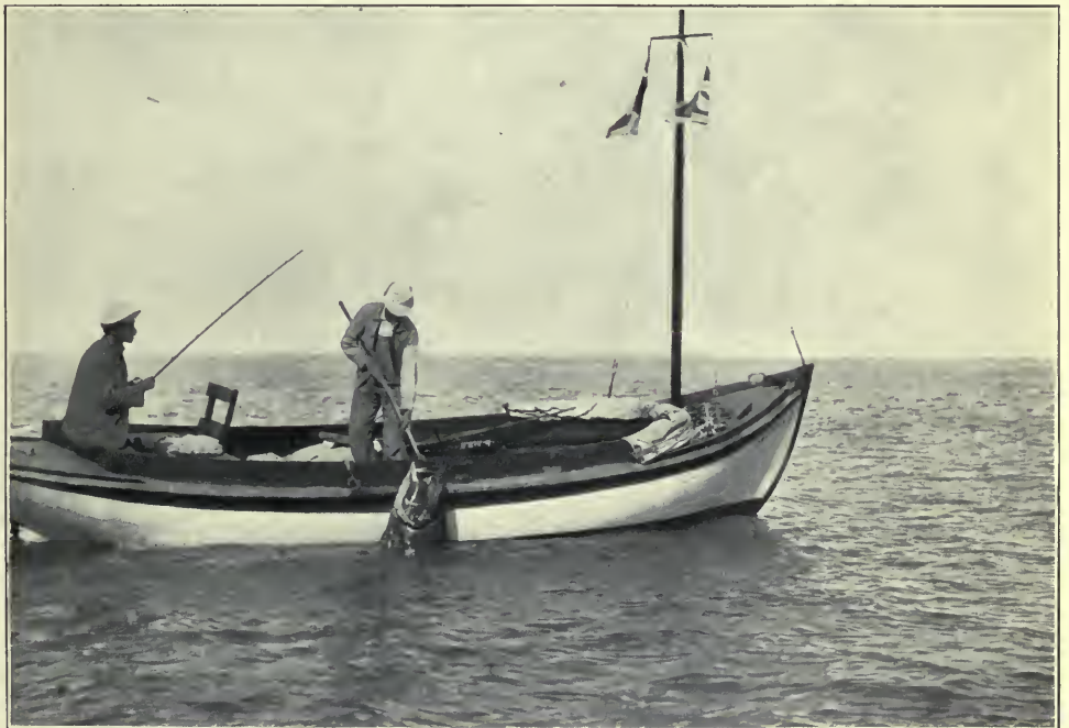
FIG. 2.—Gaffing a 240-pound capture.

ANGLING FOR BLACK SEA BASS, SANTA CATALINA ISLAND.