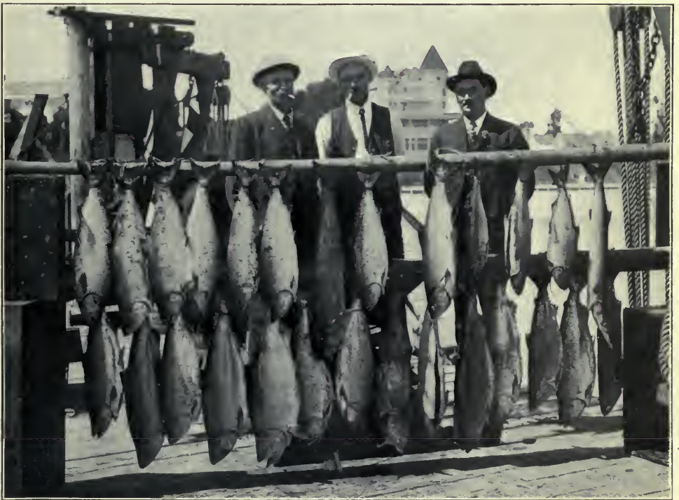
FIG. 10.—A salmon (rod and reel) catch, Del Monte, California.