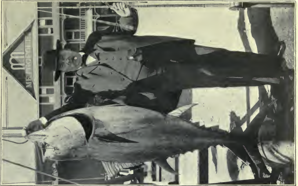
FIG. 6.—Leaping tuna caught with rod and reel at Santa Catalina.