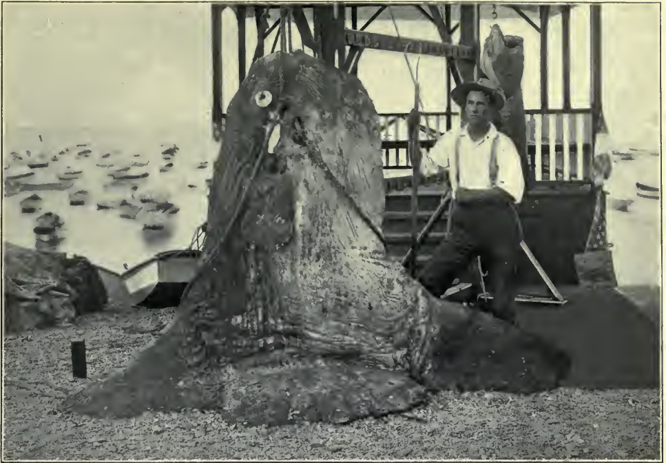
FIG. 9.—The record sunfish, Santa Catalina Island, too heavy to weigh; estimated at 2,500 pounds.