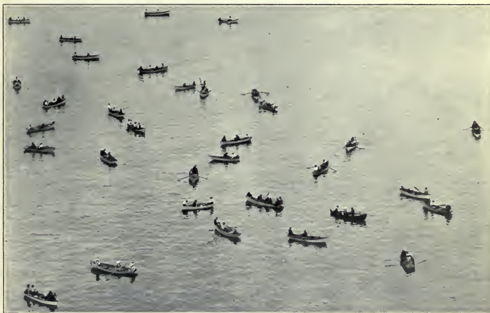
FIG. 8.—The yellowtail anglers of Avalon Bay, California (Santa Catalina Island); 200 to 300 boats often seen, all fishing with rod and reel.