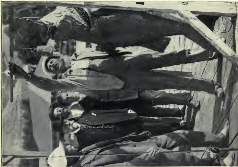
FIG. 3.—Weighing a big sea bass.