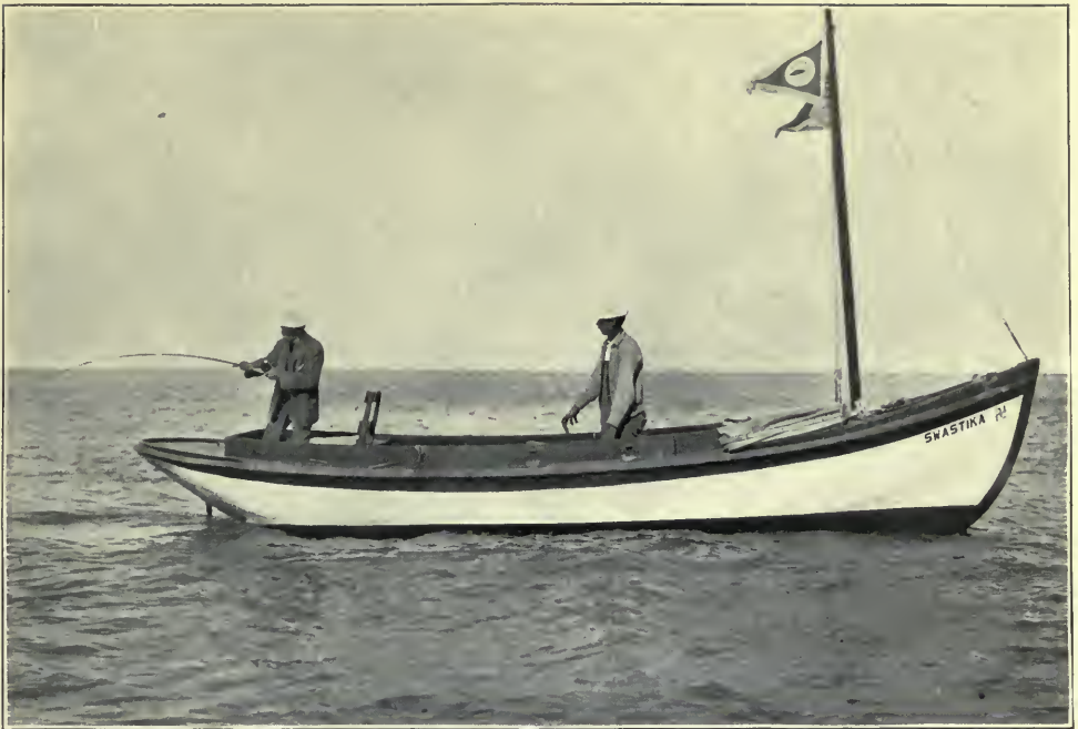
FIG. 1.—The strike.