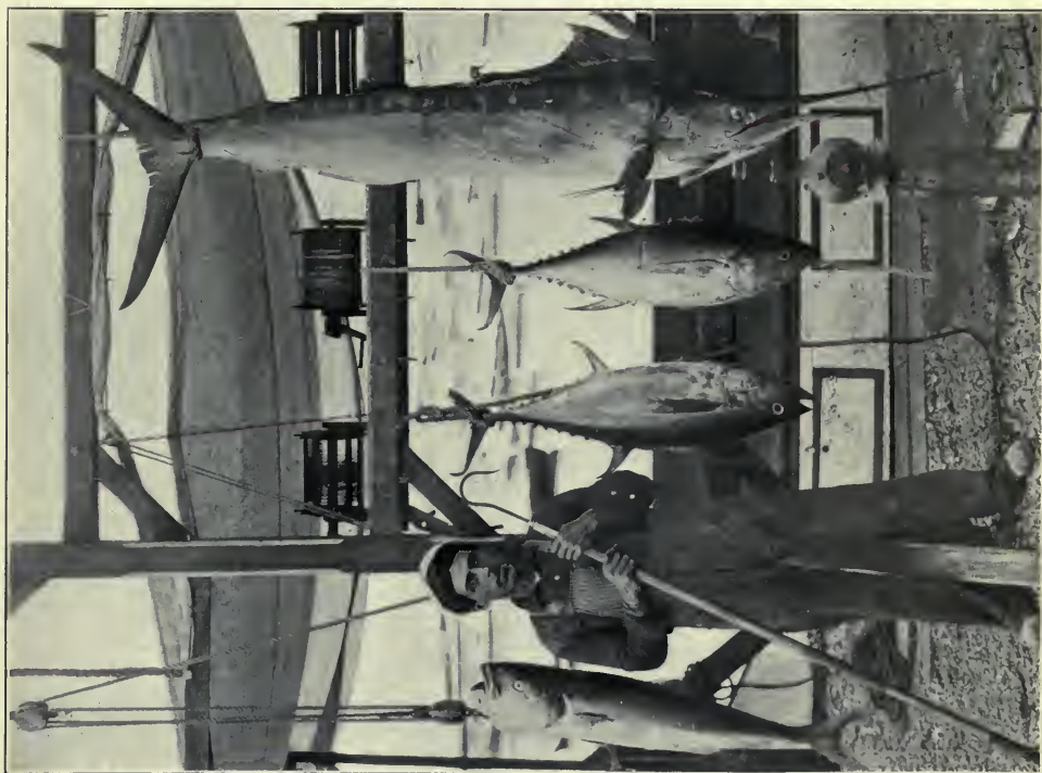
FIG. 11.—Swordfish ( Xiphias ), yellow-fin tuna, and yellowtail, caught with rod and reel at Santa Catalina Island.