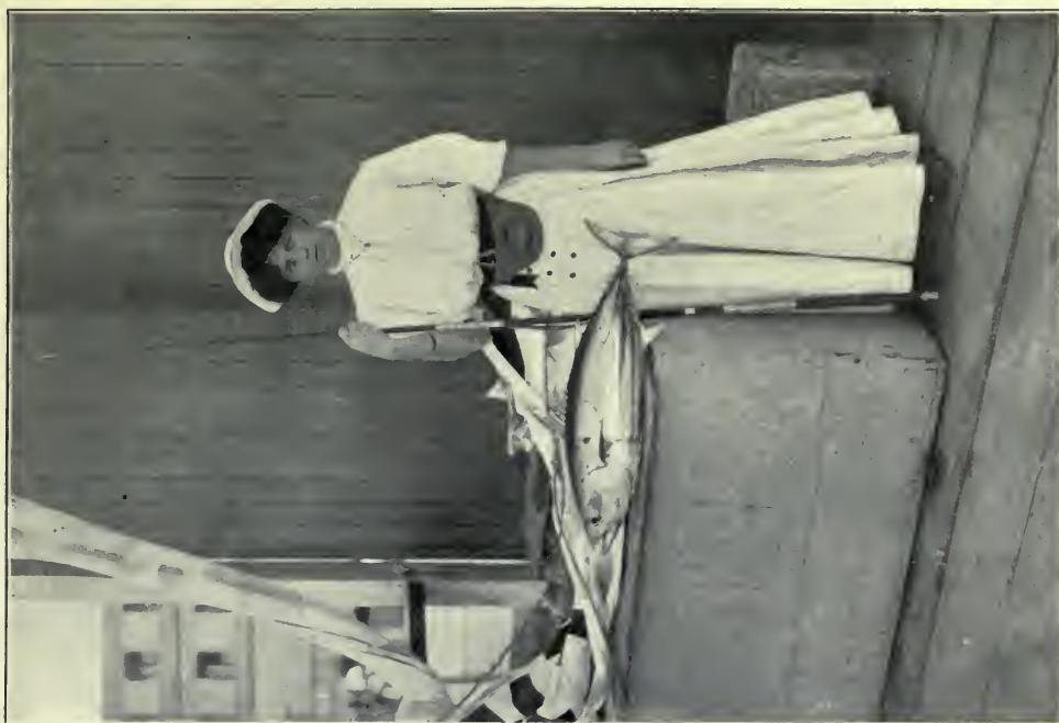
FIG. 4.—The record bonito, Tuna Club 1908, rod and reel. This fish, which weighed 22 pounds, fought for more than an hour. Note angler's belt with socket for rod butt.