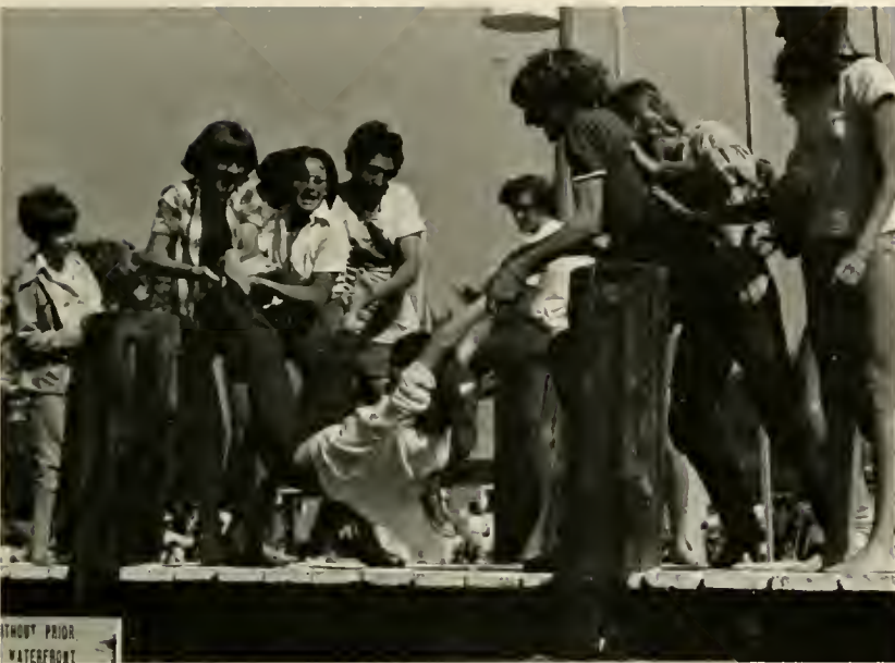
WITHOUT PRIOR WATERFRONT