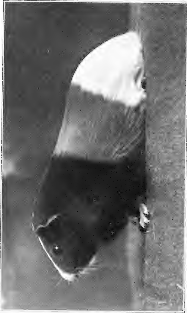
ENGLISH TORTOISE and WHITE CAVY