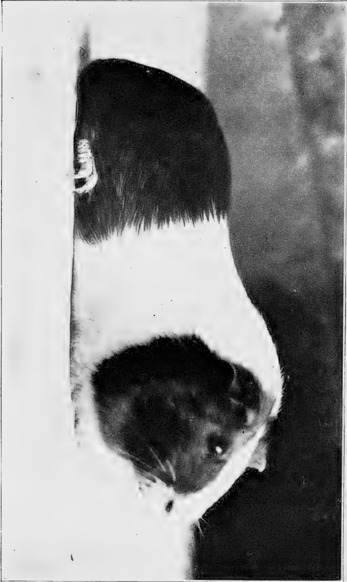
DUTCH MARKED CAVY