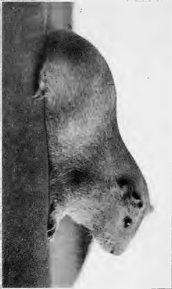
ENGLISH SILVER ACOUTI CAVY