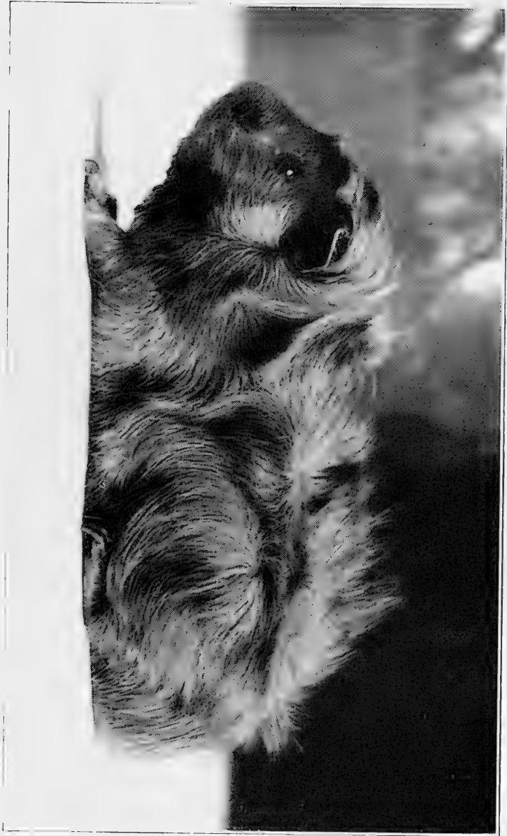
BLACK ABYSSINIAN CAVY