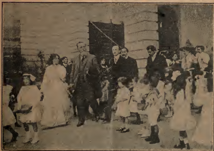
Distribution of Prizes to Kindergarten Children in Mexico City, D. F.