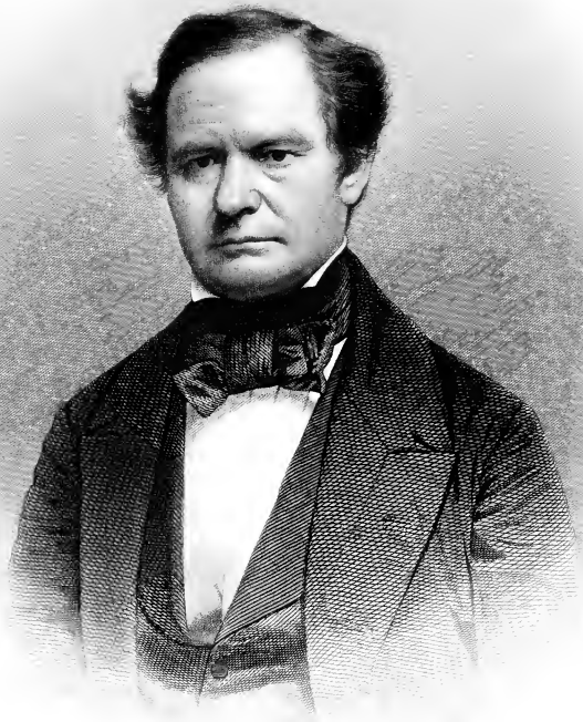
Geo. D. Prentice.