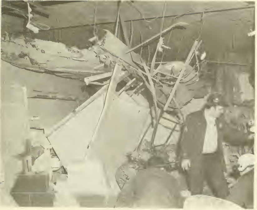
Third-floor men's room damage.