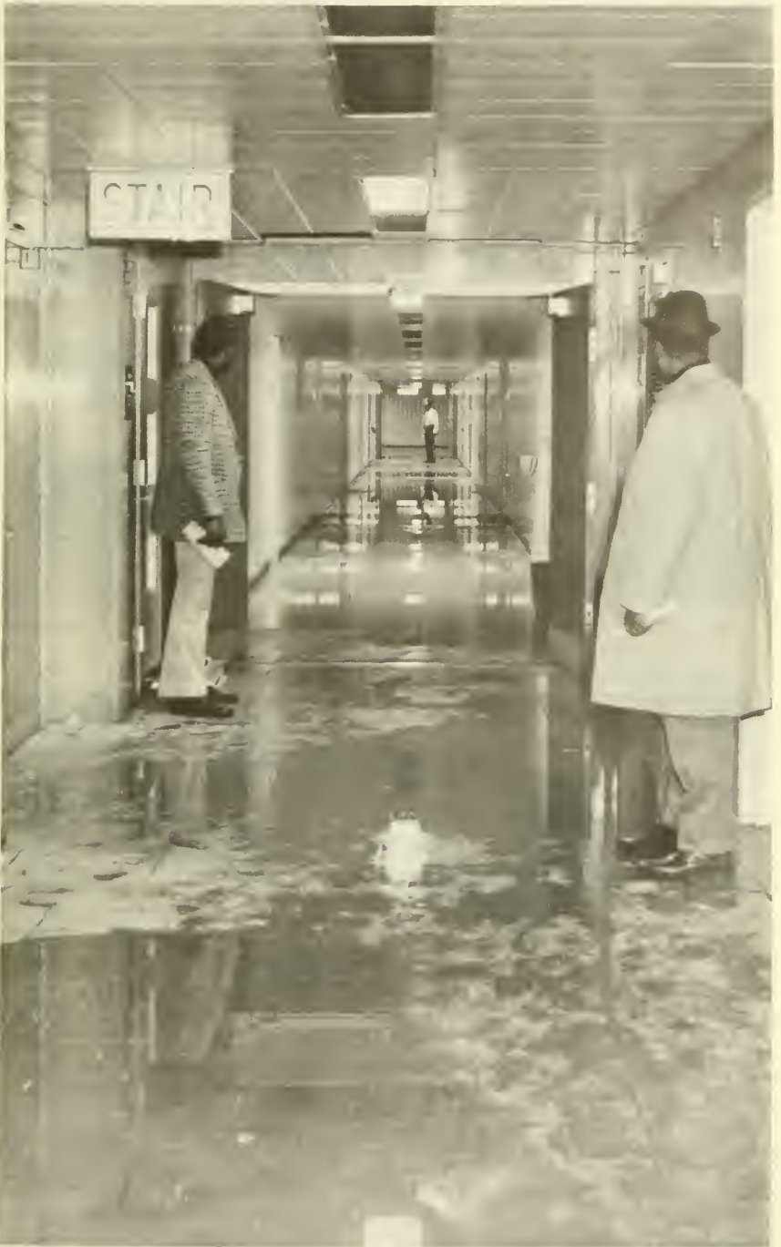
First-floor water damage.