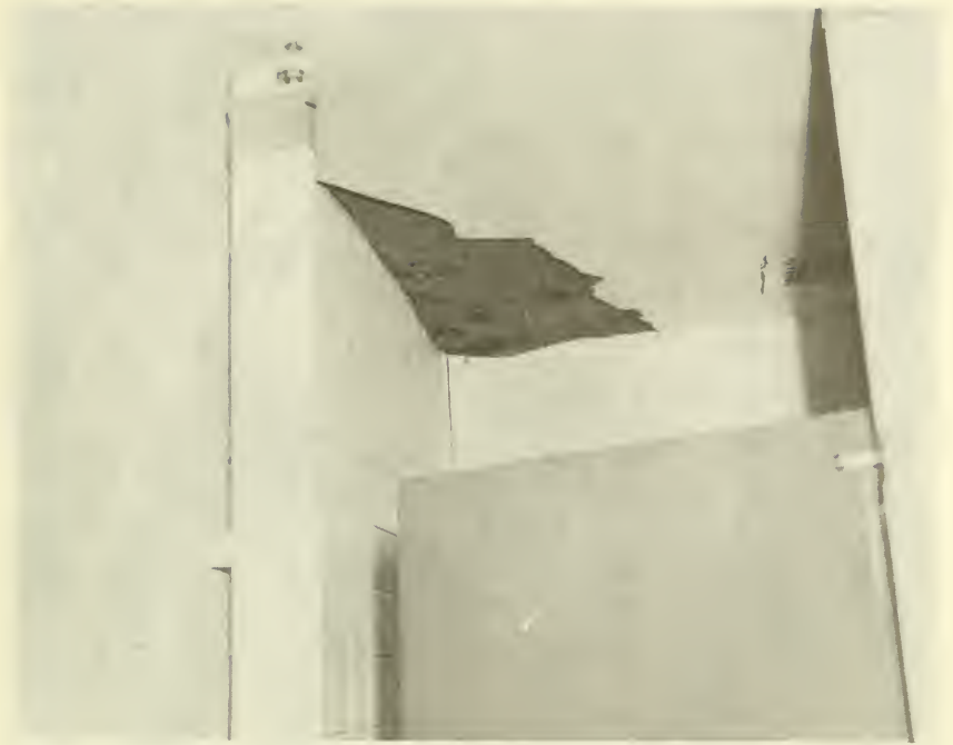
Second-floor Ladies' restroom damage.