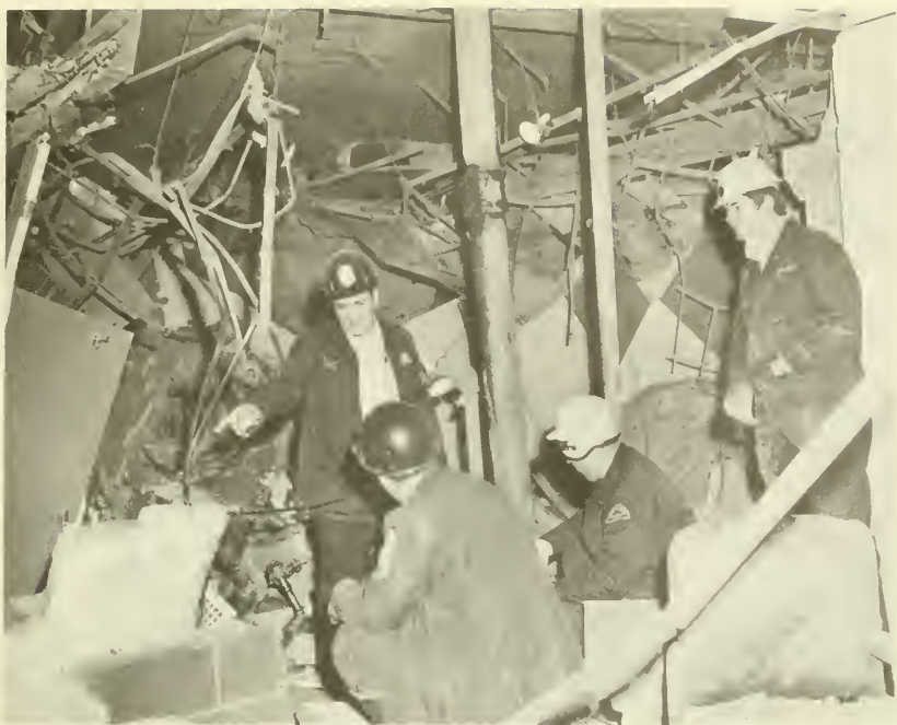
Third-floor men's room damage.