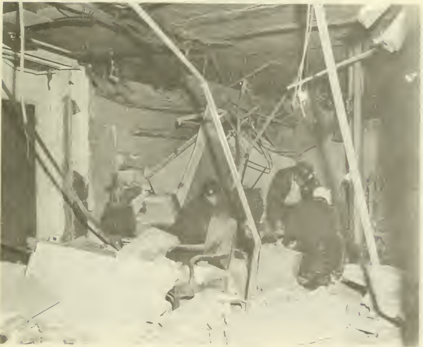
Third floor men's room damage.