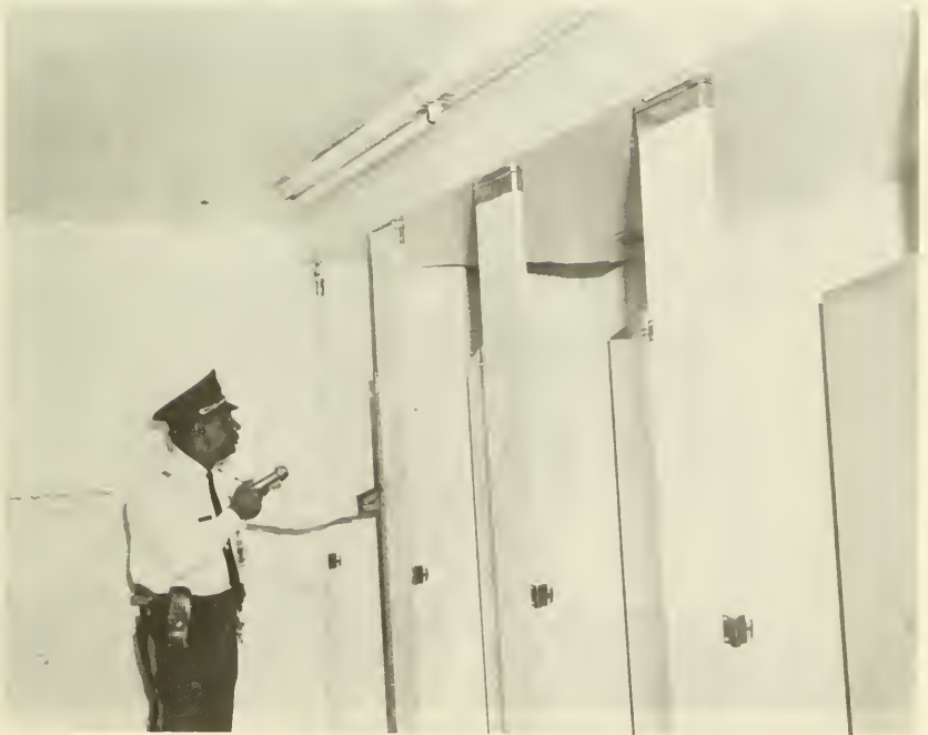
Second-floor Ladies' restroom damage.