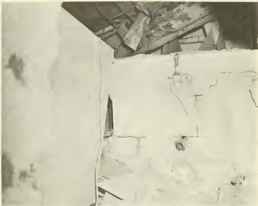
Third-floor men's room damage.