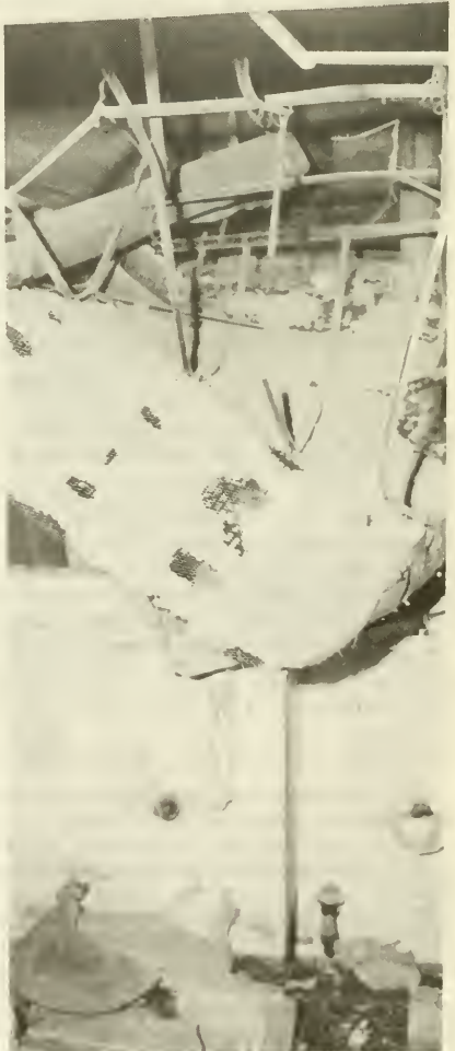
Third floor men's room damage.