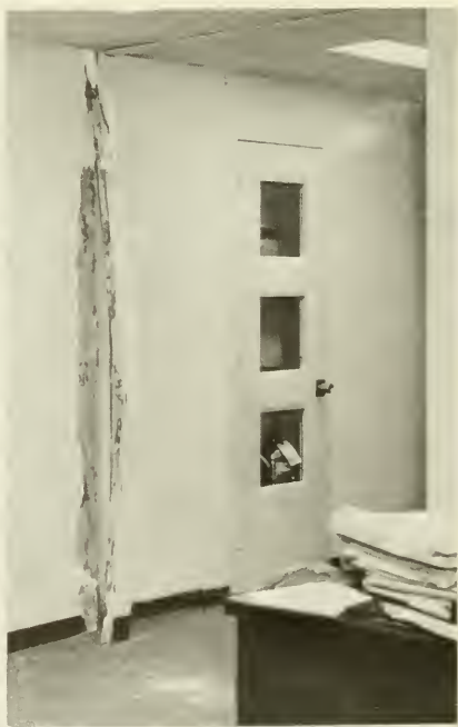
Fourth-floor office damage.