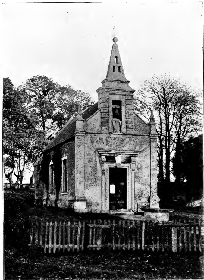
LITTLE GIDDING CHURCH.

Showing the graves of John and Nicholas Ferrar.