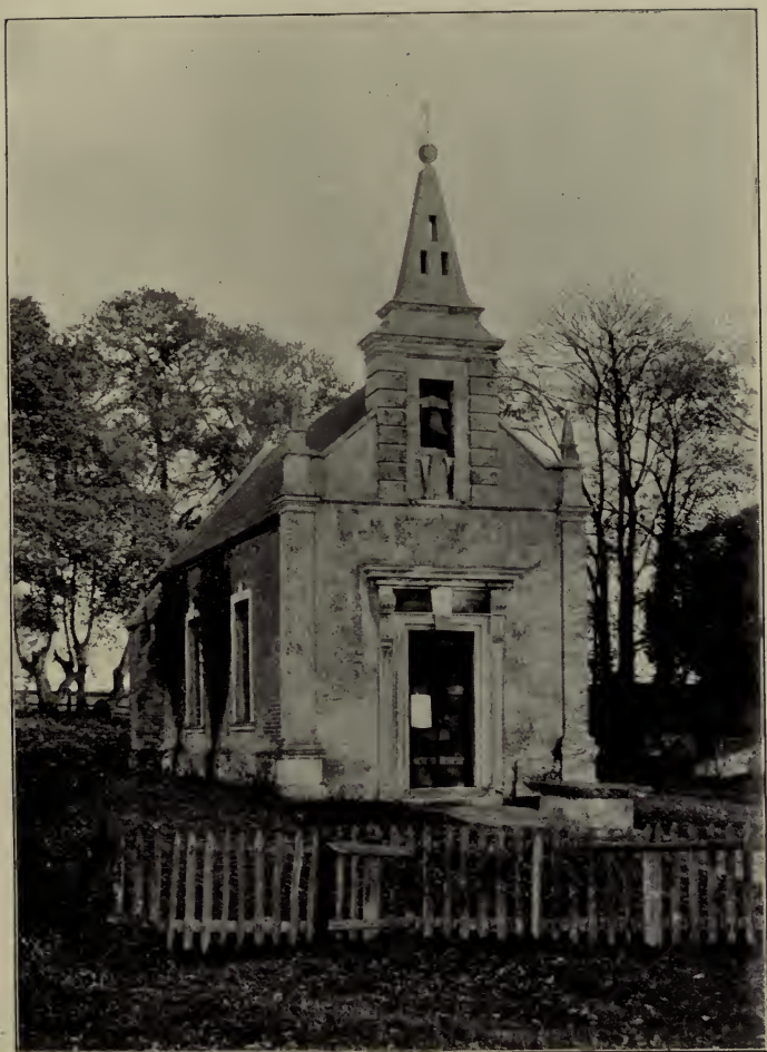
LITTLE GIDDING CHURCH.

Showing the graves of John and Nicholas Ferrar.