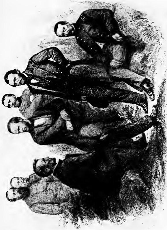
LEADERS OF THE CIVIL WAR Lincoln, Porter, Farragut, Sherman, Thomas, Grant and Sheridan