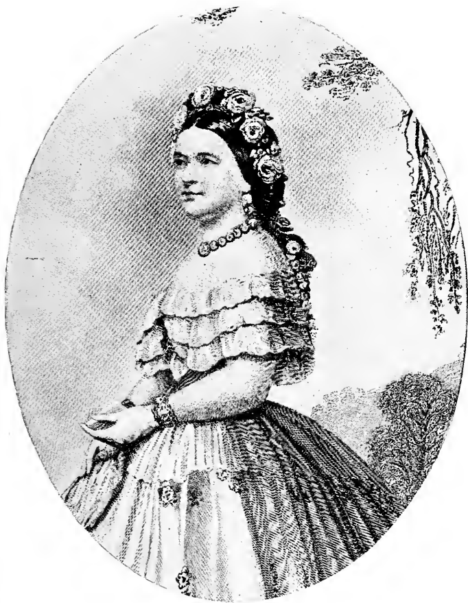
MRS. LINCOLN From a rare daguerreotype