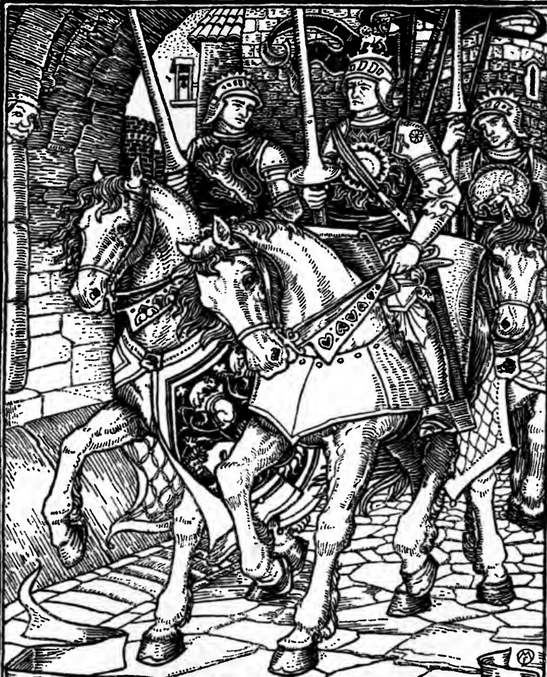
The Heralds of the Emperor Darius.