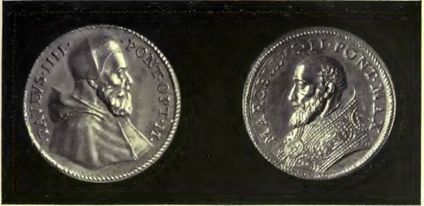
PAUL IV. ]