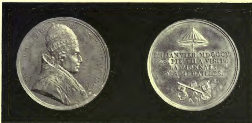
PIUS VII. GUEST OF THE EMPEROR NAPOLEON.

In January, 1805, His Holiness Pius VII. visited the French Mint.