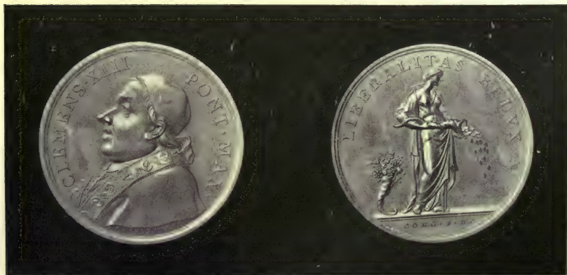
THE LIBERALITY OF CLEMENT XIII.