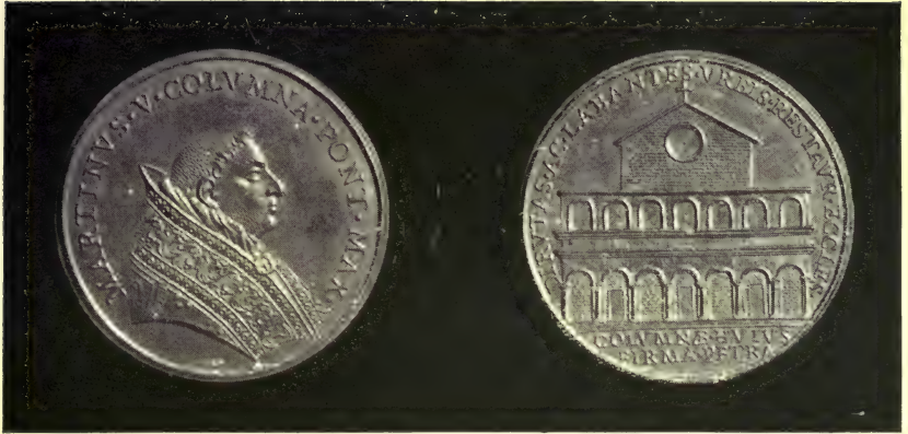
MARTIN V. (COLONNA).