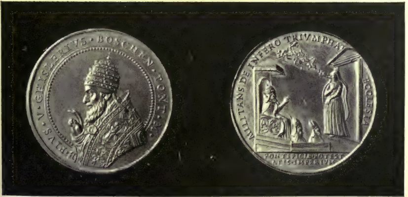
PIVS V. (GHISLERI).

The Church Militant triumphs over Hell (by casting out devils). In the exergue: The Empire of Pontifical Authority.