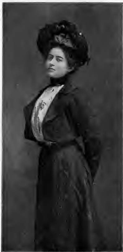
MARY MAC LANE