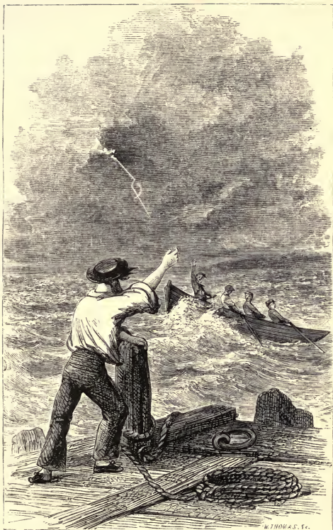
FIRST ADVENTURE ON THE SEA.