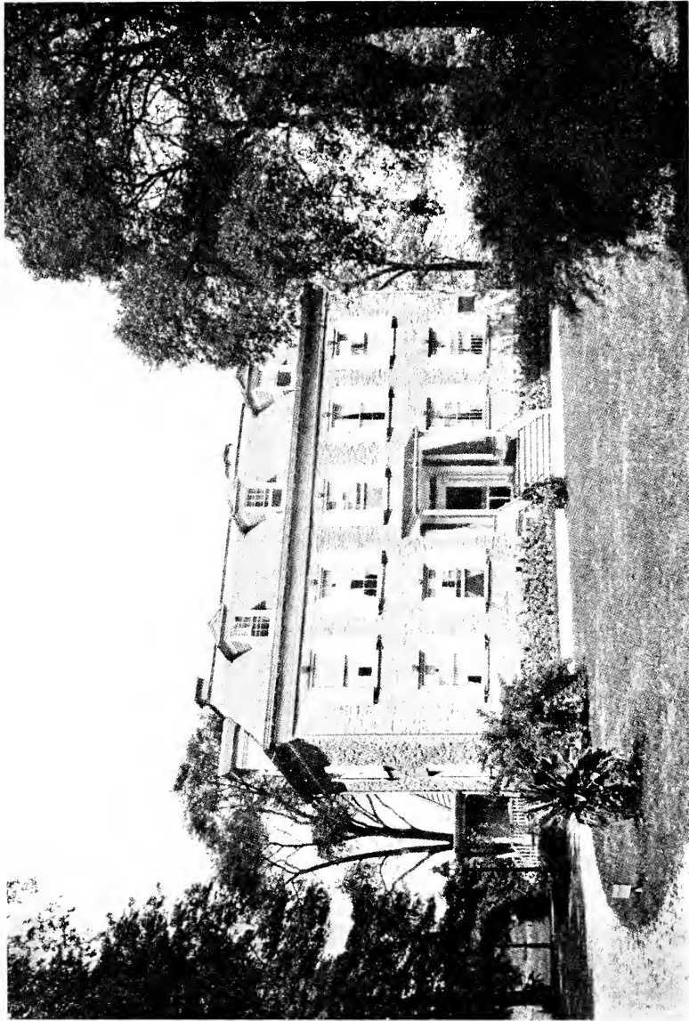
THE VAN CORTLANDT HOUSE MUSEUM