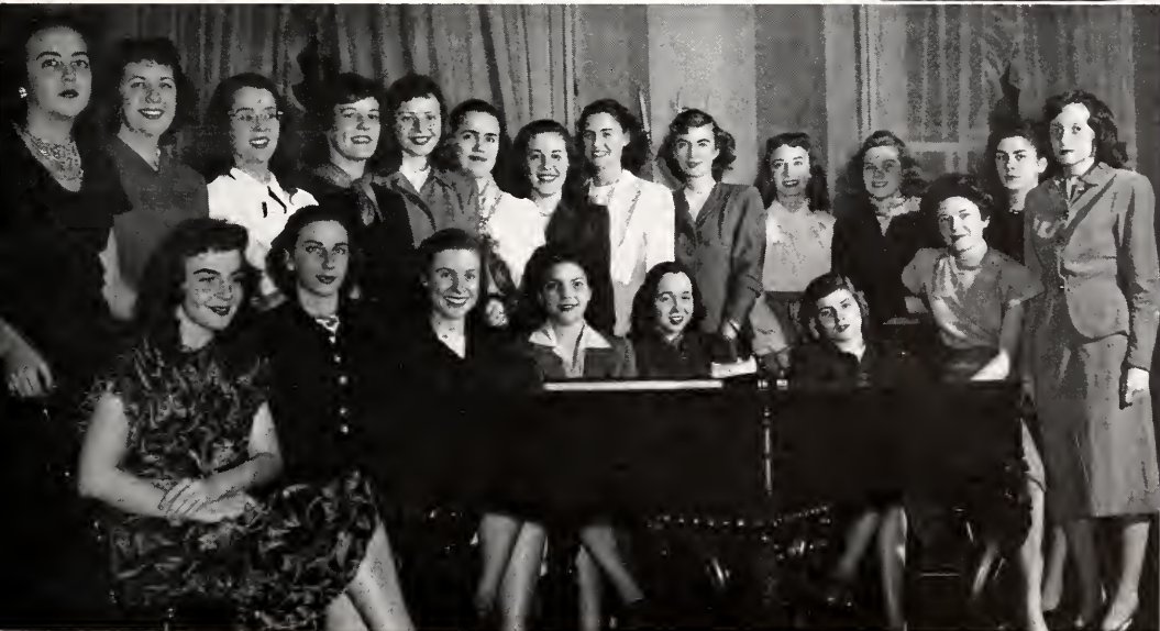
THE COLLEGE GOVERNING ORGANIZATION MEETS TO DISCUSS STUDENT AFFAIRS