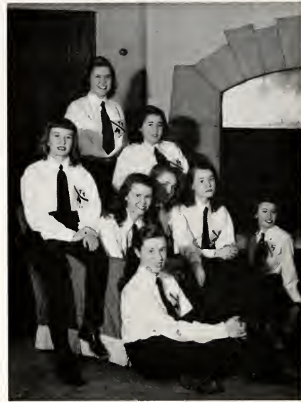
THE TURF AND TANBARK CLUB