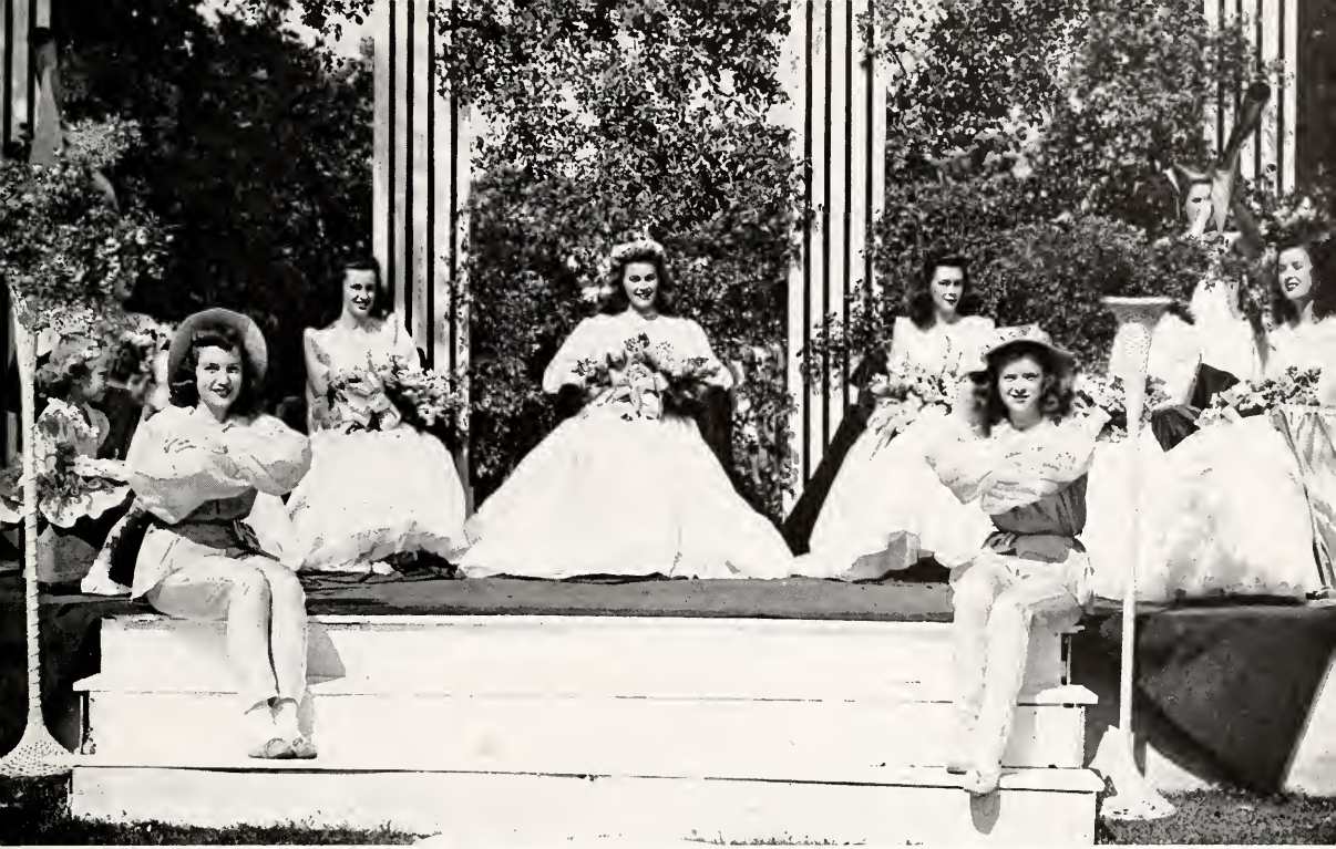
TO BE CHOSEN QUEEN OR A MEMBER OF THE COURT IS ONE OF THE HIGHEST HONORS