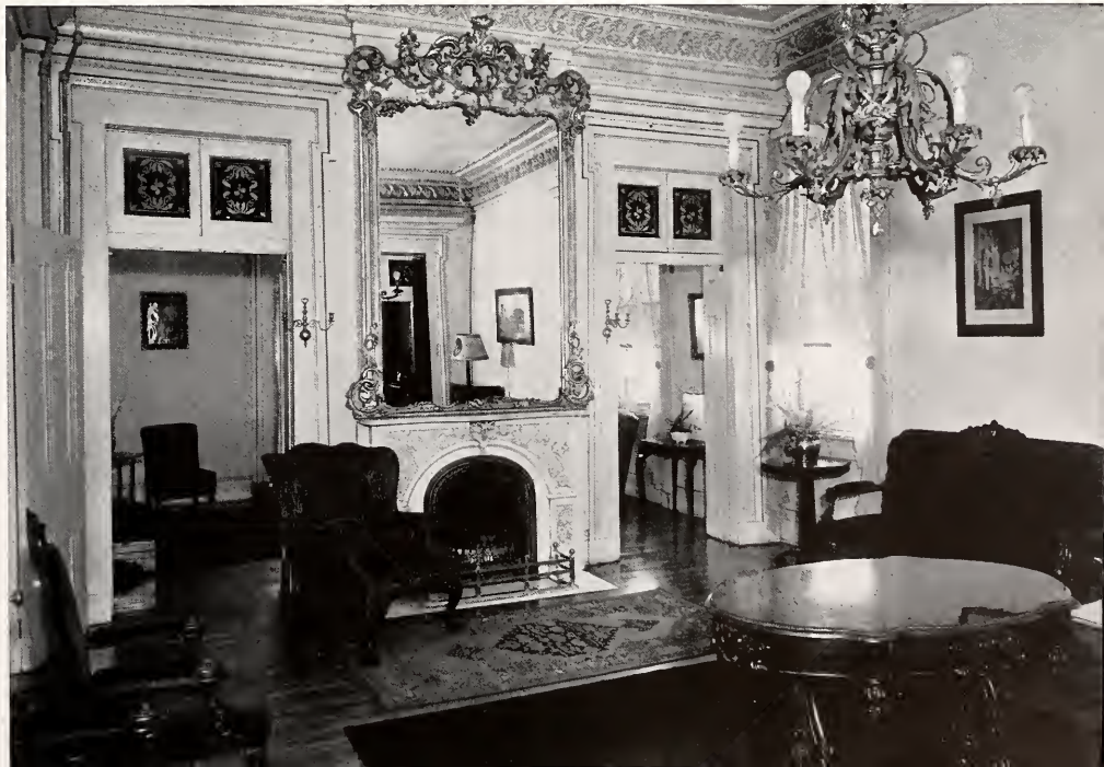
ONE OF THE SMALLER DRAWING ROOMS IN HISTORIC ACKLEN HALL