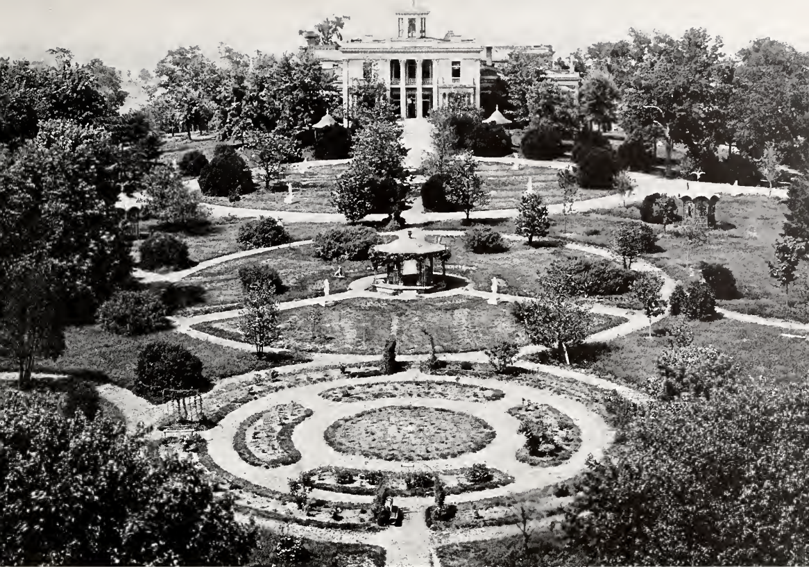
The main part of the Campus is centered about the famous old ante-bellum estate known as "Belmont." The picture above shows the mansion and its formal gardens as they appeared shortly after 1850. Preserved in all of its original beauty, the mansion now called Acklen Hall, overlooks the quadrangle.

club room with fireplace, a music room, a game room, balcony and kitchen, and is fully equipped for all the various student activities and club entertaining.