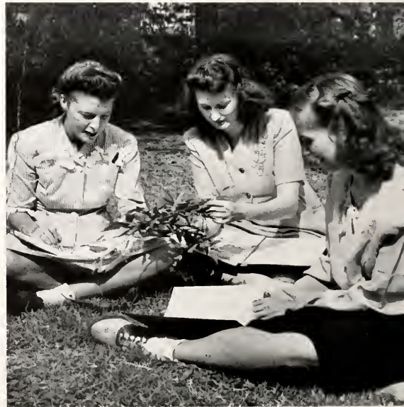
MEMBERS OF THE BIOLOGY CLUB AT WORK