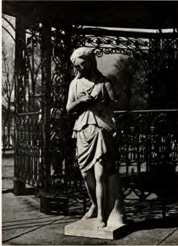
The marble statues and wrought iron summer houses, collected in Europe by Colonel and Mrs. Acklen for the formal gardens of their ante-bellum estate, are still on the campus.