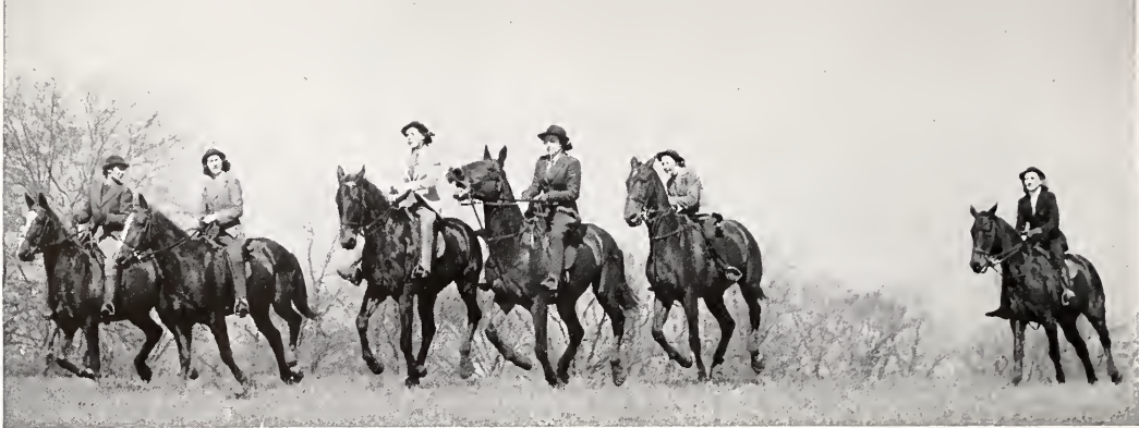
R I D E R S E N J O Y T H E H I L L S O F B E A U T I F U L T E N N E S S E E