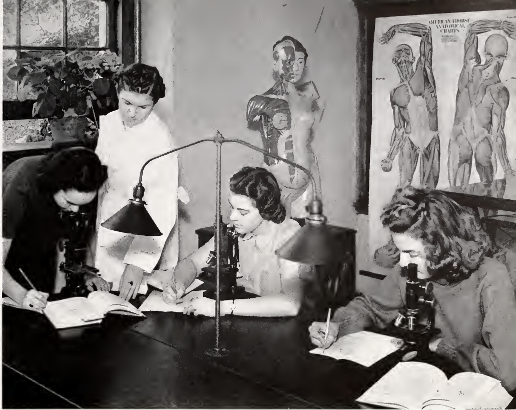
ADEQUATE LABORATORIES ARE MAINTAINED FOR THE SCIENCES