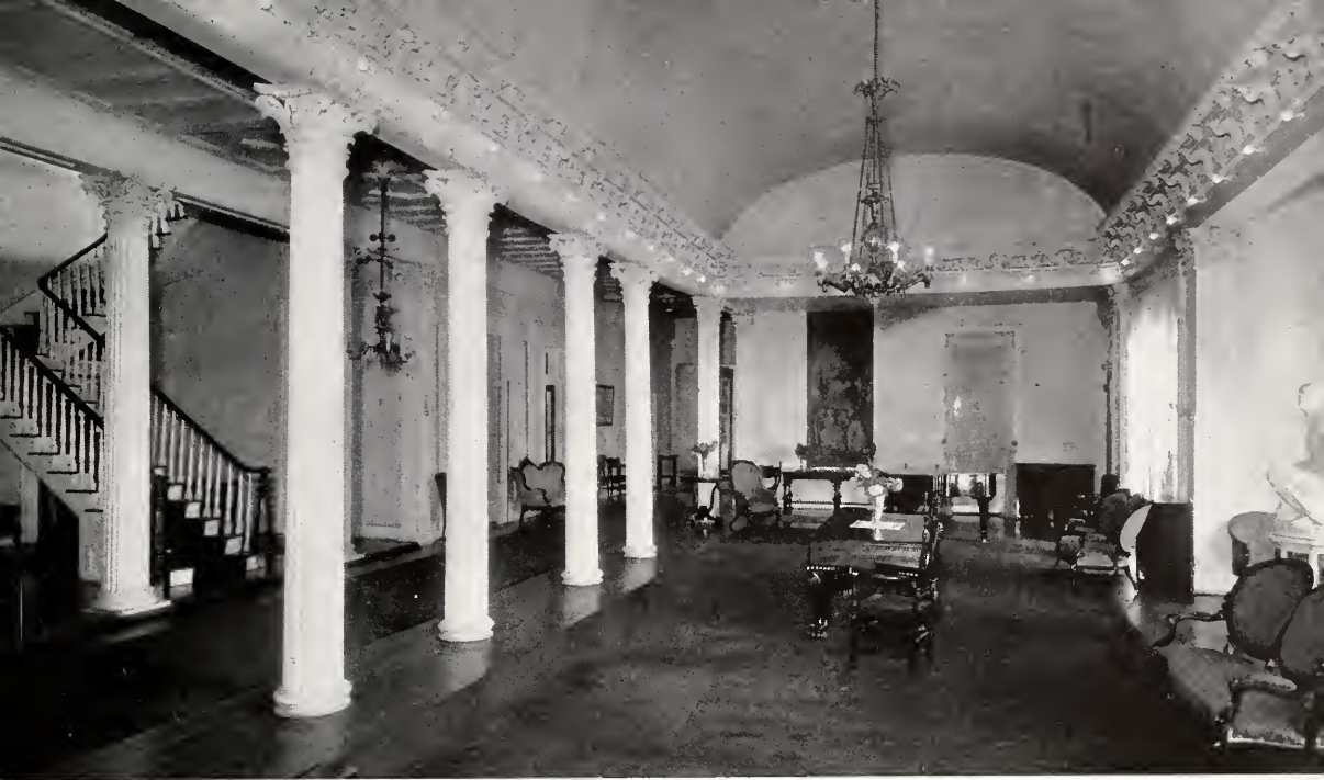
THE MAIN DRAWING ROOM IN ACKLEN HALL WHERE STUDENTS WELCOME THEIR GUESTS