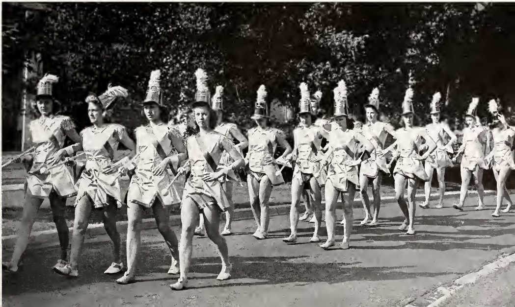
EVERY STUDENT TAKES PART IN THE TRADITIONAL MAY DAY CELEBRATION