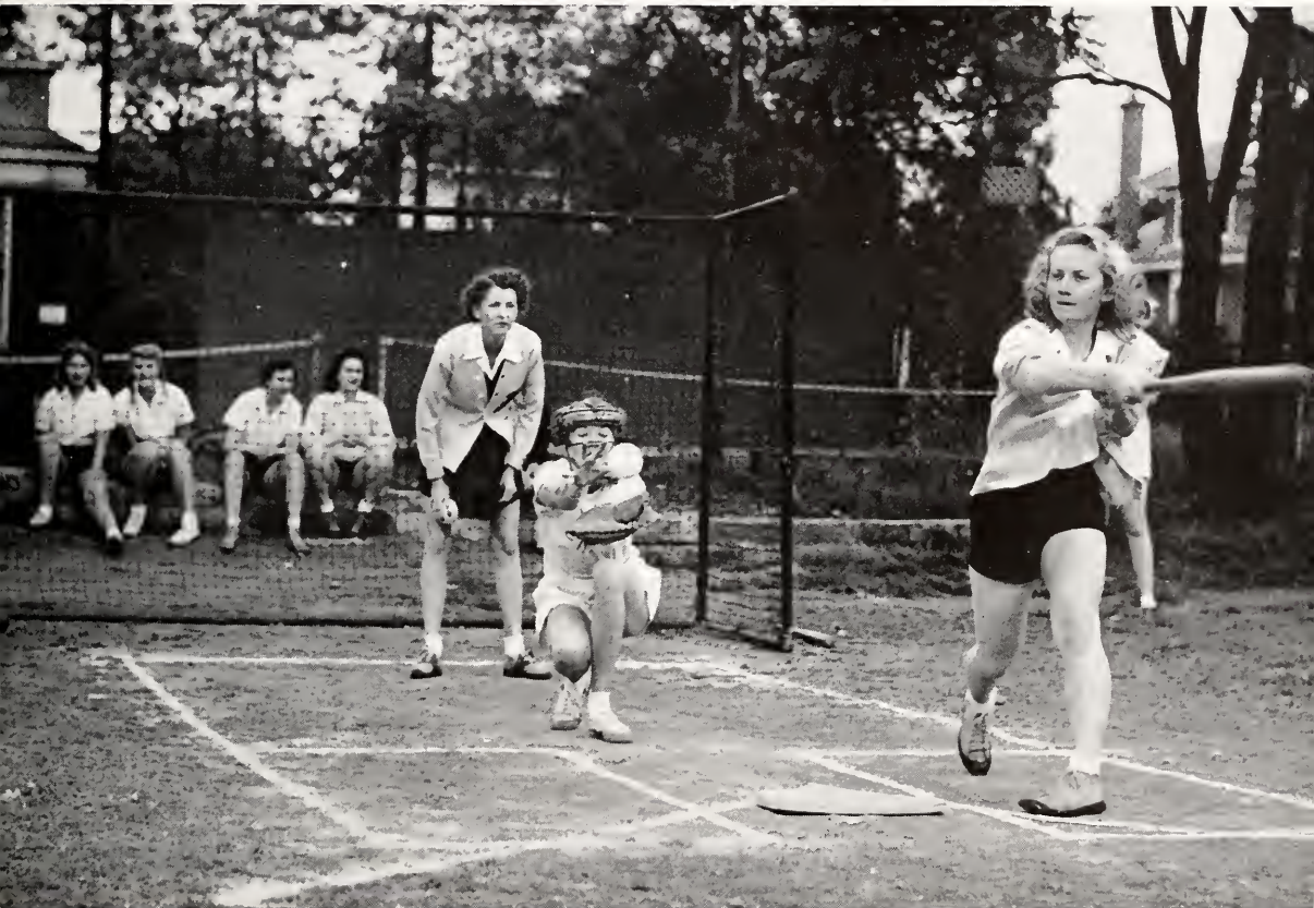
STUDENTS STRIVE TO WIN A COVETED LETTER IN THEIR FAVORITE SPORTS

The climate of Middle Tennessee encourages year-round sports. In addition to the regular physical education program, there is a club team in every sport. Competition among these teams is always keen and is matched only by the enthusiasm of the spectators.