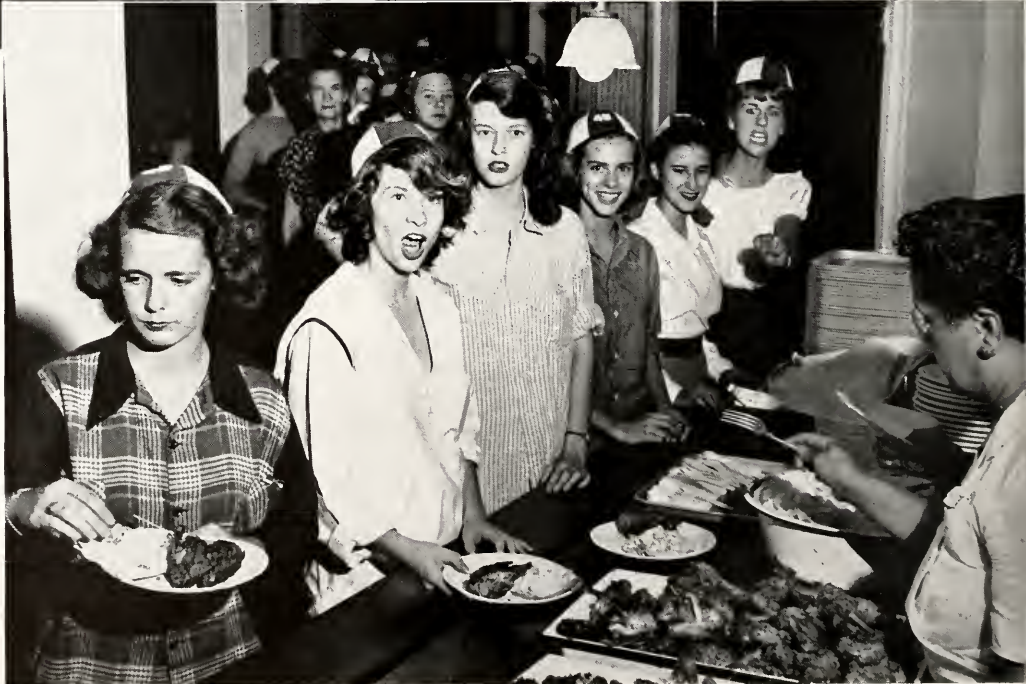
THE STUDENT COUNCIL ENTERTAINS AT AN INDOOR PICNIC