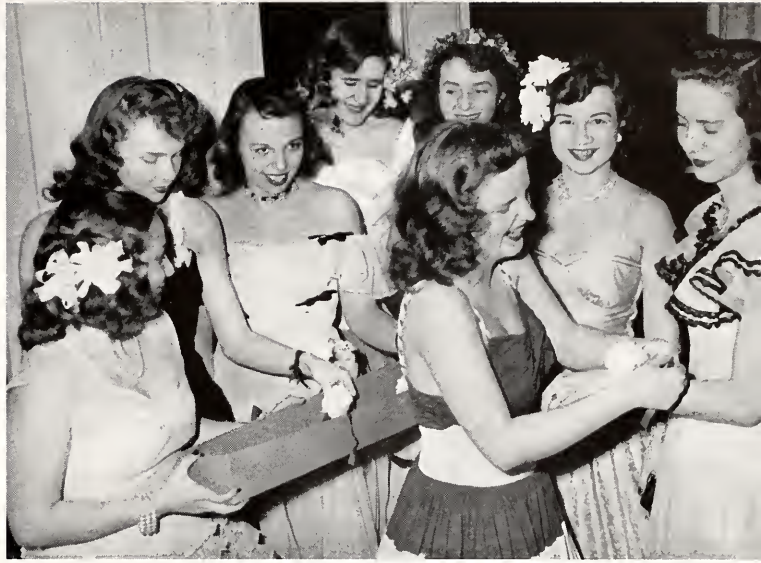
CORSAGES JUST BEFORE THE FORMAL DANCE