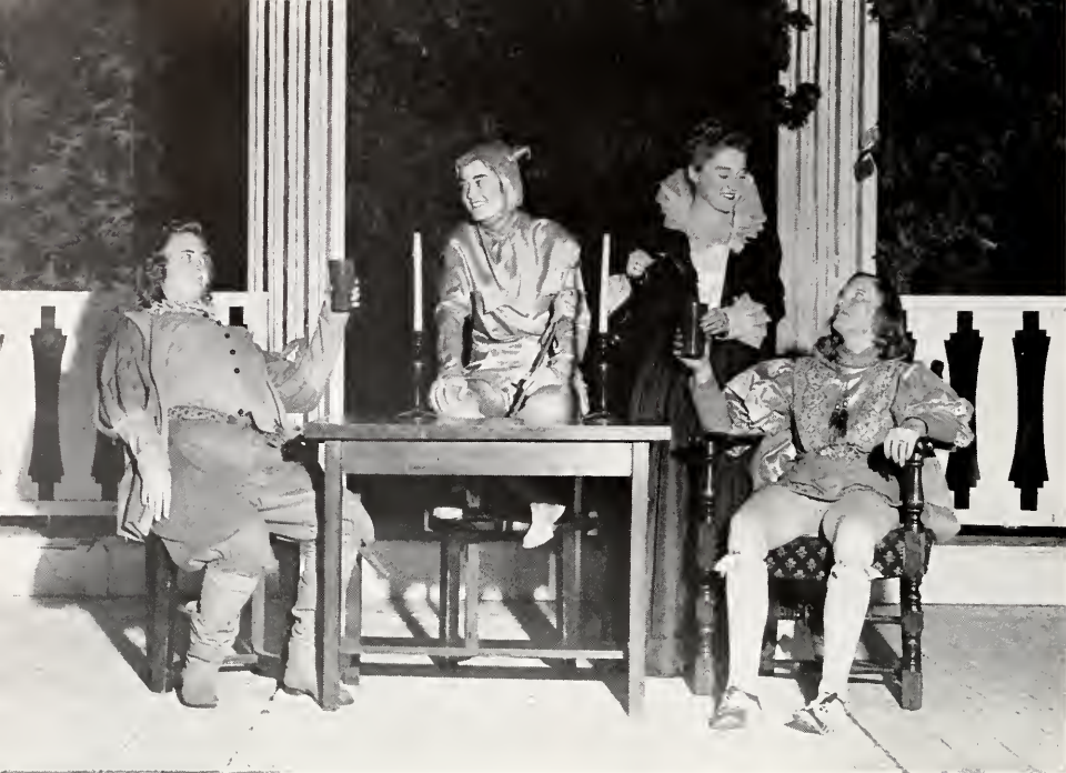
PLAYS, PAGEANTS AND OPERETTAS ARE FREQUENTLY PRESENTED