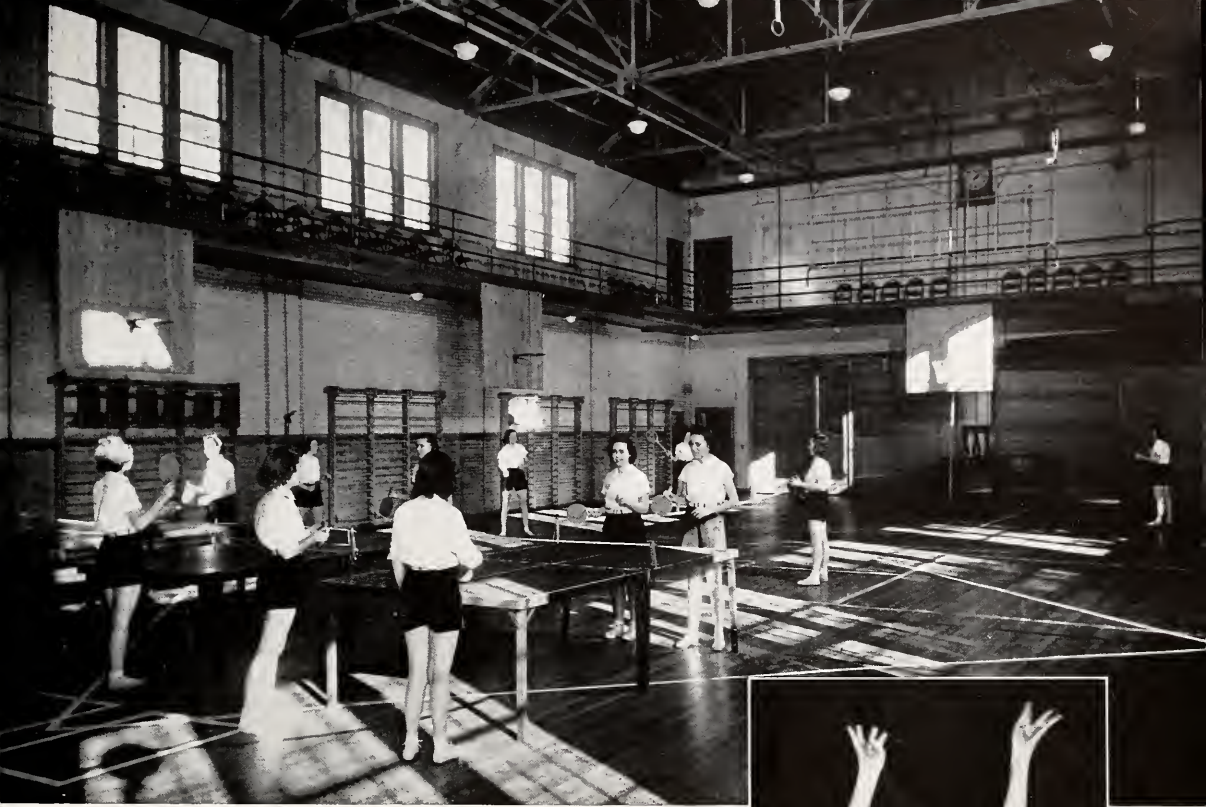
THE GYMNASIUM PROVIDES ABUNDANT SPACE AND EQUIPMENT FOR ALL INDOOR GAMES