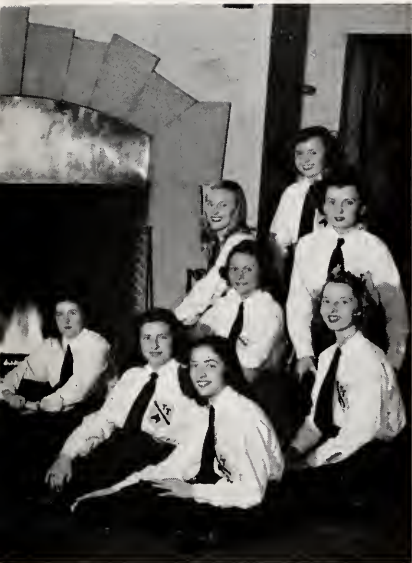
HOLD A SPECIAL MEETING