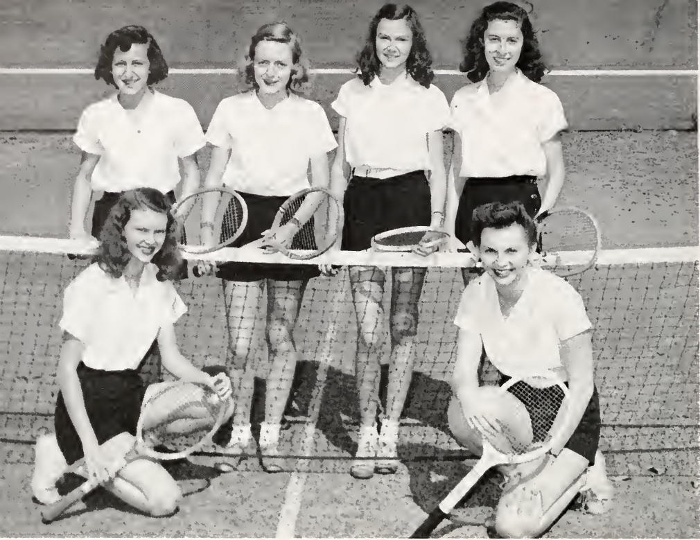
EVERY ONE ENJOYS THE SPRING AND FALL TENNIS TOURNAMENTS