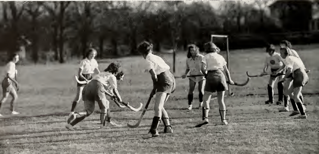
FIELD HOCKEY IS ONE OF THE MOST POPULAR OUTDOOR SPORTS IN THE FALL