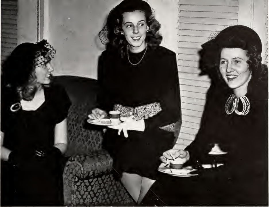
THREE OF THE YOUNGER FACULTY MEMBERS RELAX AT TEA

STUDENTS FROM NEIGHBORING SCHOOLS AND UNIVERSITIES ARE FREQUENT GUESTS