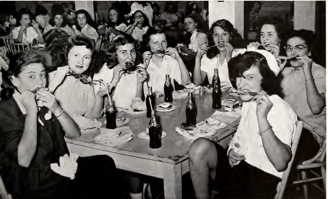
THE PAUSE THAT REFRESHES WITH CHICKEN AND CHATTER IN THE TEA ROOM