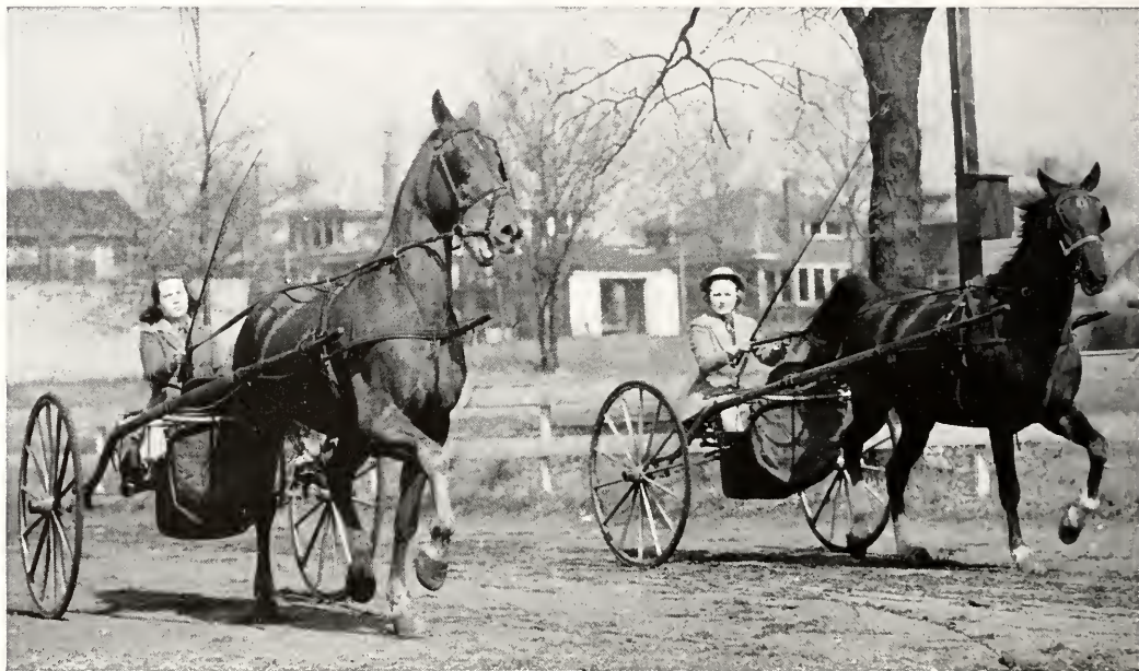
S T U D E N T S L E A R N T O R I D E , D R I V E A N D S H O W H O R S E S