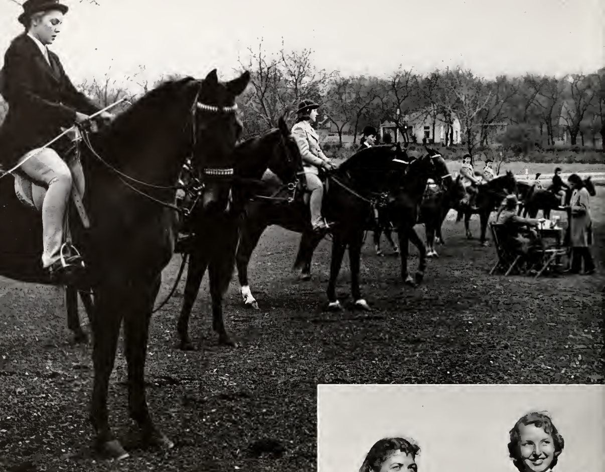
The school owns and operates its own stable of gaited horses. There are regular shows in the fall and spring. In addition to riding simply for pleasure, some students elect to take the full two year course in the theory and technique of riding in order to qualify themselves as instructors in summer camps.