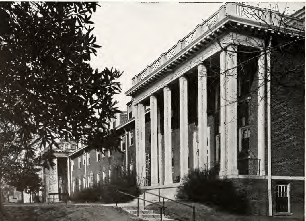
PEMBROKE HALL—THE HOME OF THE SENIORS