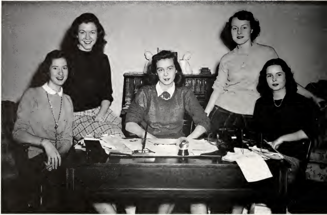
THE GOVERNING COUNCIL OF THE PREPARATORY SCHOOL IN SESSION.