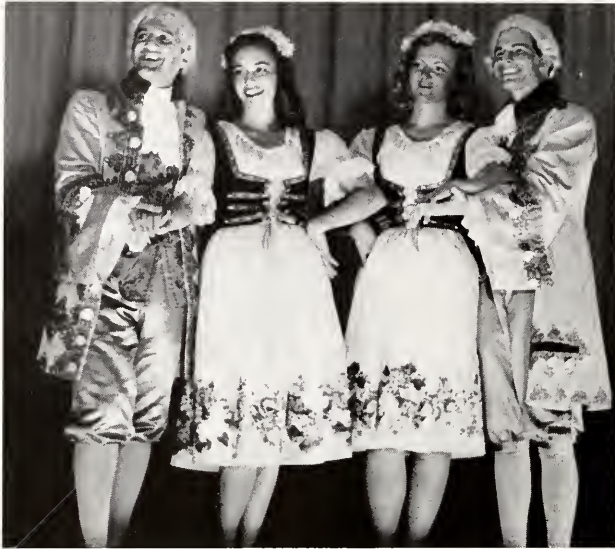
WITH THE COOPERATION OF NEARBY SCHOOLS, OPERETTAS ARE GIVEN. AMONG THE FAVOR- ITES ARE THOSE OF GILBERT AND SULLIVAN.