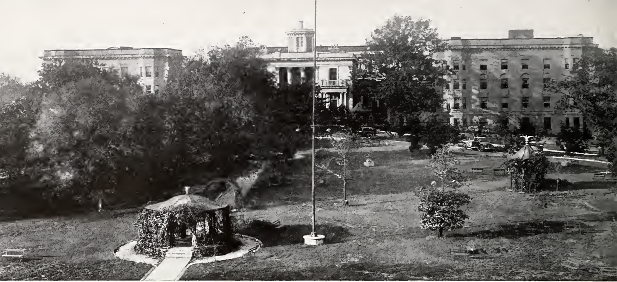
HISTORIC SOUTH FRONT OVERLOOKS THE SPACIOUS QUADRANGLE