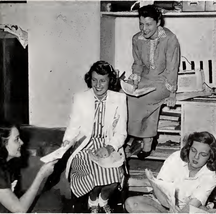
MANY STUDENTS ENJOY WORKING ON PUBLICATIONS