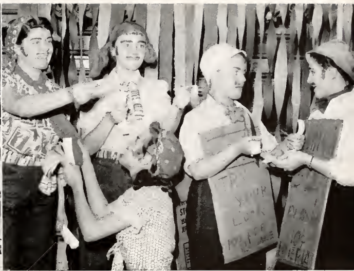
“FAG DAY” FUN CELEBRATES PLEDGING IN CLUB VILLAGE