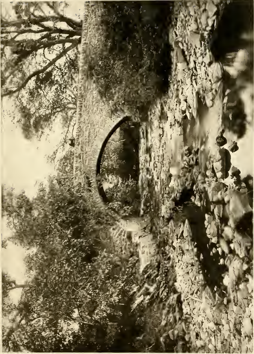
BRIDGE OVER KELTY, CHAPELBAROCH