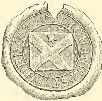
SEAL OF REV. JOHN STODDERT, MINISTER OF FINTRY, STRATHBLANE, AND CAMPSIE. 1608.