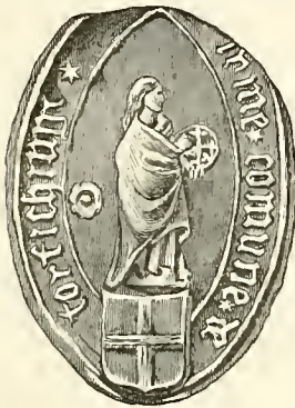
SEAL OF THE CHAPTER OF TORFICHICHEN. (1461.)