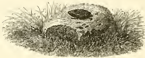
GALLOWS STONE AT CATTER HOUSE, DRYMEN.

The road to Dumbarton crosses the Endrick by Drymen Bridge about three-quarters of a mile south of the village of Drymen, and passes into the parish of Kilmarnock in Dumbartonshire.