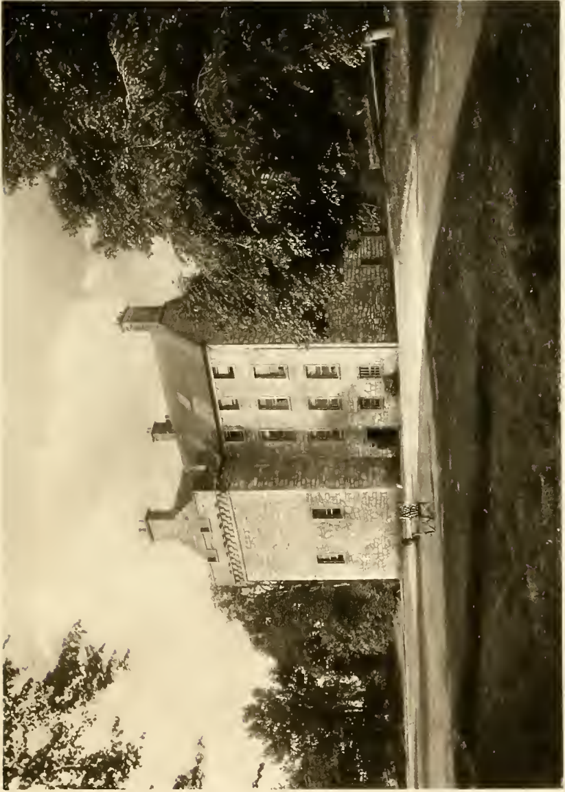
C H U R C H