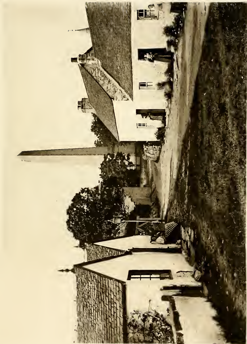
THE BUCHANAN MONUMENT, KILLLEARN