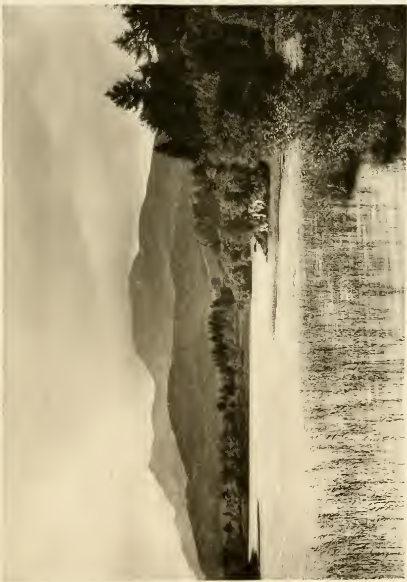
BEN LOMOND FROM DUBH LOCHAN.