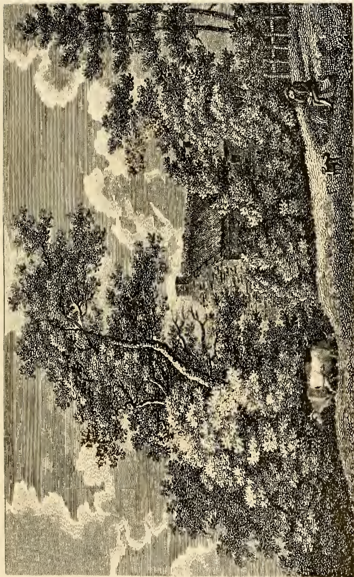
HOUSE OF MOSS IN WHICH BUCHANNAN WAS BORN.