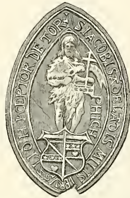
SEAL OF JAMES SANDELANDIS, LORD OF ST. JOHN, PRECEPTOR OF TORFICHICHEN. (1555.)

Thomas Buchanan, first of Carbeth, had two sons—Thomas, second of Carbeth, and John, in Ballat and of Camoquhill and the Temple lands. That this was the case seems proved by the next deed, now to be found in the Duntreath charter chest. This is a charter by Sir William Knollis, the famous preceptor of the Hospital, and who fell at Flodden, on the resignation of John Buchanan of Camoquhill, to Thomas Buchanan of "Garbeth" of the Temple lands of Letter. In the same charter was included the Temple lands of Boquhanbeg. Thomas of Carbeth was John of Camoquhill's brother. The witnesses to the resignation were the following "noble men": Gavin Livingstone of that Ilk, George Muirhead, Robert Buchanan, John Crawford, Thomas Kincaid, and Thomas Ewynsone. Infestment followed on 17th February 1493-4; the instruments by Walter Nore, the Notary Public, narrating how a decent ( honestus ) man, Robert Buchanan, deputy of a noble ( nobilis ) man, Walter Buchanan, bailie of a noble Lord, William Knollis, Knight-Lord of