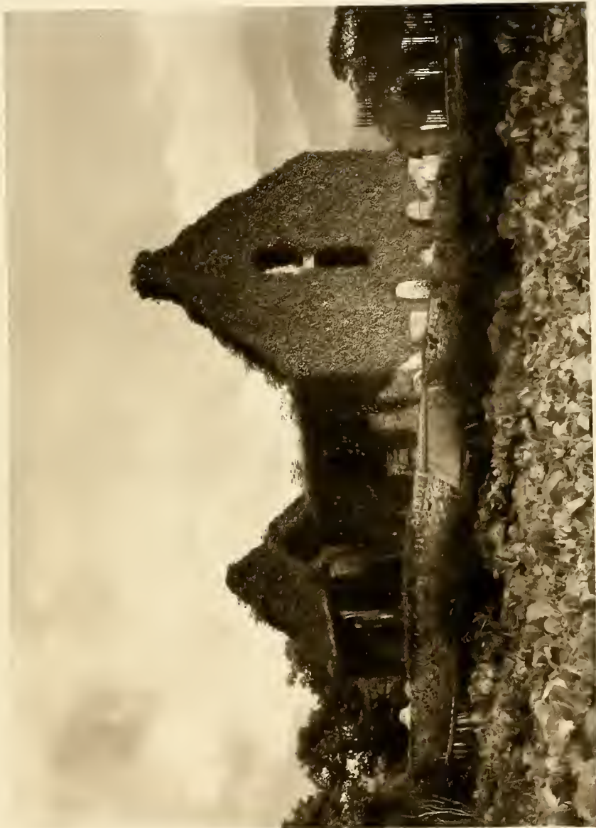
OLD CHURCH, KILLEARN.