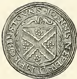
SEAL OF JOHN NAPIER OF MERCHISTON.