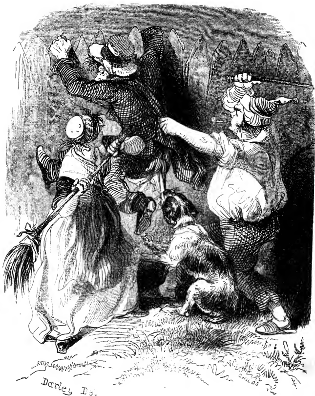
"They found their trusty sentry baulking all Seth's efforts to retreat over the fence, and keeping him 'a waitin.'"