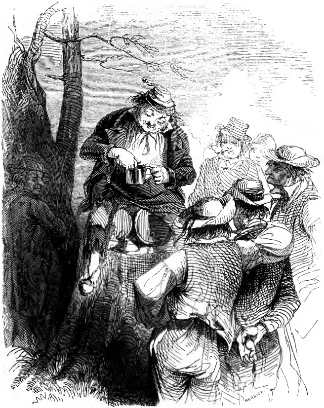
—— “and with his forefinger stirred up the sweetening.”