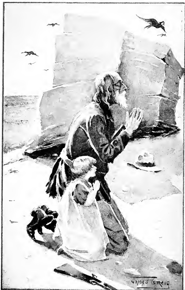
"United in the entreaty for mercy."