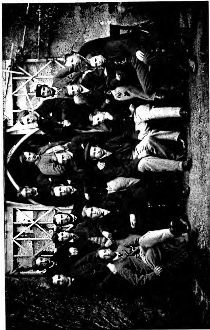
THE COLLEGE HALL GROUP, 1862-63