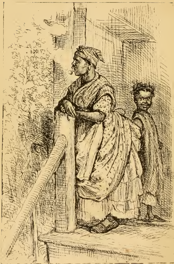
“She lighted a potent pipe.” See page 22.