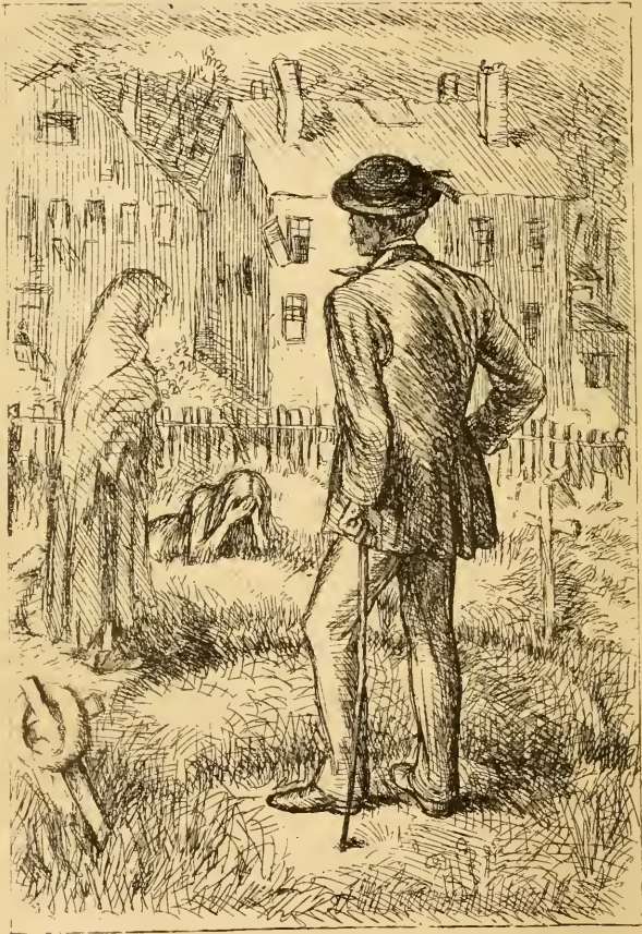
“Looking about, I saw two women.” See page 65.