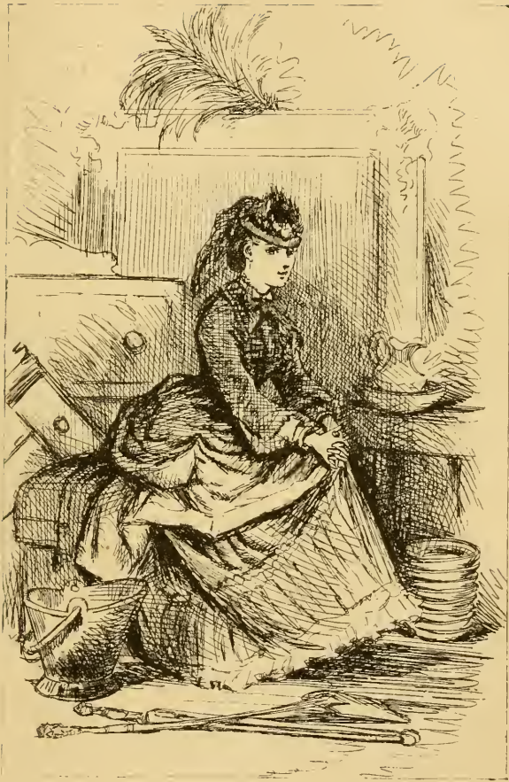
“Vacant and ceremonious zeal.” See page 252.