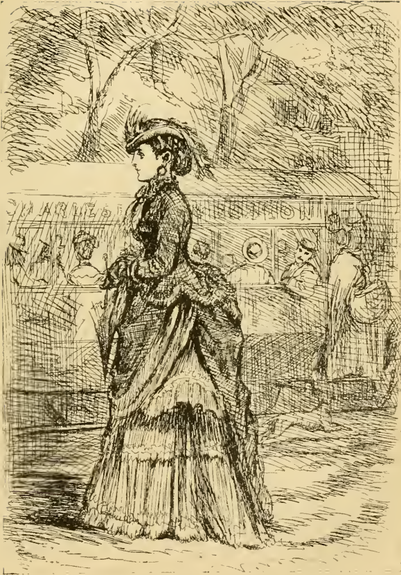
“The young lady in black, who alighted at a most ordinary little street.” See page 92.