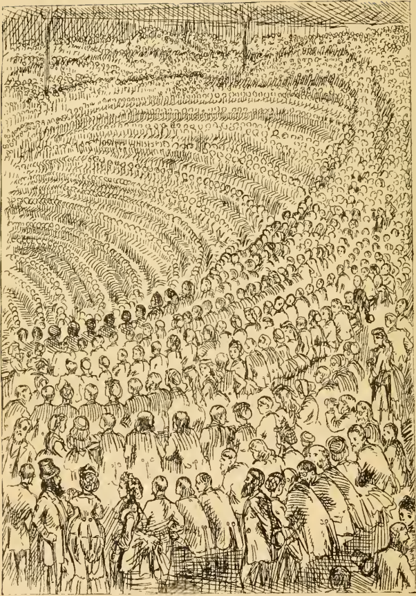
“The spectacle as we beheld it.” See page 199.