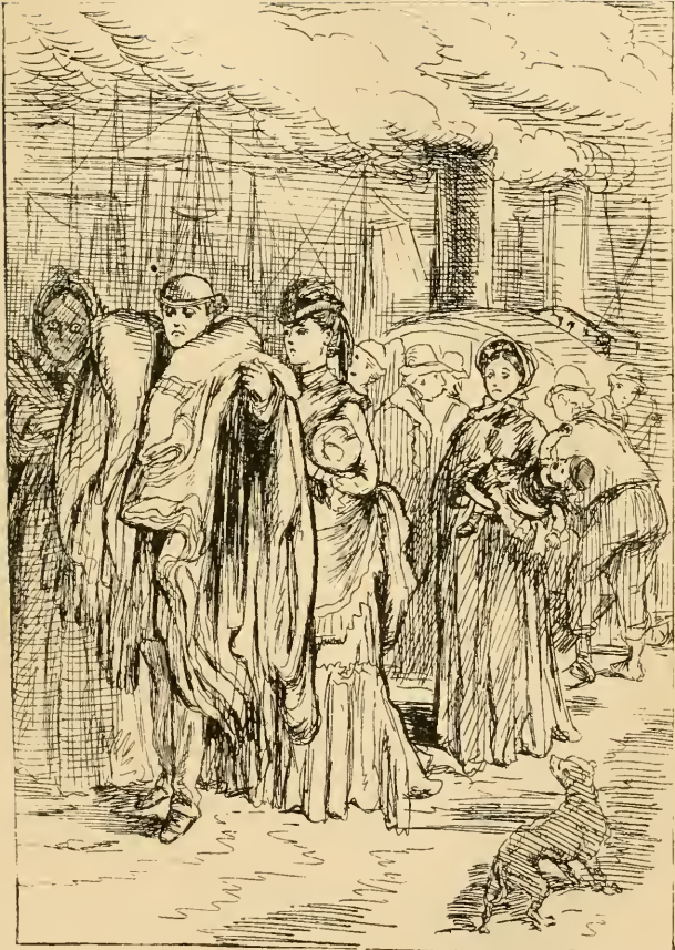
“Frank and Lucy stalked ahead, with shawls dragging from their arms.” See page 154.