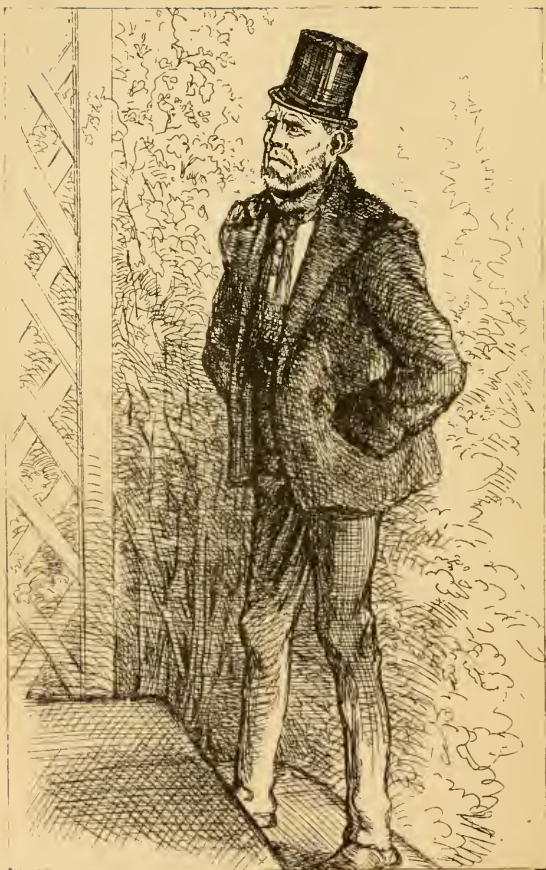
“A gaunt figure of forlorn and curious smartness.” See page 171.