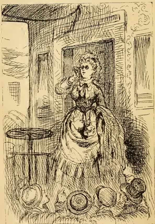
“That sweet young blonde, who arrives by most trains.” See page 119.