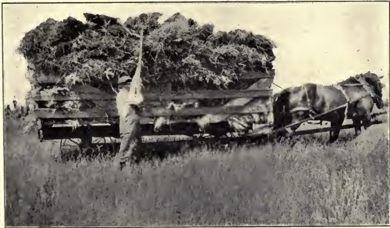
FIG. 2.—THE USE OF BASKET RACKS SAVES APPROXIMATELY ONE-FOURTH OF THE MAN LABOR NECESSARY TO GET THE BUNDLES OF GRAIN TO THE THRESHING MACHINE

farms keeping field records. 1 Farmers using basket racks are strong advocates of them. The racks not only save man labor by eliminating a great deal of unnecessary work in loading, but also help to distribute among a larger number of men the heaviest part of the work, which is pitching the bundles on the wagons. When this work is all done by five or six field pitchers, who have no change of work, a lot of muscular energy per man is required, but if it is distributed among eleven bundle