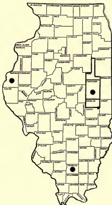
FIG. 1.—LOCATION OF AREA STUDIES

The experiences of the 142 farmers in the 74 rings included in this survey should be of value as a guide in deciding the best size of threshing machine to buy for a ring of a given size.