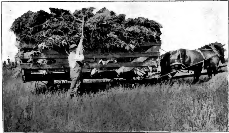
FIG. 2.—THE USE OF BASKET RACKS SAVES APPROXIMATELY ONE-FOURTH OF THE MAN LABOR NECESSARY TO GET THE BUNDLES OF GRAIN TO THE THRESHING MACHINE

farms keeping field records. 1 Farmers using basket racks are strong advocates of them. The racks not only save man labor by eliminating a great deal of unnecessary work in loading, but also help to distribute among a larger number of men the heaviest part of the work, which is pitching the bundles on the wagons. When this work is all done by five or six field pitchers, who have no change of work, a lot of muscular energy per man is required, but if it is distributed among eleven bundle