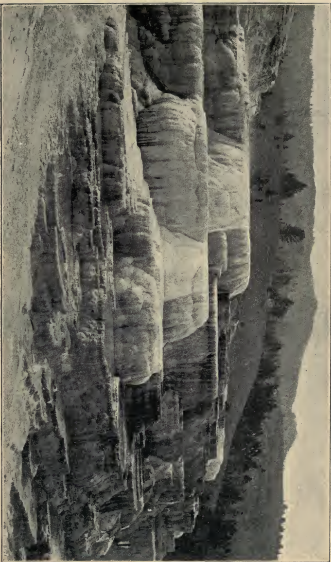
TERRACES AT MAMMOTH HOT SPRINGS. (SEE PAGE 46.)