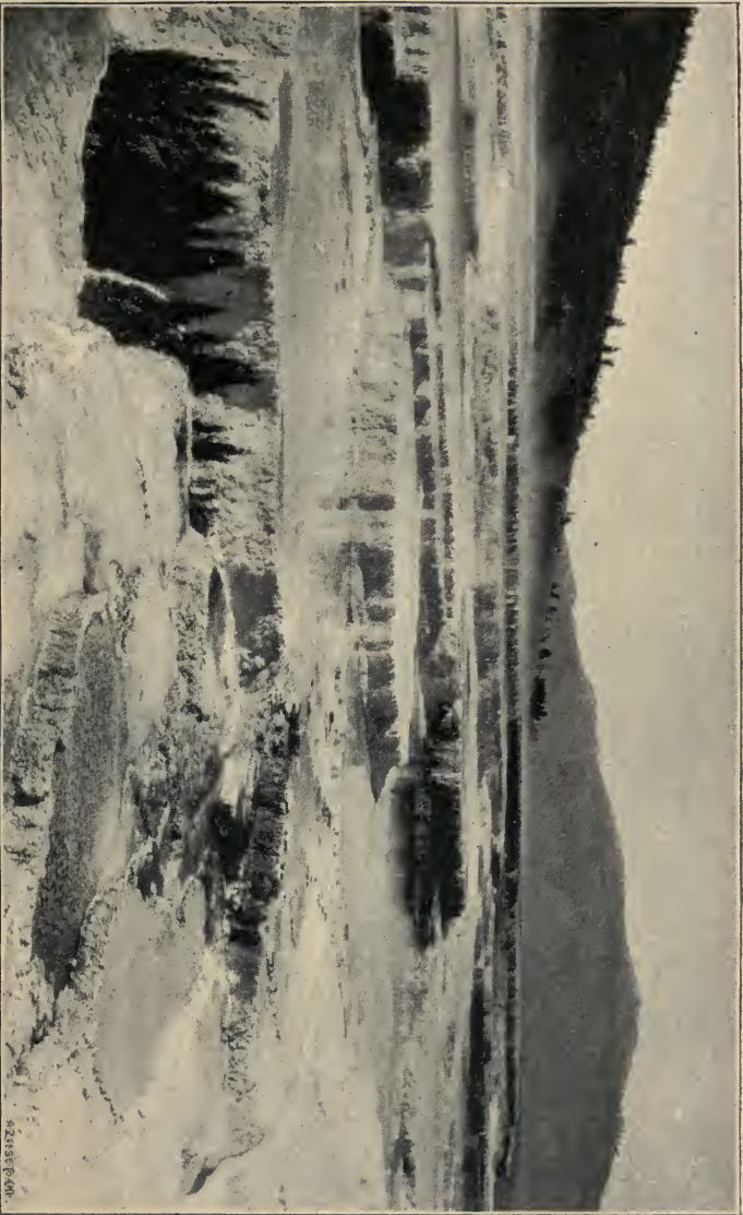
JUPITER TERRACE, MAMMOTH HOT SPRINGS. (SEE PAGE 48.)