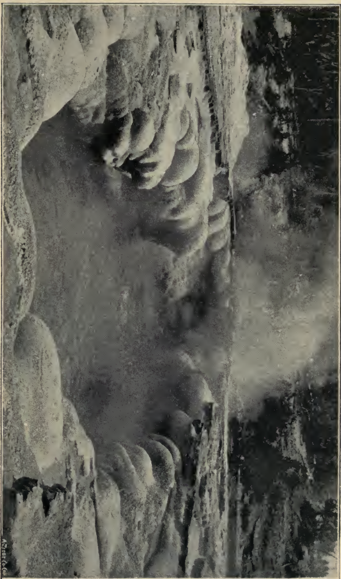
THE BISCUIT BOWL POOL, AT UPPER GEYSER BASIN. (SEE PAGE 35.)