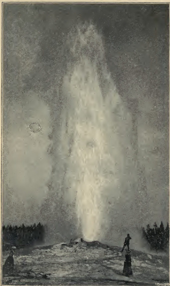
OLD FAITHFUL, AT UPPER GEYSER BASIN. (SEE PAGE 36.)