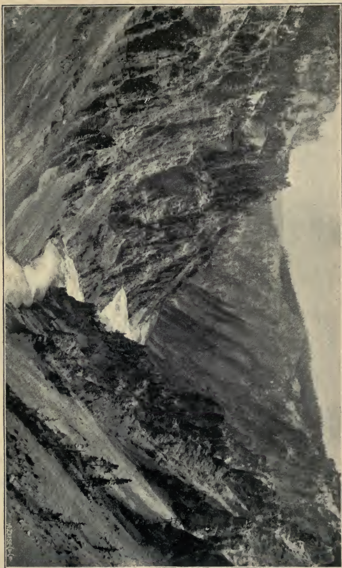
GRAND CANYON FROM THE BRINK. YELLOWSTONE CANYON. (SEE PAGE 77.)