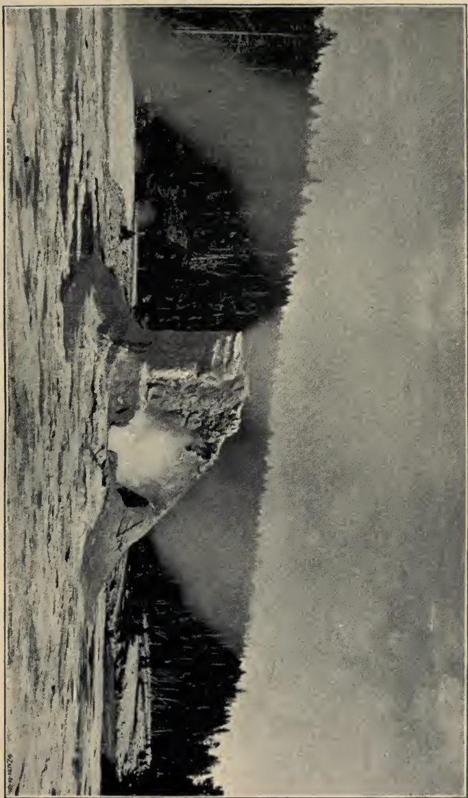
THE GIANT, AT UPPER GEYSER BASIN. (SEE PAGE 33.)