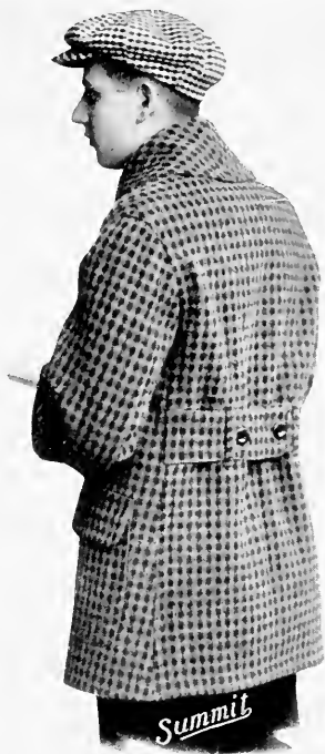
Model 42 De Luxe, Back