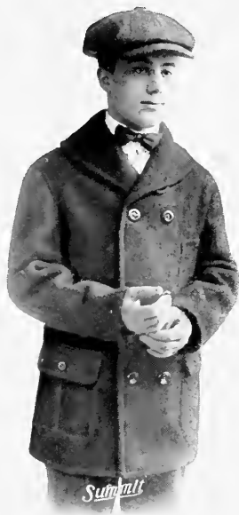
Model 44 De Luxe

A smart model that is different for the boys and young men. Shawl collar, two back inverted plaits to waist line, imitation half belt, two lower inverted plaited pockets with flaps and buttons, one upper plain pocket with button, inside change pocket, matched stripes, full man tailored, overcoat sizes for youths and boys.