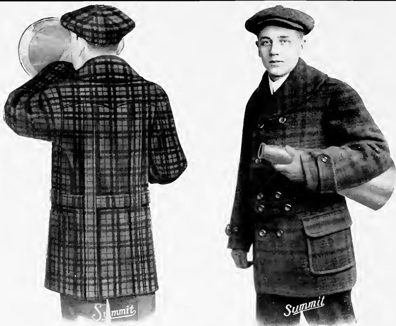
Model 17—Back View