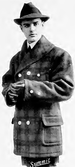
Model 42 De Luxe, Front