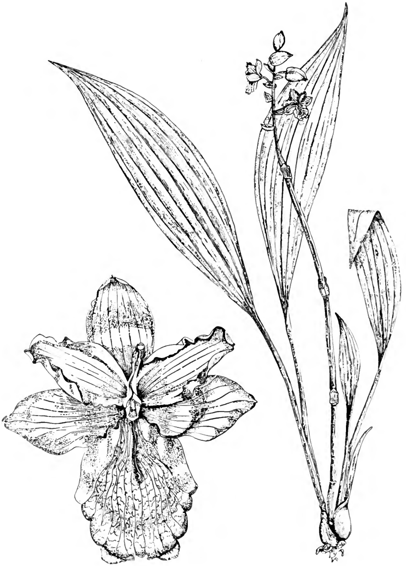
FIG. 53. Warrea costaricensis . Plant ( \times 1/6 ); flower, spread out ( \times 1 ). Drawn by Vivien Frazier.