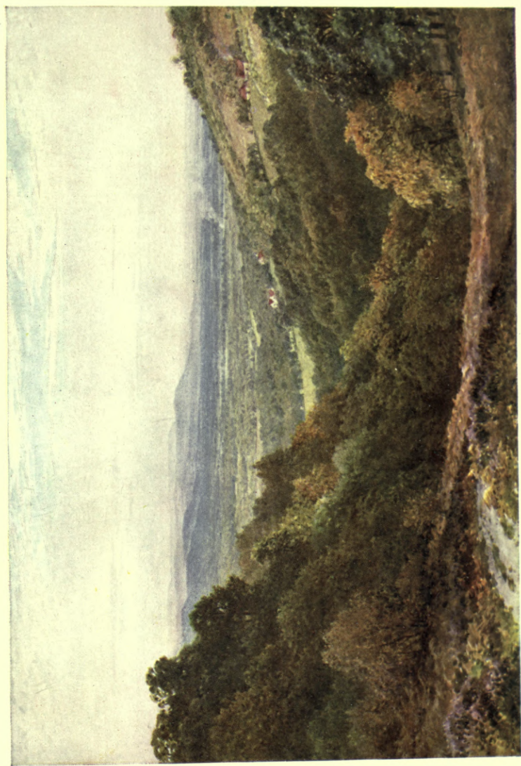
HINDHEAD. THE PUNCH-BOWL, LOOKING NORTH