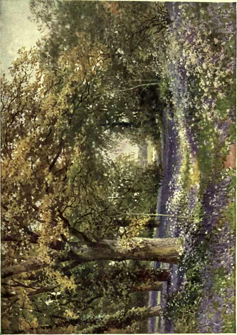
A GLIMPSE OF THE THAMES, KEW