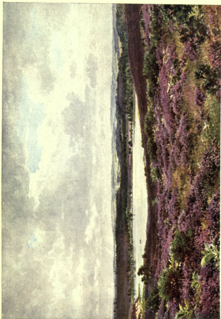
THE GREAT POND, FRENTHAM