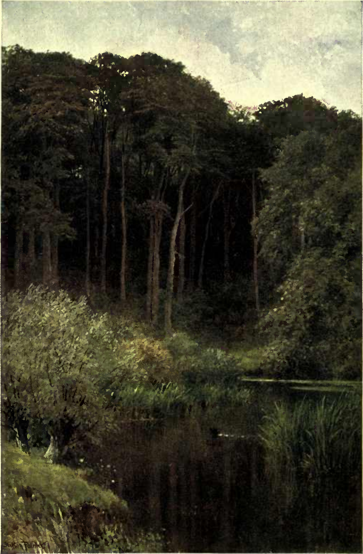
WOODLAND DEPTHS, WOTTON