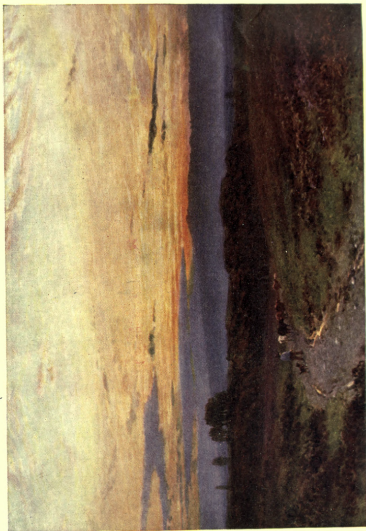
A SUMMER'S EVE, MILFORD COMMON