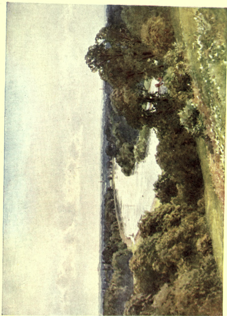
FROM RICHMOND HILL.