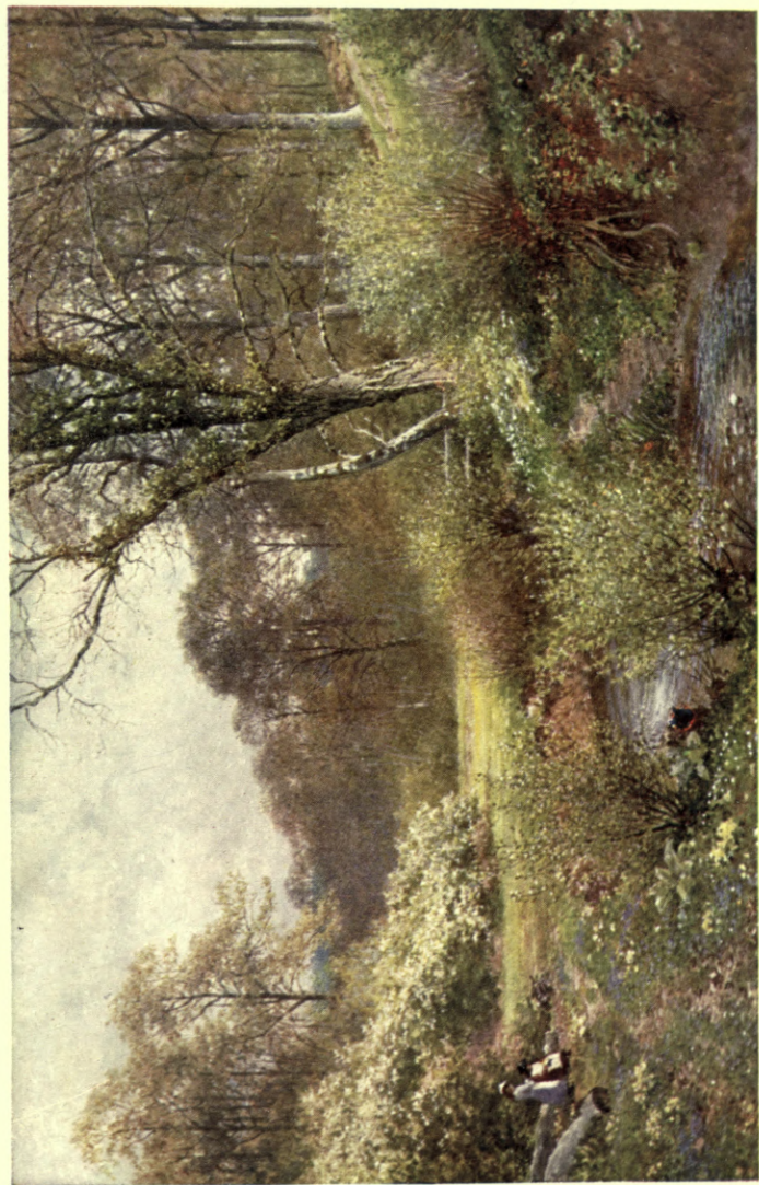
IN SPRING WOODS, OCKLEY