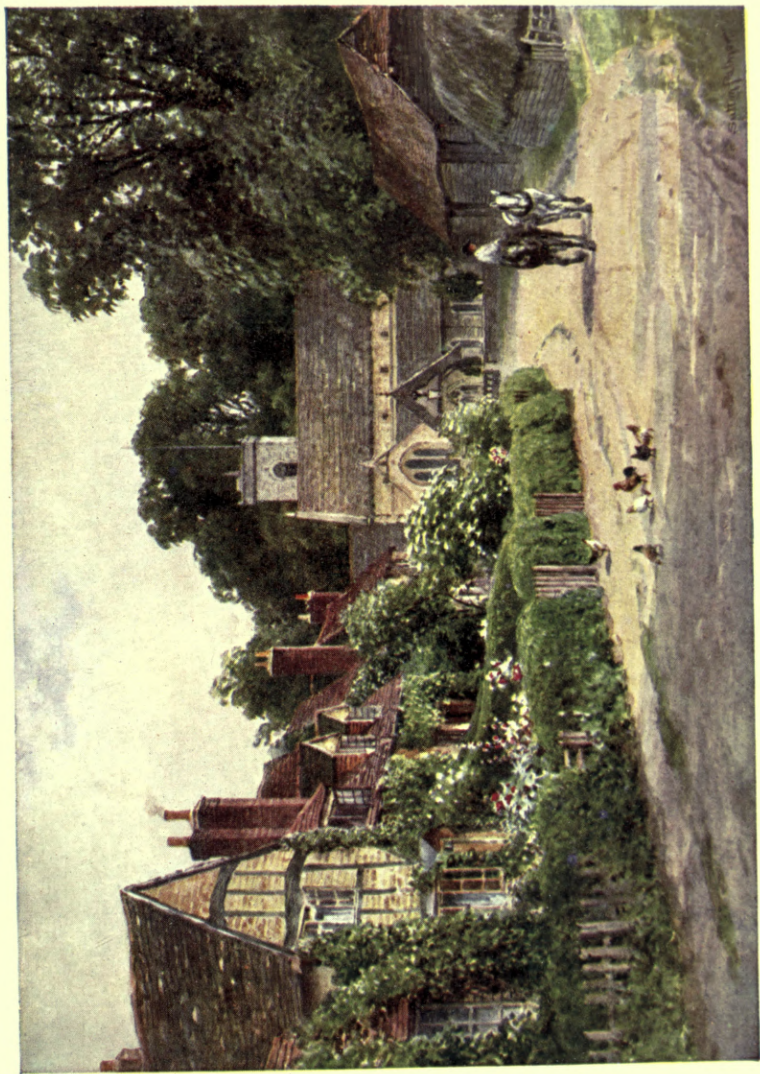
THE VILLAGE OF BETCHWORTH, NEAR DORKING