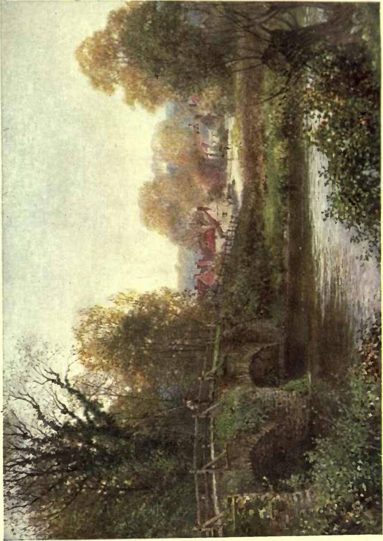
WASHING, NEAR GODALMING