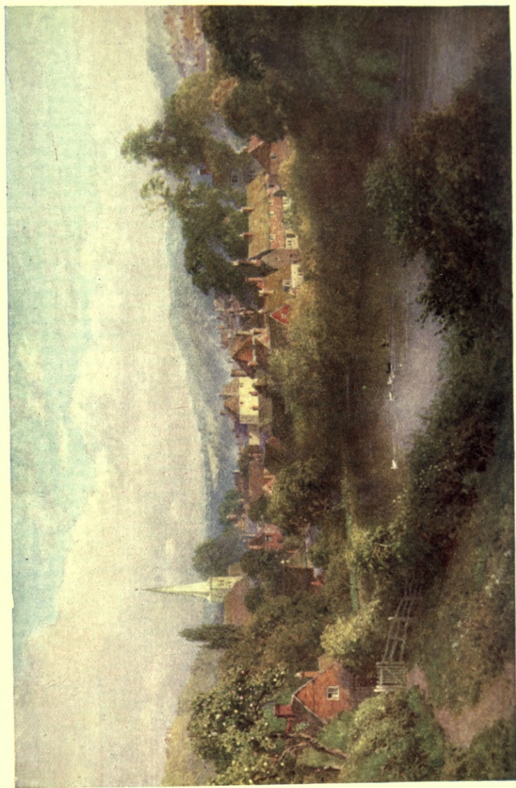
GODALMING: A BIT OF THE OLD TOWN