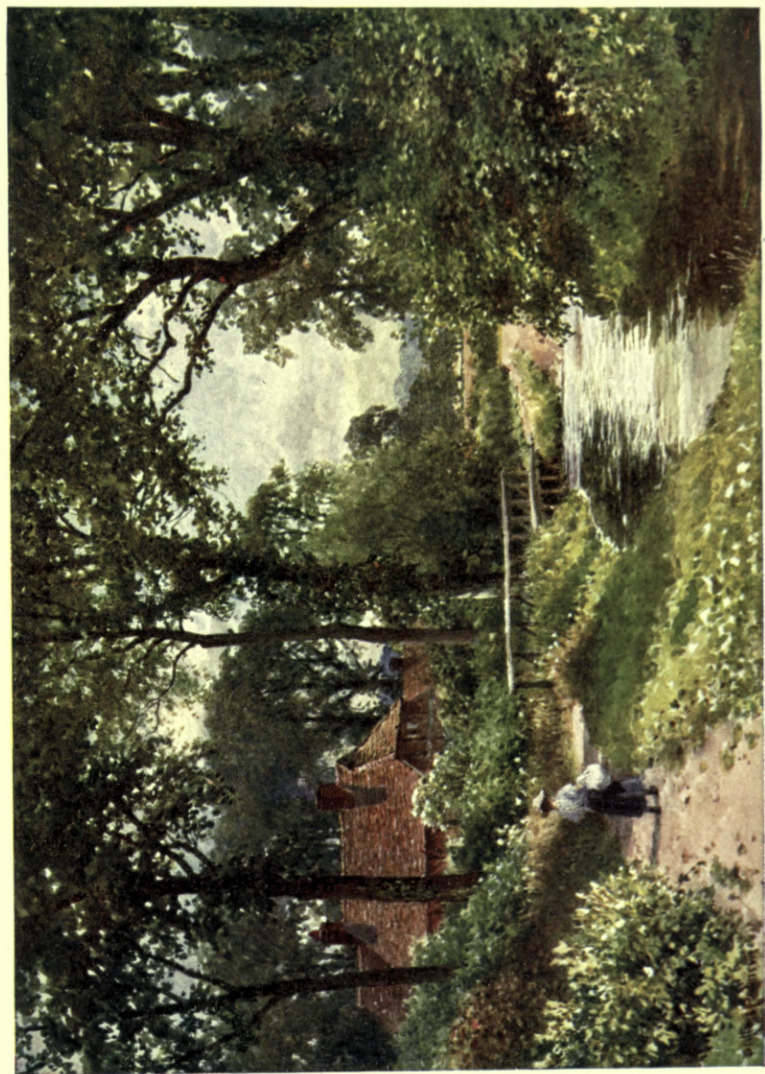
THE BOURNE, CHOBHAM