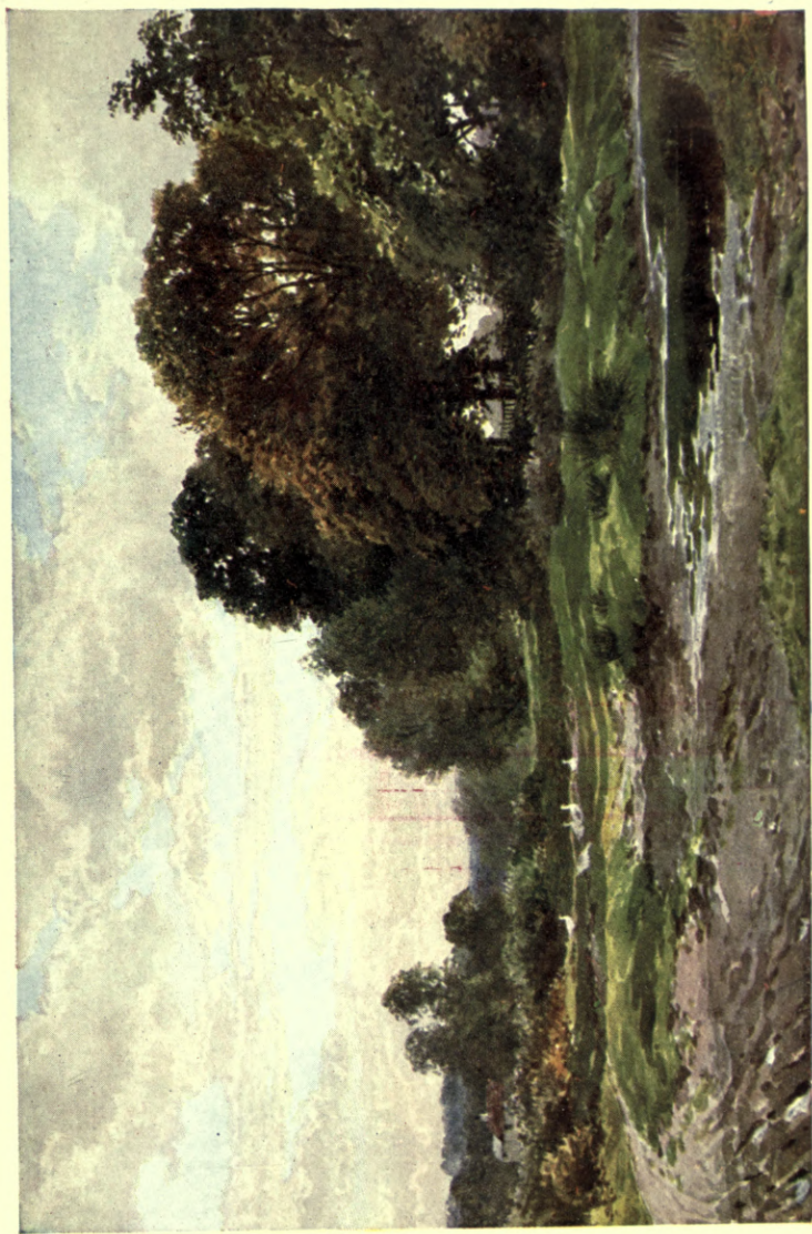
A CORNER OF ESHER COMMON