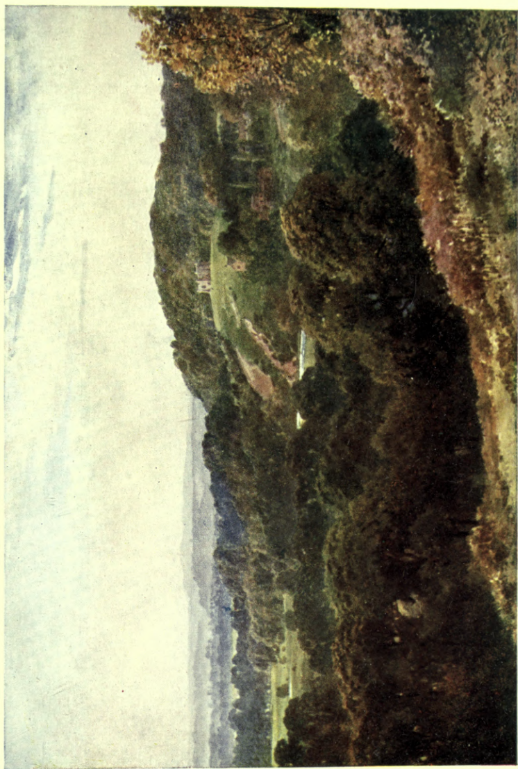
ST. CATHERINE'S CHAPEL, NEAR GUILDFORD