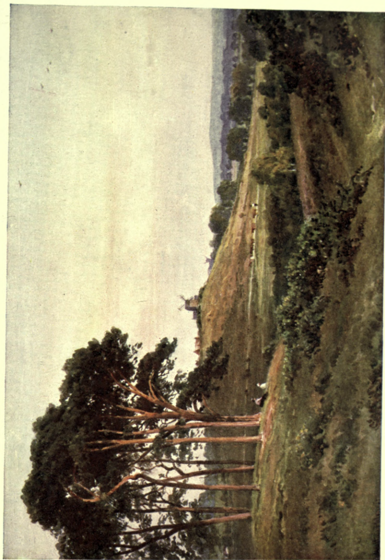
REIGATE HEATH EVENING