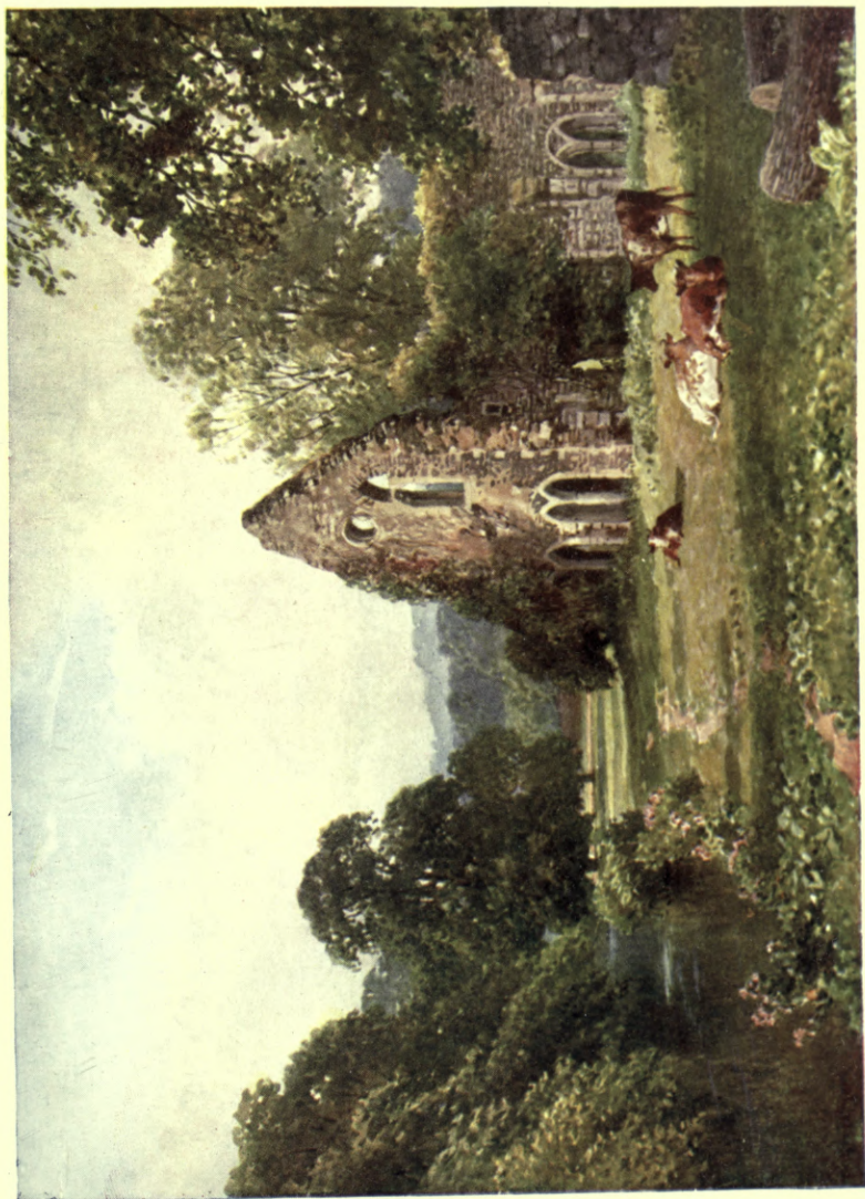
WAVERLEY ABBEY, NEAR FARNHAM