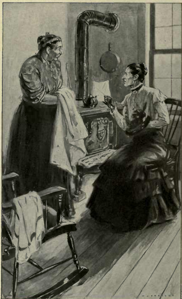
“I wish I’d never gone!” Frontispiece. See page 154