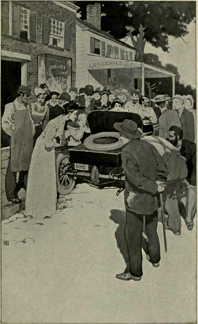
“It’s a brand-new one, fer the price-tag’s still hangin’ on the back.” See page 258.