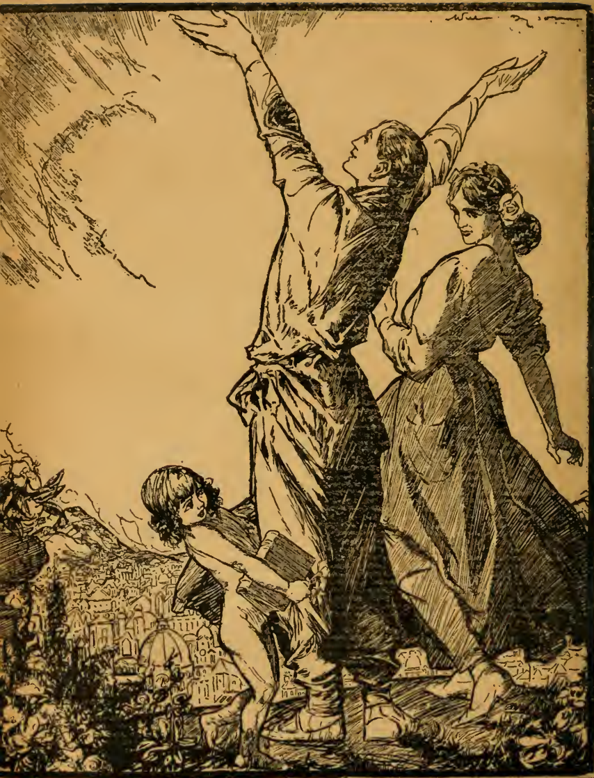
THE BRIGHTER DAY.