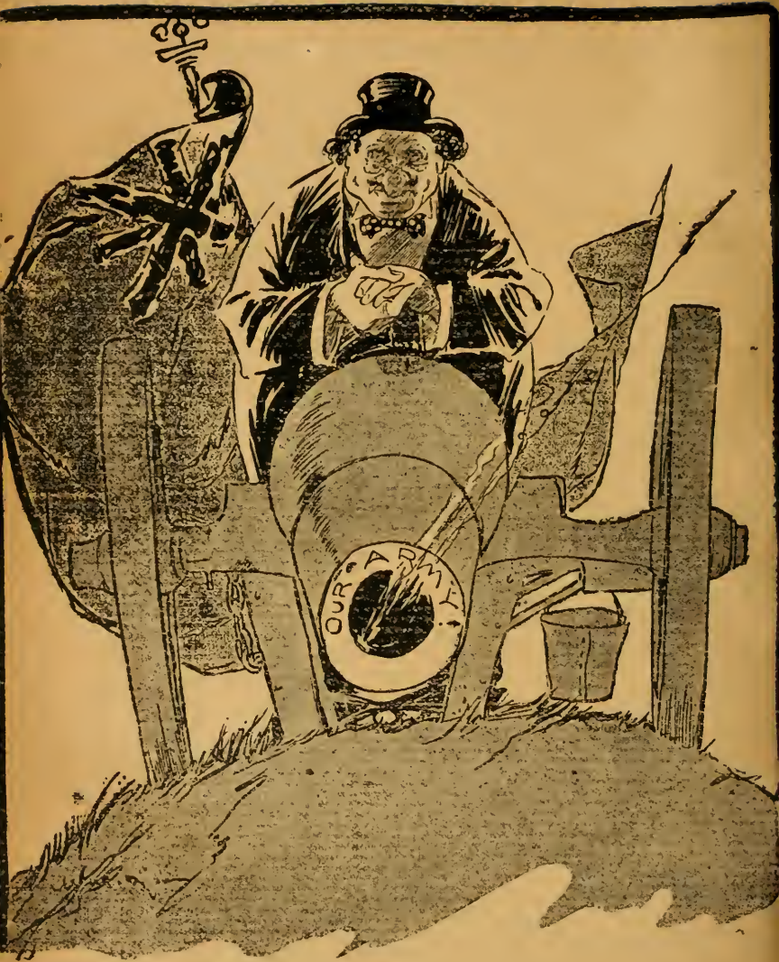
"THE MAN BEHIND THE GUN."