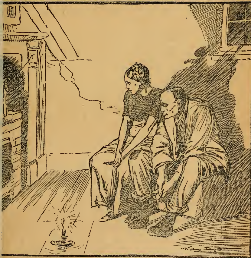
CHRISTMAS EVE. The Empty Stocking.