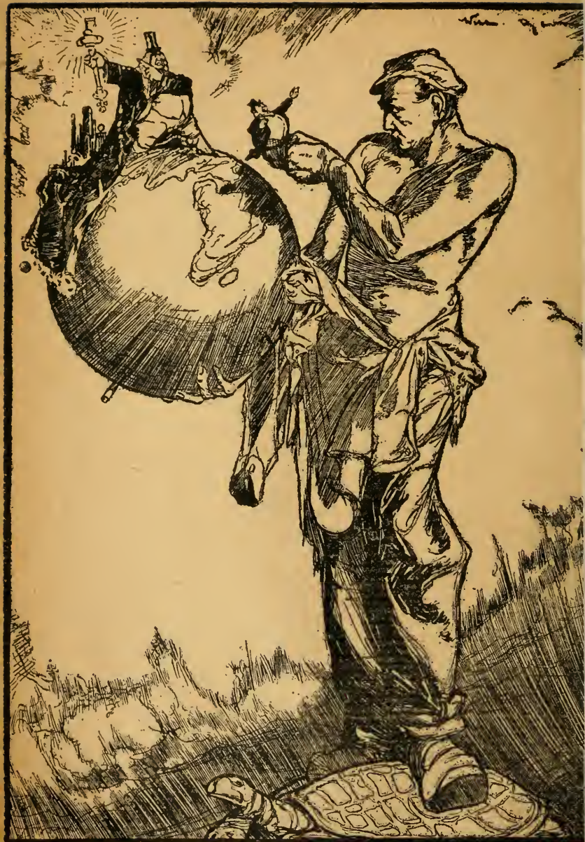
THE DOUBTING ATLAS.