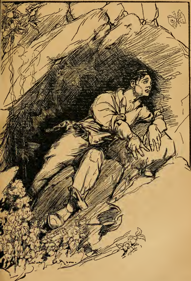
FROM THE ABYSS INTO THE SUNLIGHT.