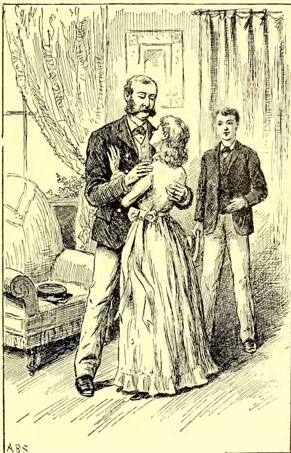
"SHE WAS CLASPED IN HER FATHER'S ARMS" (Page 145)