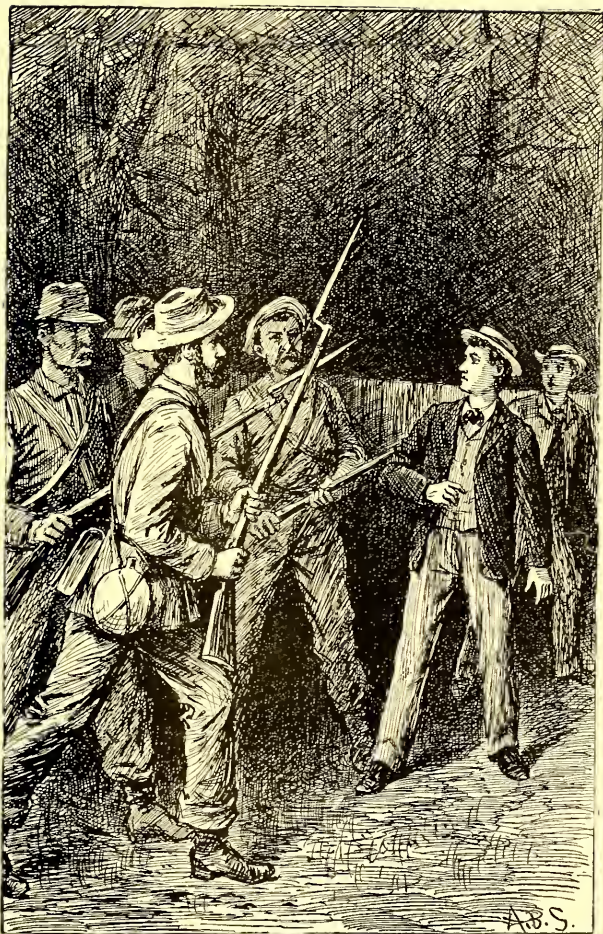
FOUR MEN SPRANG IN FRONT OF HIM (Page 183)