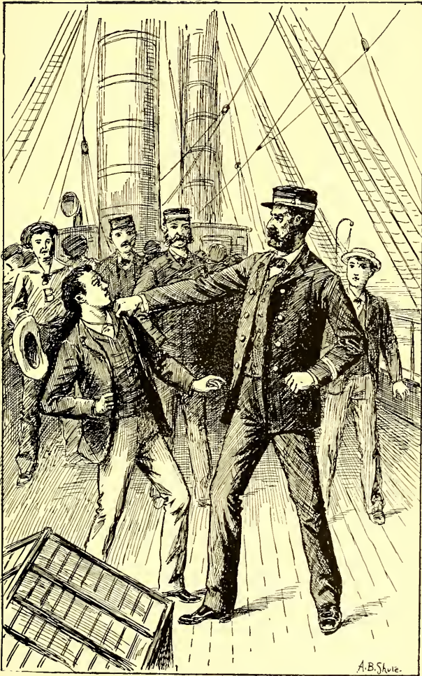
“LET ME ALONE, I AM A SOUTHERN GENTLEMAN” (Page 81)