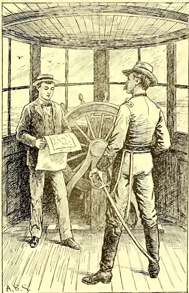
“YOU A SAILOR?” (Page 215)