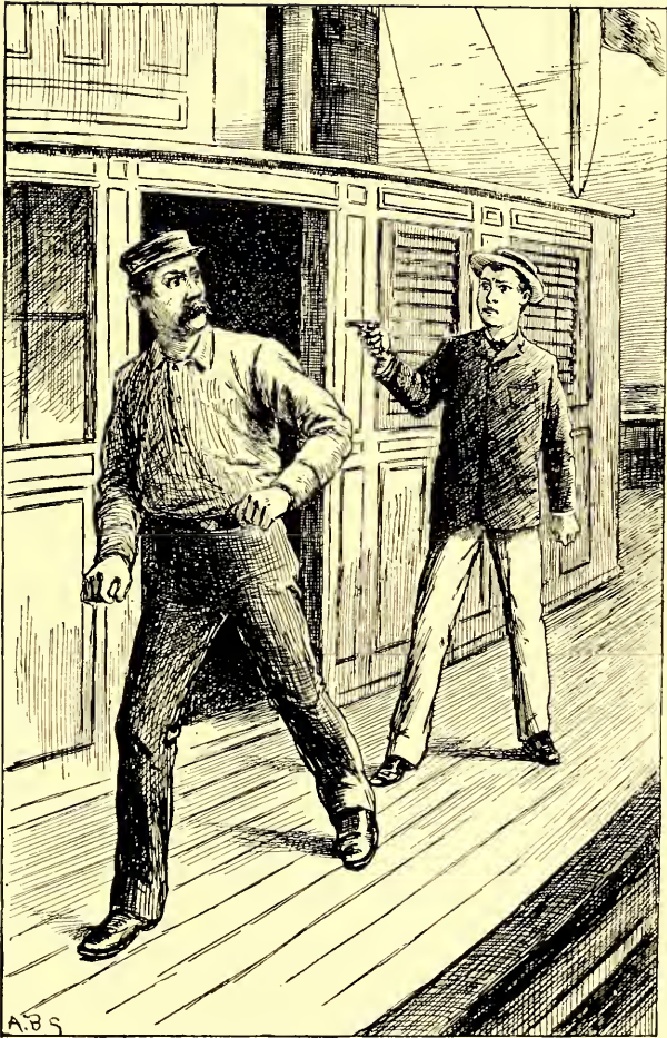
"THE ENGINEER OBEYED" (Page 277)