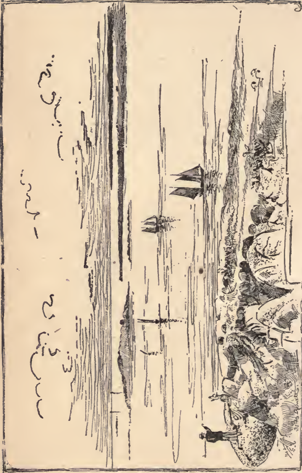
ISLAND BATTERY, WITH LOUISBURG IN THE DISTANCE.