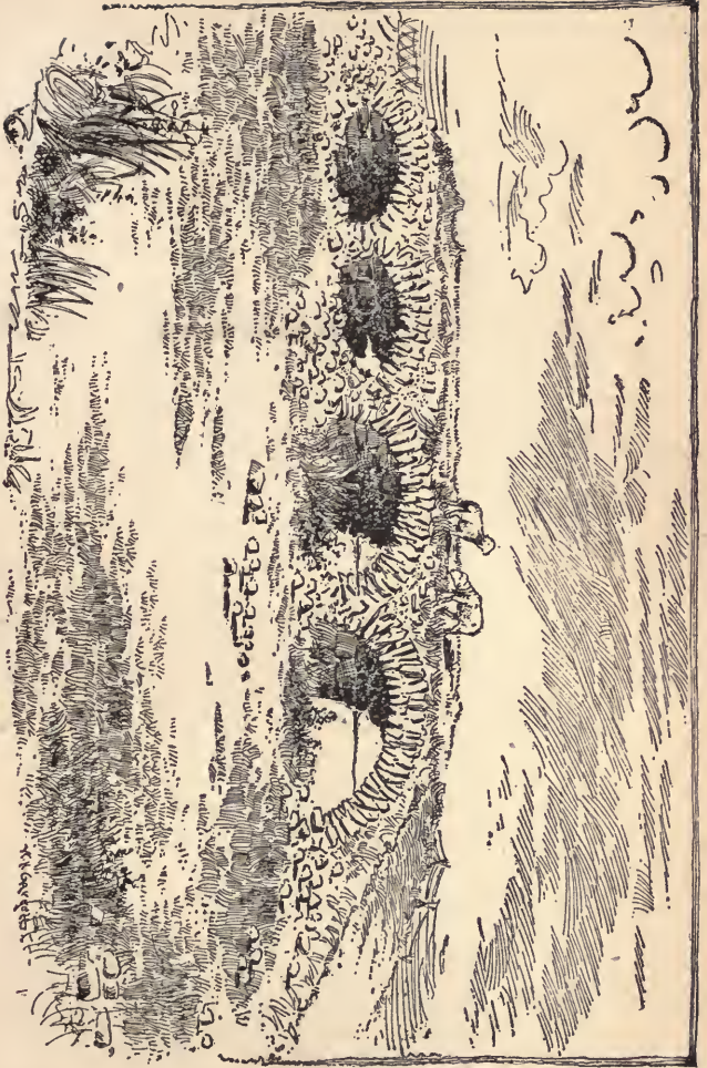
REMAINS OF CASEMATES AT LOUISBURG.