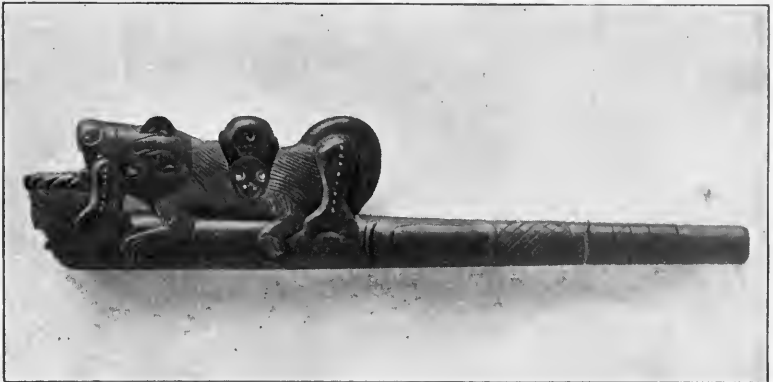
A PIPE WITH WASCO AND WHALES.