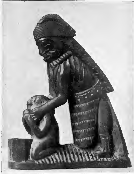
A SKAGGY OR MEDICINE MAN.