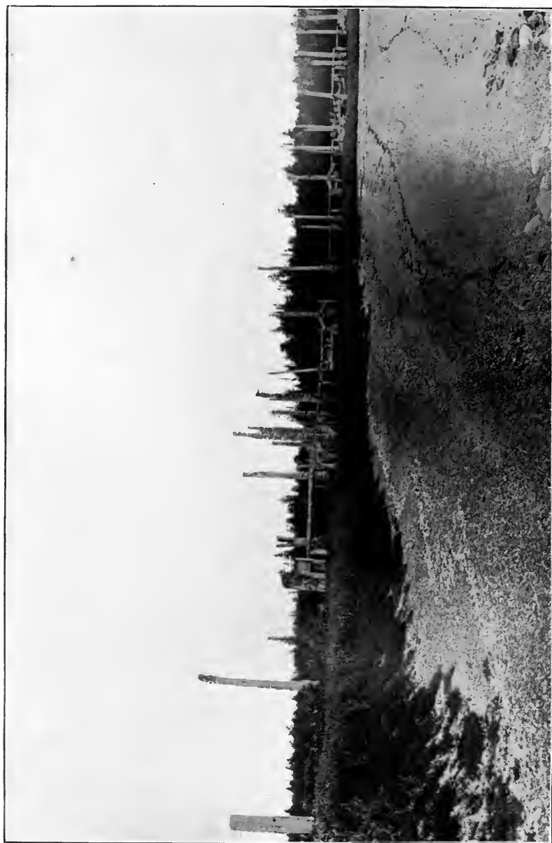
THE SITE OF AN ANCIENT VILLAGE.