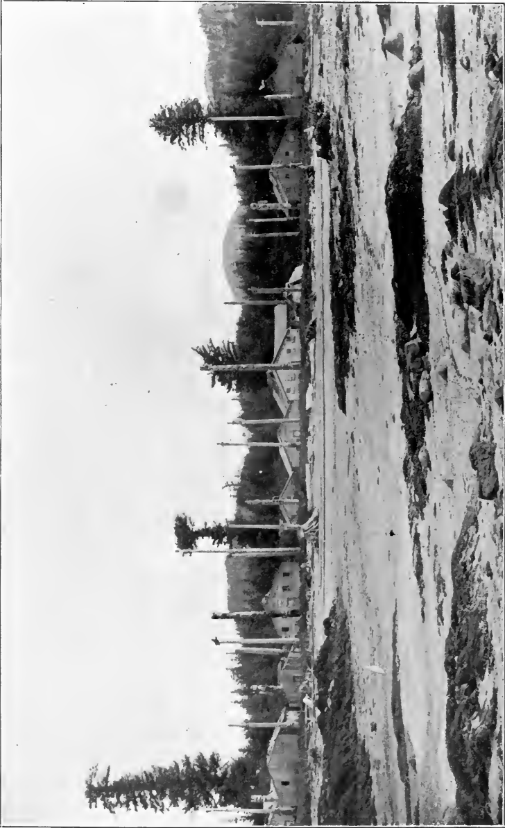
A VILLAGE WITH MODERN HOUSES.