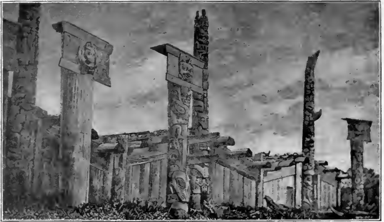
HOUSES AND TOTEM POSTS.