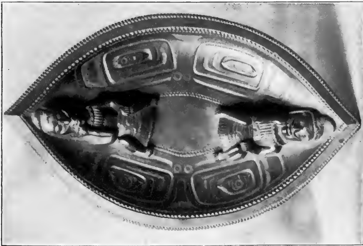
A DISH WITH CARVINGS OF TWO DOCTORS.