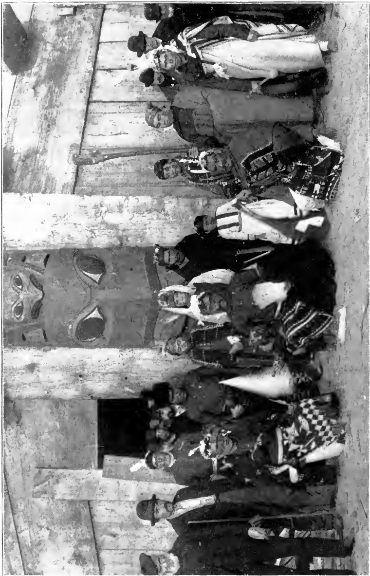
NATIVE INDIANS OF VANCOUVER ISLAND.