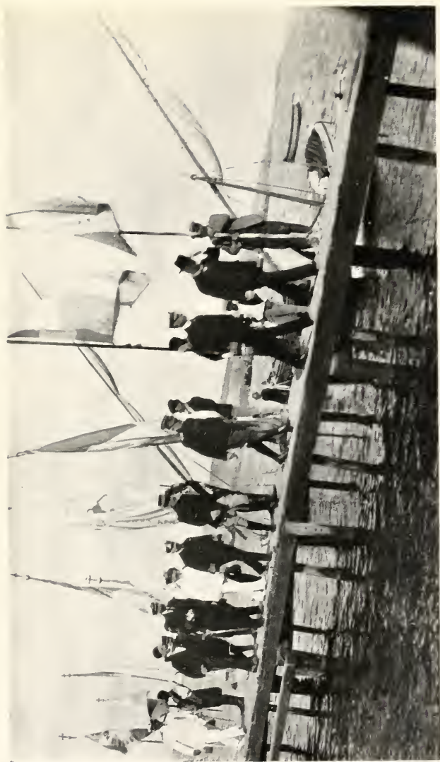
MIR. VENZEFLOS AND ADMIRAL COUNTDURIOTIS LANDING AT SUDA.