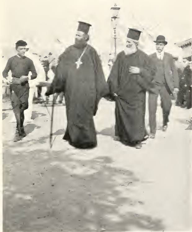
THE BISHOP OF CANEA RETURNING FROM HIS VISIT ABOARD VENIZELOS' SHIP.