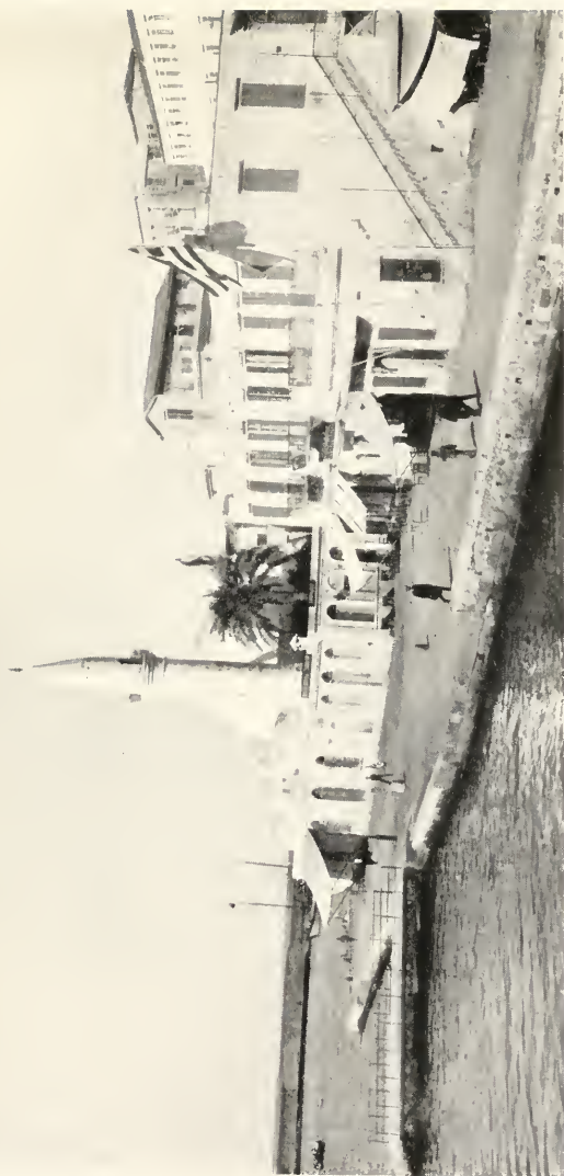
THE EAST QUAY AT CANEA, WITH THE PREFECT'S OFFICES.