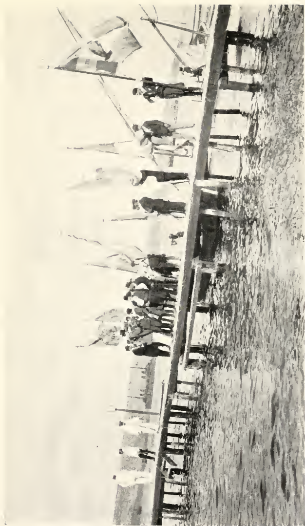
SUDA BAY AS SEEN FROM SUDA VILLAGE.