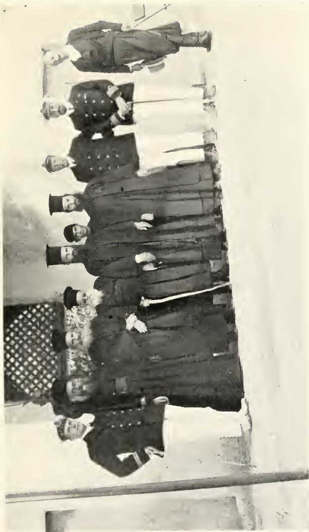
A TYPICAL GROUP OF GREEK MONKS TOGETHER WITH THE DOCTOR ( left ), THE AUTHOR, AND THE ENGINEER-COMMANDER ( right ).