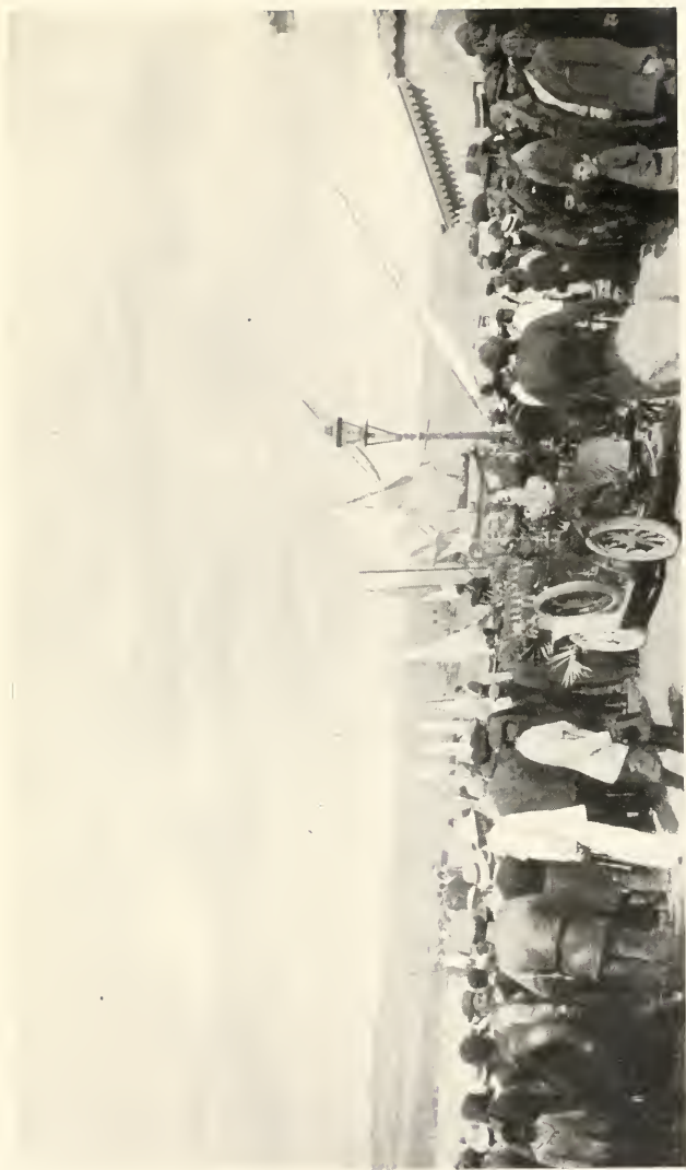
SOME OF CAPETAN JANNIS' ARMY, AWAITING THE LANDING OF VENEZELOS.