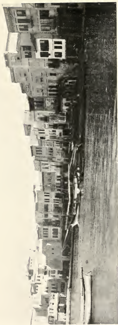
THE SOUTH QUAY AT CANEA, THE SCENE OF THE RAID.