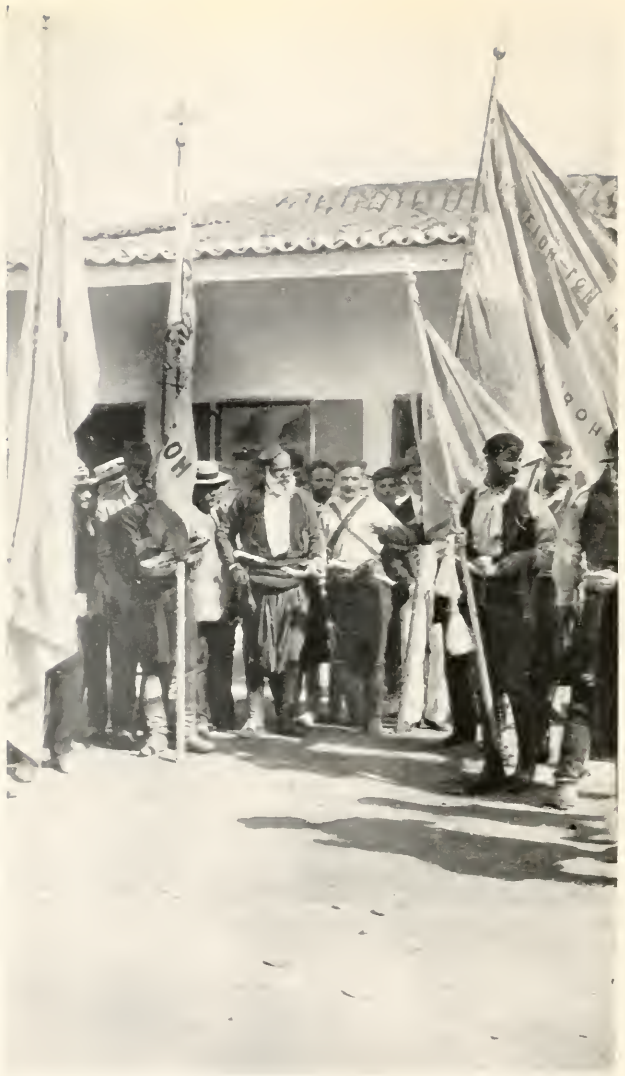
A LOCAL CHIEFTAIN AND HIS FOLLOWERS.