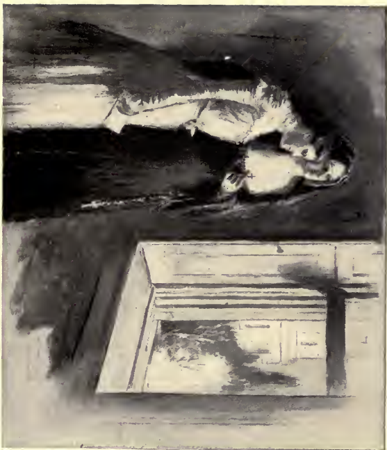
“STANDING AT THE WINDOW OVERLOOKING THE CONVENT GARDEN”