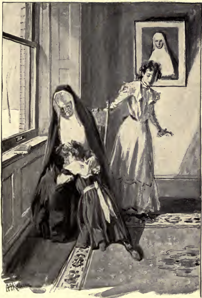
“THE IMP CONQUERED AND REPENTANT”