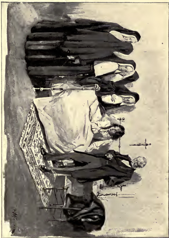
" ' I KNOW THAT MUSIC ' "