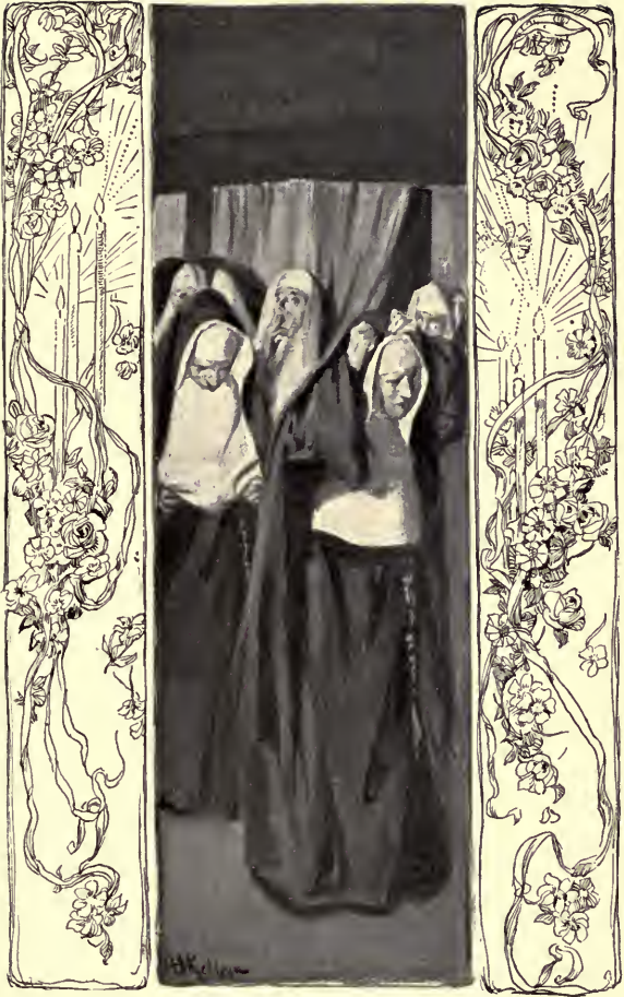
“THE NUNS DRESSED DROWSILY”