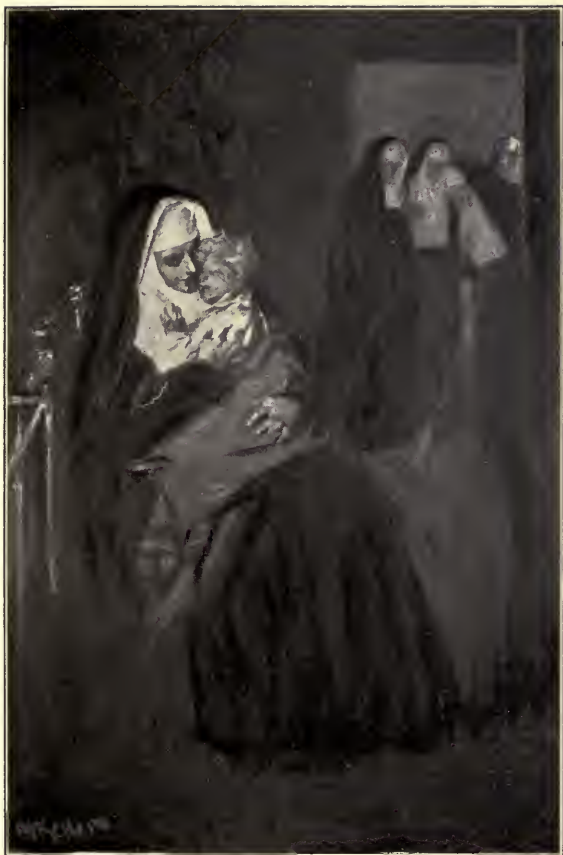
“CROONING THE LITTLE LULLABY HE HAD DEMANDED”