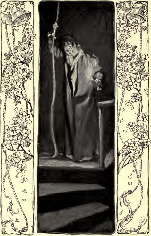
“ SHE RANG SLOWLY AND STEADILY ”