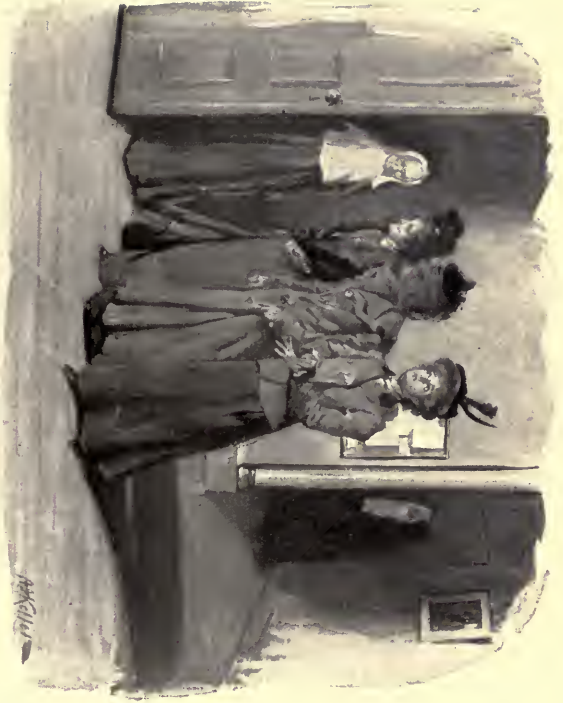
“ THEN WE ALL STROLLED OUT TOGETHER ”