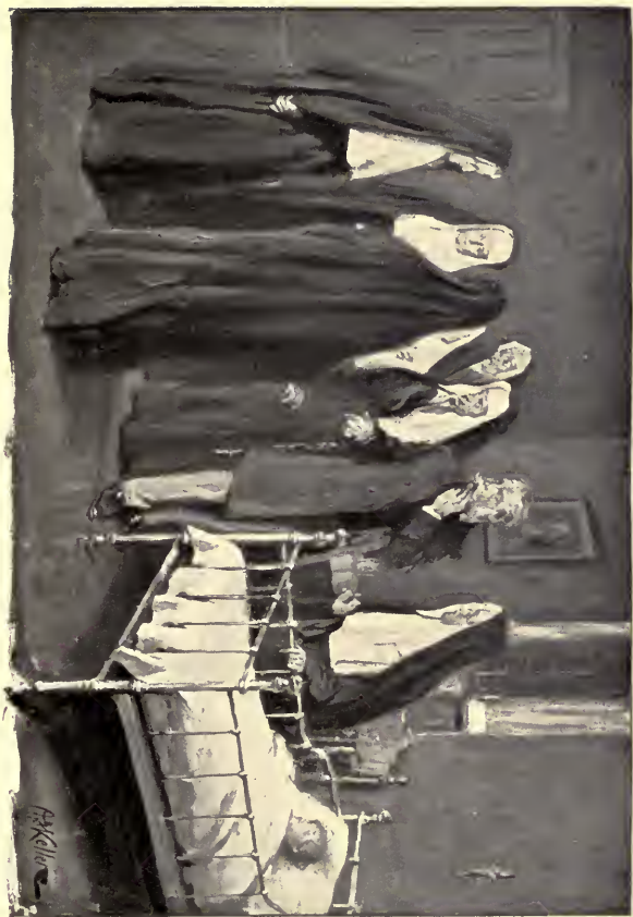
"THEY HAD NOT KNOWN SHE WAS THERE"