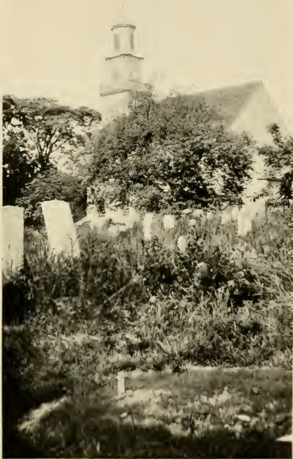
PRESBYTERIAN CHURCH AT SETAUKET, LONG ISLAND, ERECTED IN 1811 ON THE SITE OF THE ORIGINAL BUILDING WHICH WAS ERECTED IN 1671

The Church stands upon an eminence but a short distance from the site of the original Manor House and within easy walking distance.