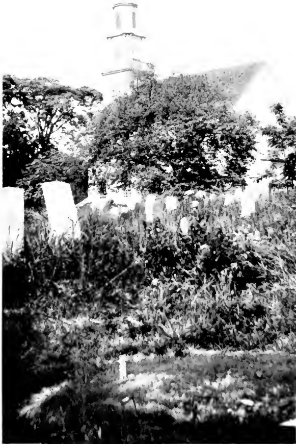
PRESBYTERIAN CHURCH AT SETAUKET, LONG ISLAND, ERECTED IN 1811 ON THE SITE OF THE ORIGINAL BUILDING WHICH WAS ERECTED IN 1671

The Church stands upon an eminence but a short distance from the site of the original Manor House and within easy walking distance.