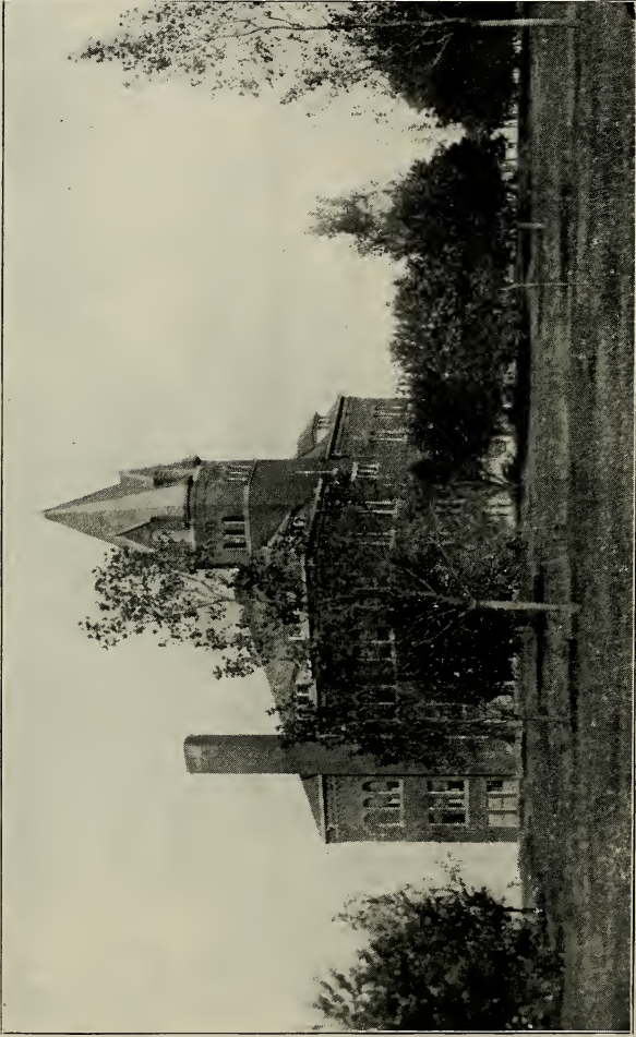
H. MARIA WRIGHT HALL