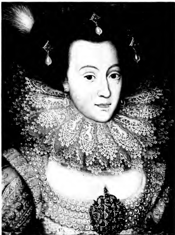
The Princess Elizabeth, daughter of King James I