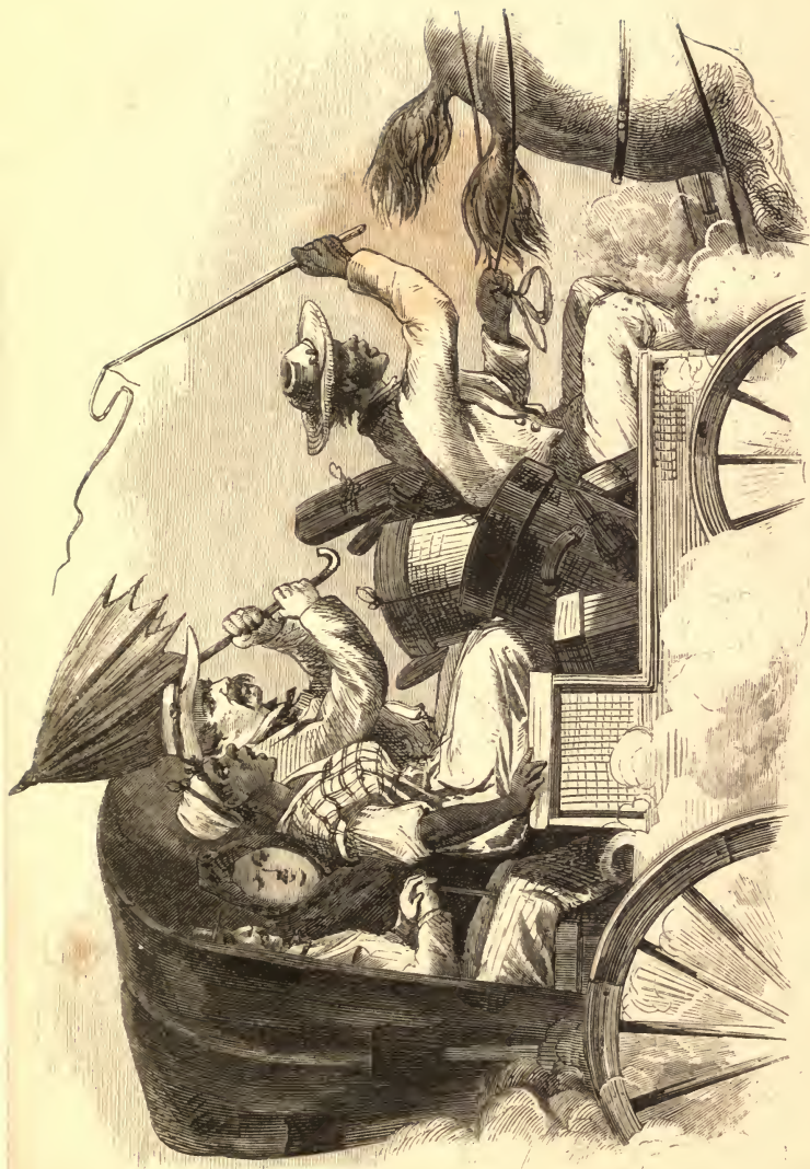
THE DRIVE TO PARAHIBA.