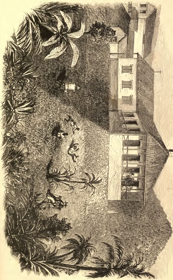
COTTAGE AT RHODEO.