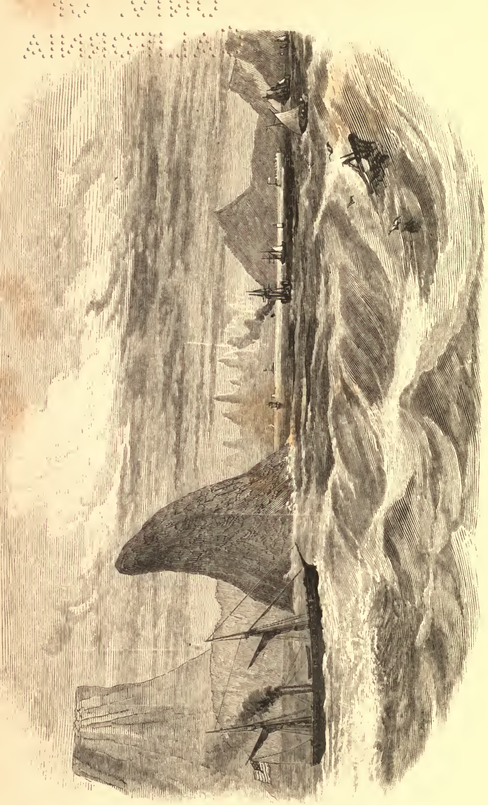
ENTRANCE TO RIO DE JANEIRO.—Page 39.