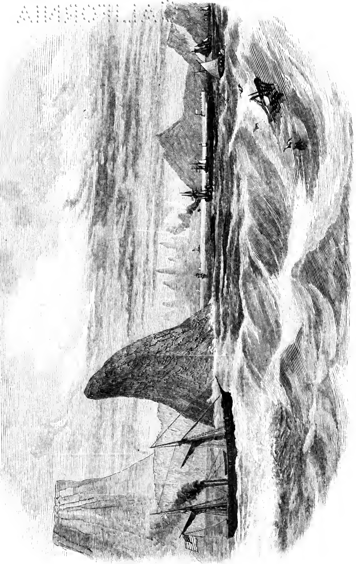
ENTRANCE TO RIO DE JANEIRO.—Page 39.