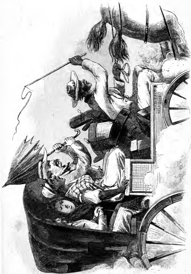
THE DRIVE TO PARAHIBA.