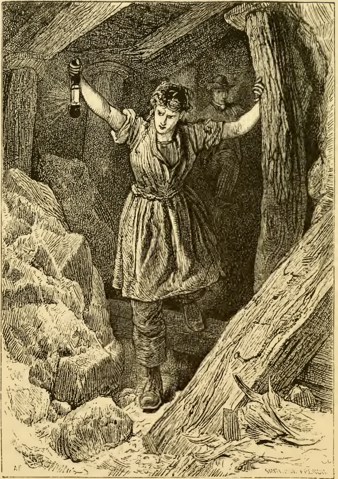
SHE STEPPED INTO THE GALLERY BEFORE HE COULD PROTEST.