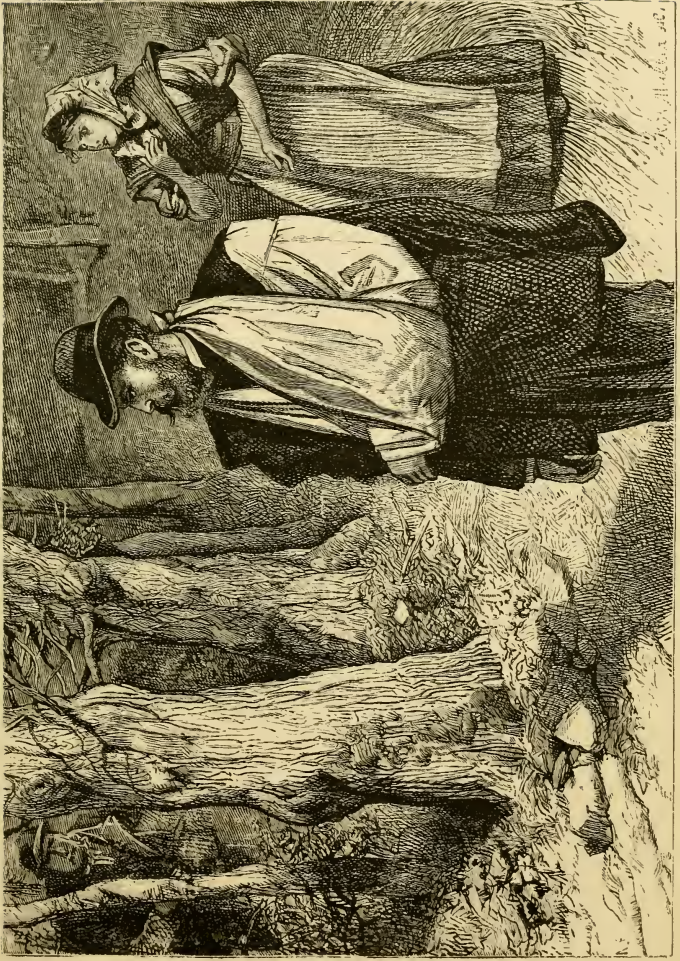
JOAN HALTED SUDDENLY.