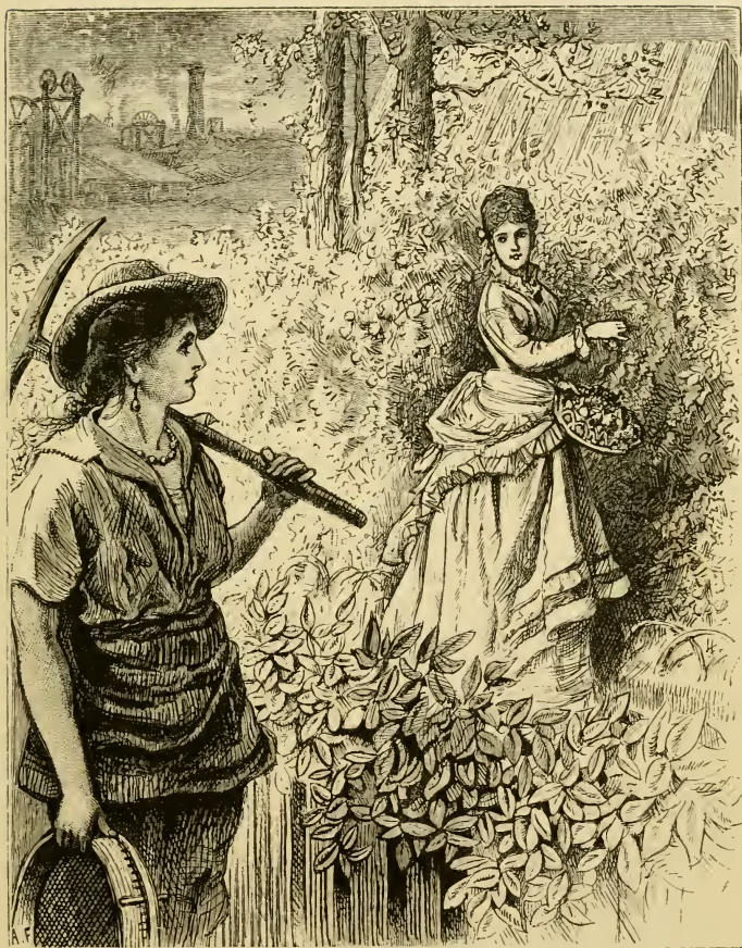
THEN IT WAS THAT ANICE TURNED AROUND AND SAW HER.