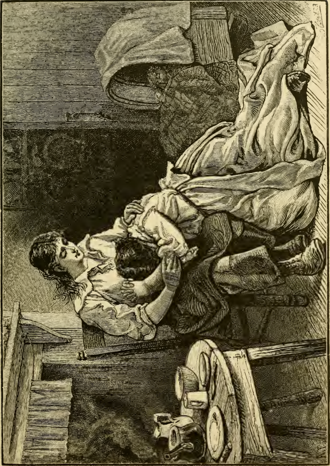
SHE DREW THE CURLY HEAD DOWN UPON HER LAP.