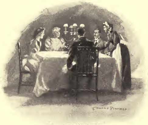
“ THAT LITTLE SUPPER ”