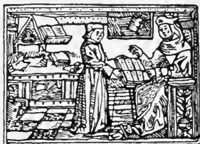
A Scholar Press Facsimile