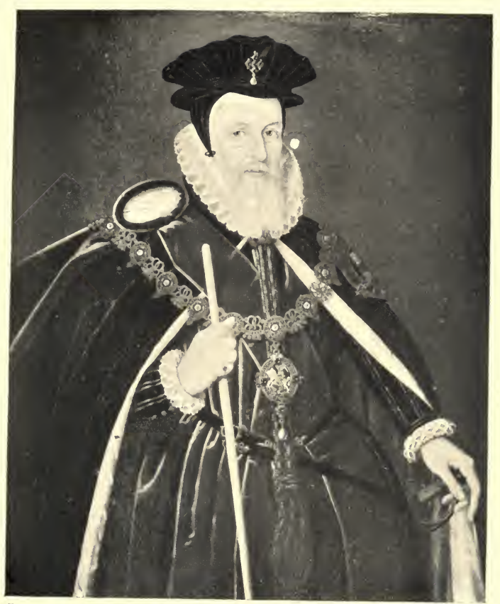
Emery Walker photo.]