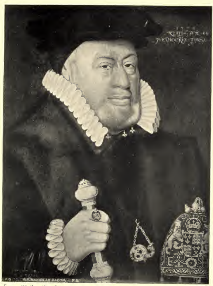
Emery Walker photo.]