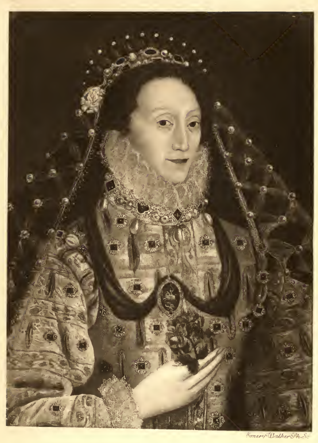
Queen Elizabeth from a picture probable by Marc Gheeraedts in the National Portrait Gallere