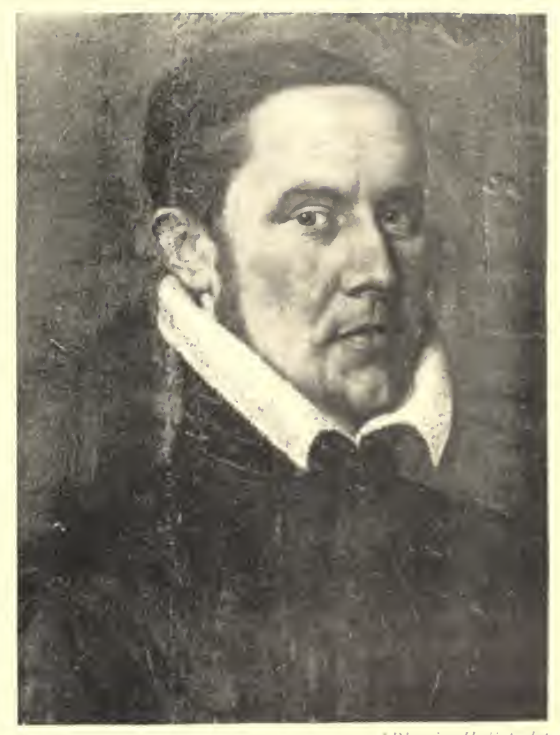
Plowden Hall, Salop