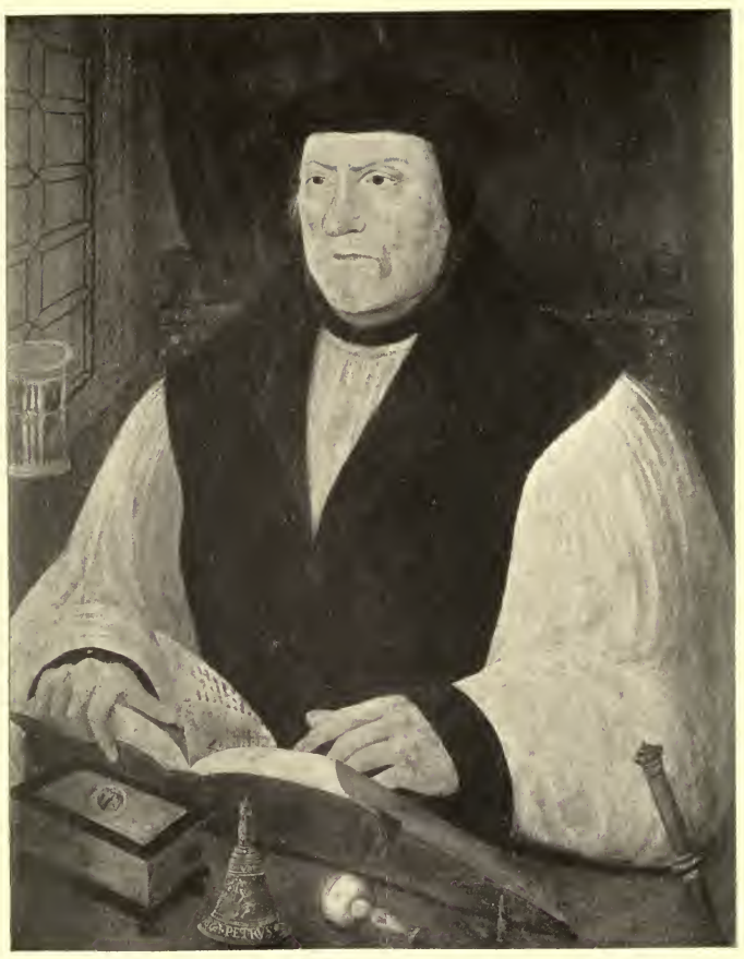
Emery Walker photo.]