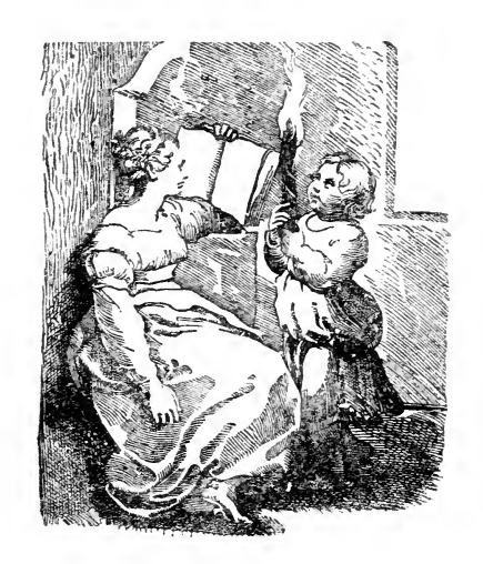
London MACMILLAN AND CO., LIMITED